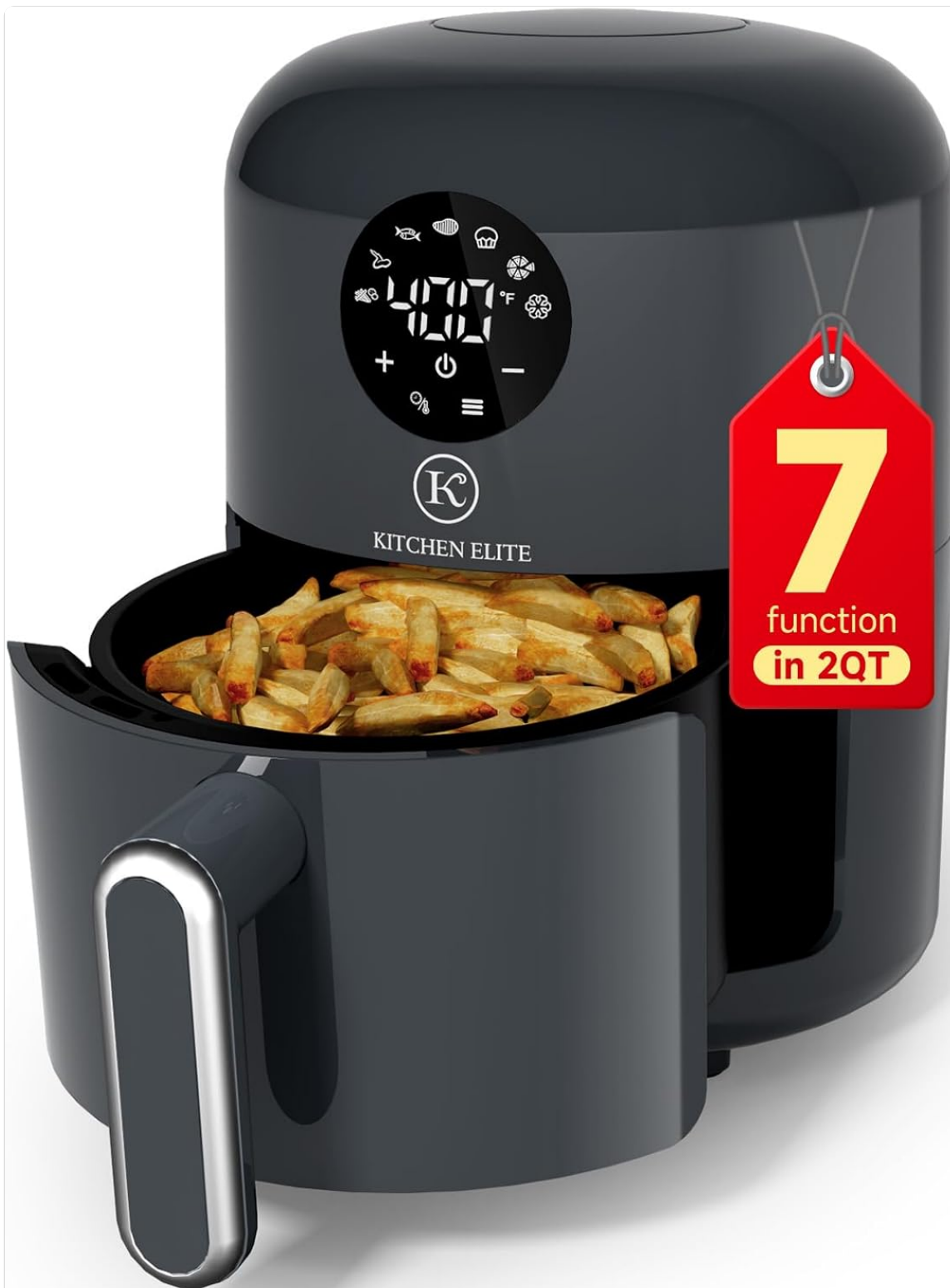
Image: The Kitchen Elite Compact Air Fryer with its basket partially removed, showcasing its compact design and capacity for a single serving of french fries.