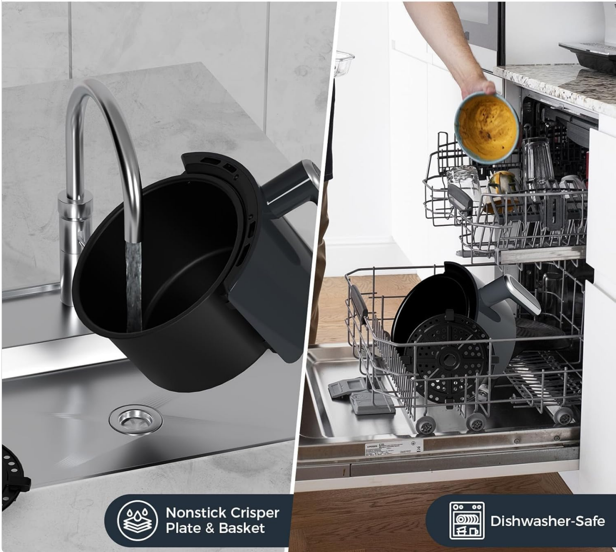
Image: Visual guide demonstrating the effortless cleaning process, showing the air fryer basket being rinsed under a faucet and then placed in a dishwasher, highlighting its nonstick and dishwasher-safe features.