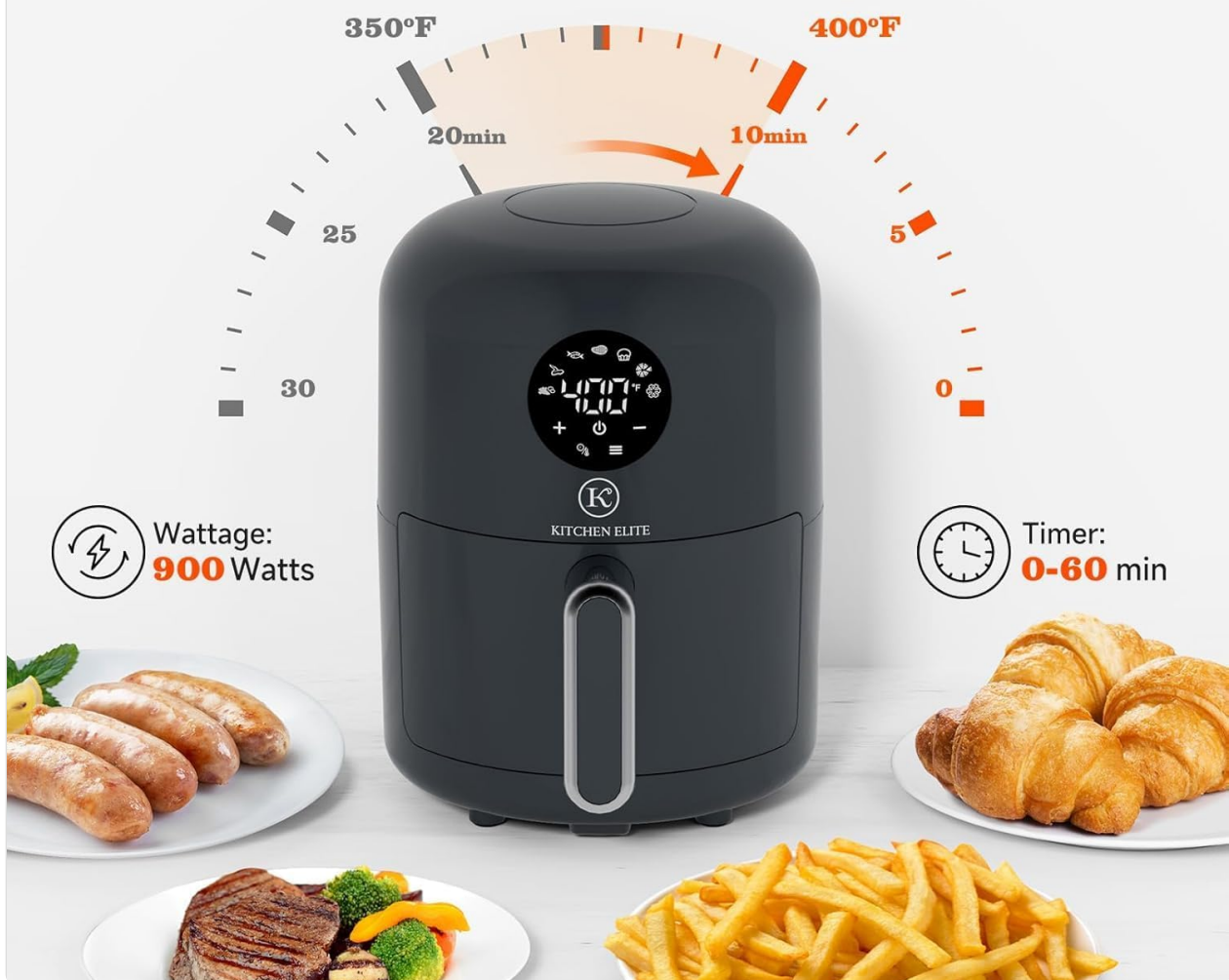
Image: Diagram illustrating the air fryer's efficiency, showing it can cook 50% faster than traditional methods with 900 Watts power and a 0-60 minute timer.

Cooking efficiency is 50% faster than traditional cooking methods.