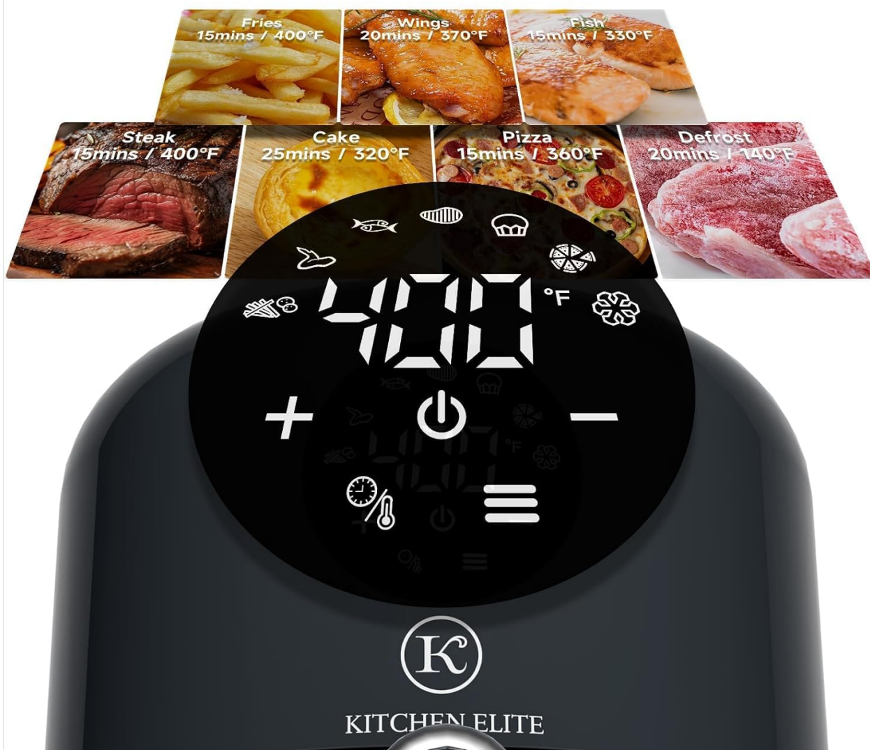
Image: The digital display of the air fryer highlighting its 7 rich preset functions for various food types like fries, wings, fish, steak, cake, pizza, and defrost.

Compact & multi-functional, such as frying, baking and boiling, suitable for a wide range of dishes