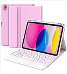
Image: MoKo customer service is available for support.

MoKo products are designed for durability and performance. For warranty information or technical support, please refer to the contact details provided with your purchase or visit the official MoKo website. Our customer service team is available to assist you with any questions or concerns regarding your product.