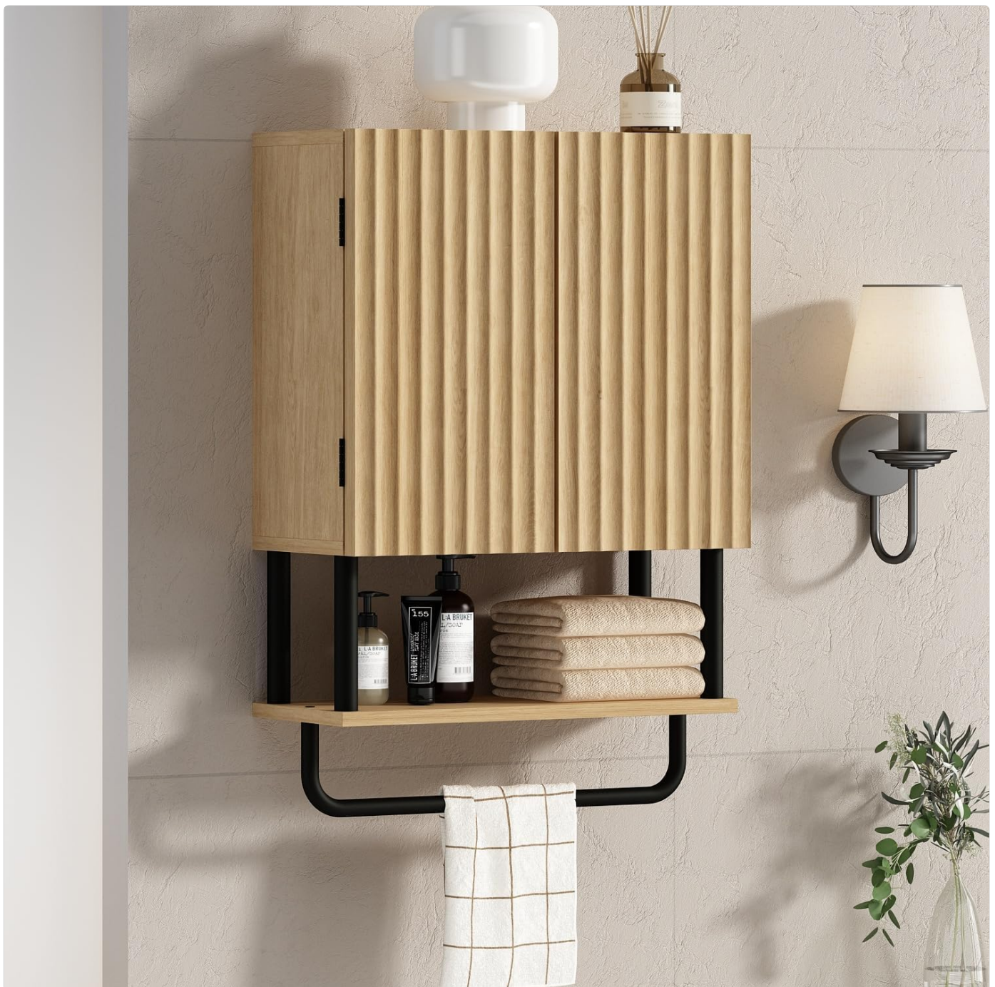
Image 1: The RUSTOWN Fluted Wall-Mounted Bathroom Cabinet, showcasing its design and typical installation above a vanity.