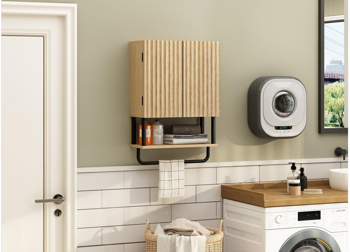
Image 4: The cabinet's suitability for multiple scenes, including bathroom, kitchen, living room, and bedroom.