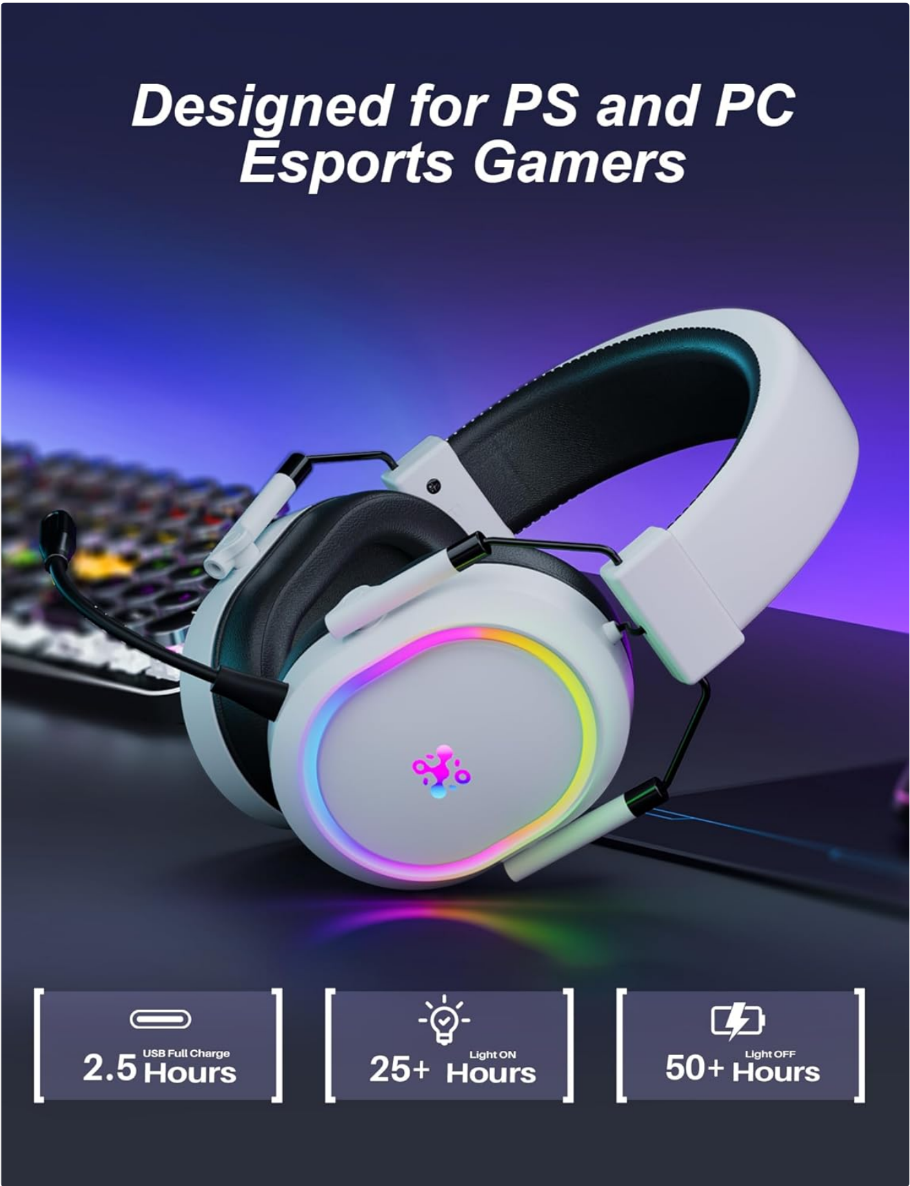
Image: Visual display of battery performance, indicating 2.5 hours for full charge, 25+ hours with lights on, and 50+ hours with lights off.

Enjoy extended gaming sessions with over 50 hours of battery life (with RGB lighting off) on a single charge. The headset recharges fully in approximately 2.5 hours via the USB-C port.