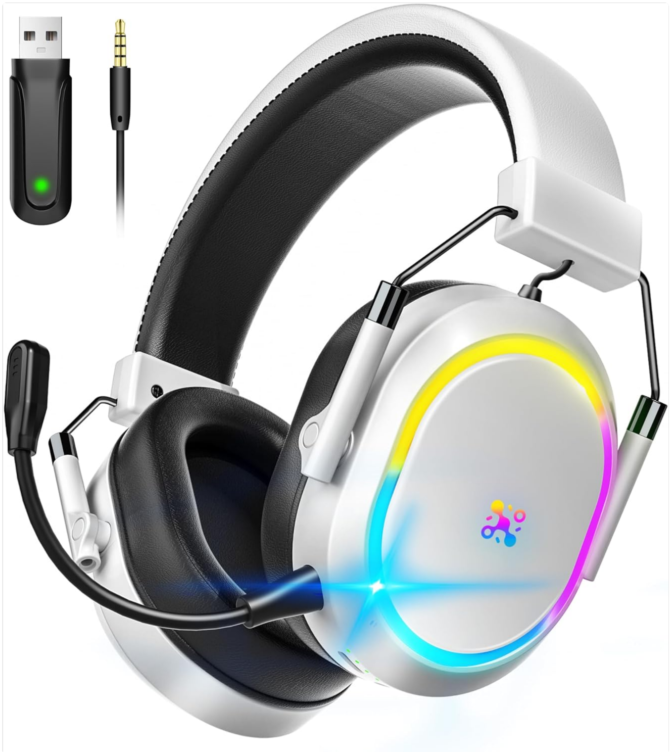
Image: The Taihiro F02 Wireless Gaming Headset shown with its USB dongle and 3.5mm audio cable.

Your browser does not support the video tag.