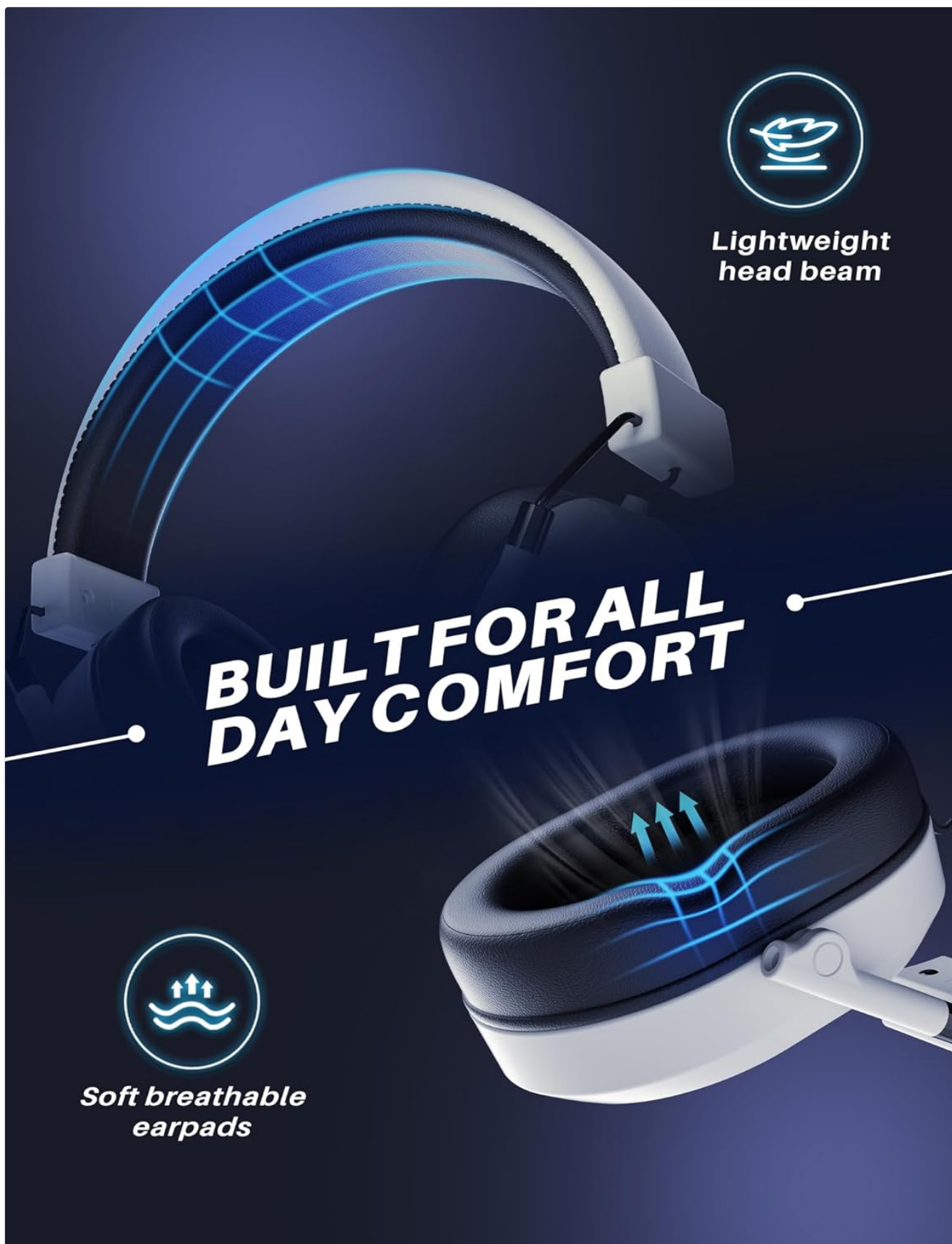
Image: Focus on the headset's lightweight head beam and soft breathable earpads, emphasizing comfort for extended use.

Your browser does not support the video tag.