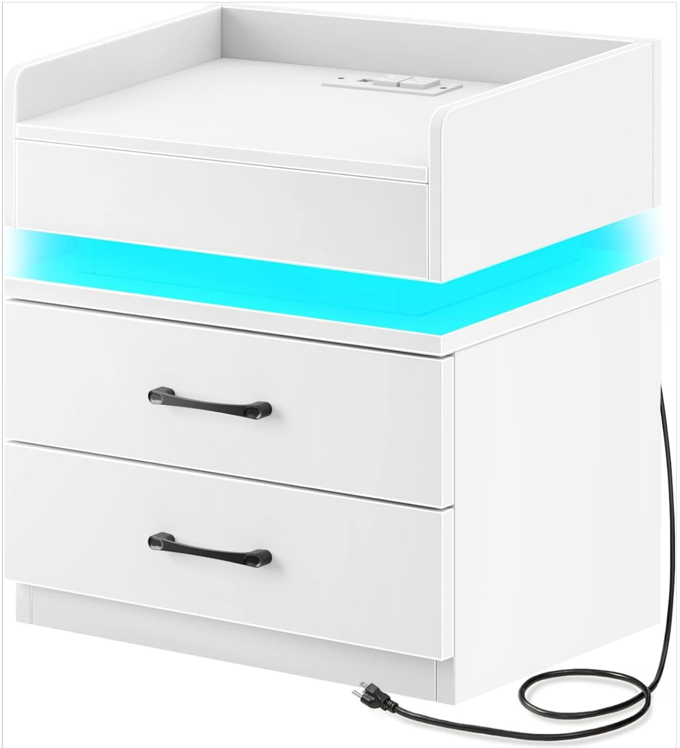
Image: Front view of the 4ever2buy White LED Nightstand, showcasing its semi-floating design, two drawers, and the blue LED light strip.