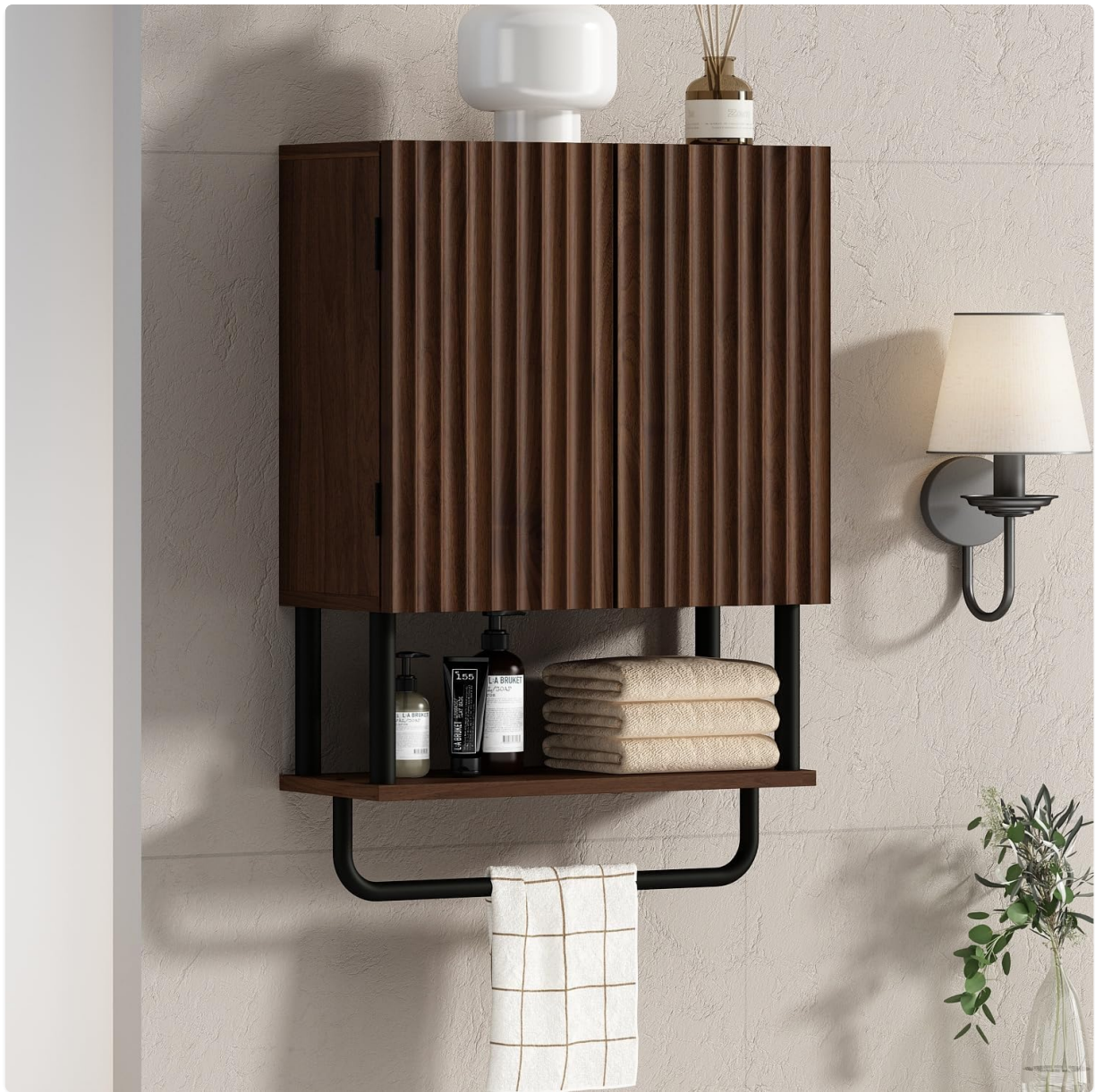
Image 1: RUSTOWN Farmhouse Wall Cabinet (Dark Walnut) in a bathroom setting.