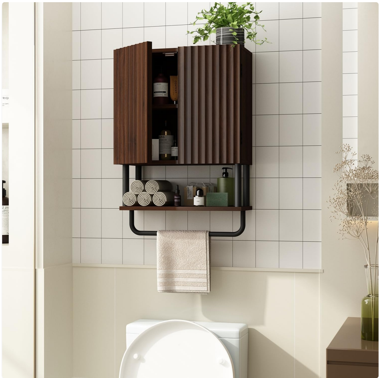
Image 4: Cabinet installed above a toilet, demonstrating practical use.