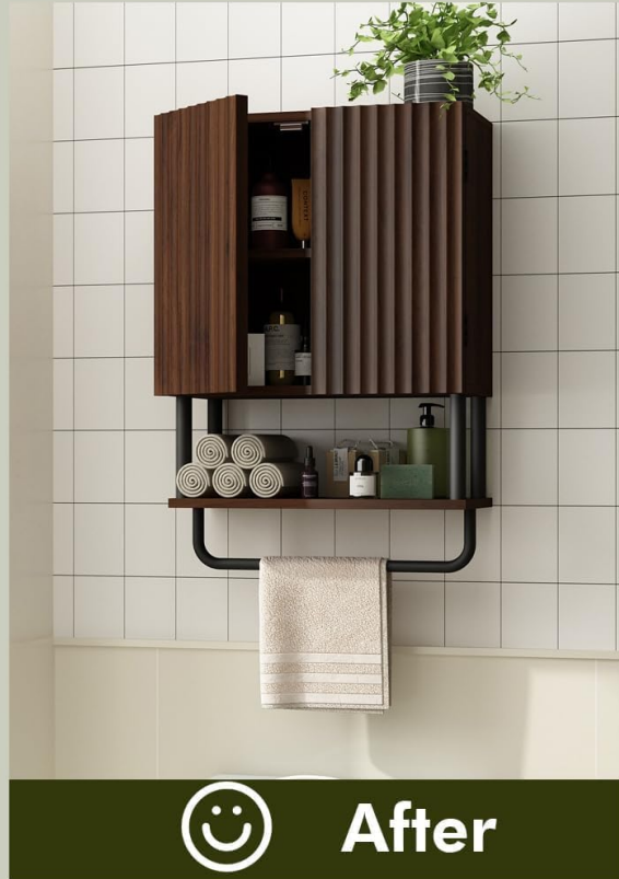
Image 2: Visual representation of the cabinet's large storage capacity.