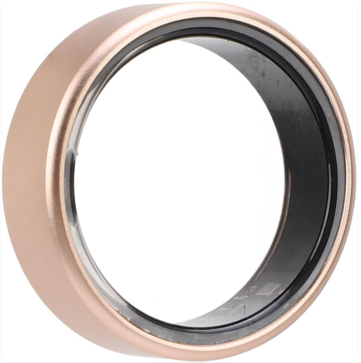
Image: Top view of the Cuifati Smart Ring, showcasing its sleek design and inner sensor area.