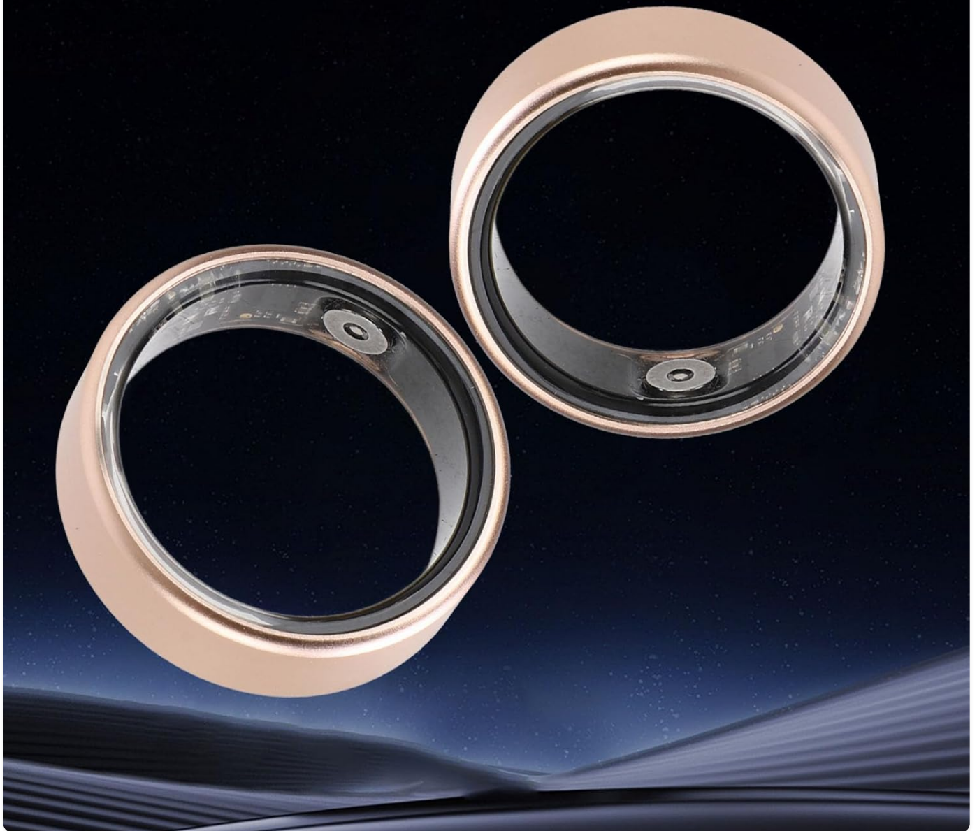
Image: Two Cuifati Smart Rings, highlighting the lightweight aluminum alloy material and comfortable design.

Aluminium alloy smart ring with high strength and lightweight design Bringing long lasting comfort and senseless technology to your fingertips