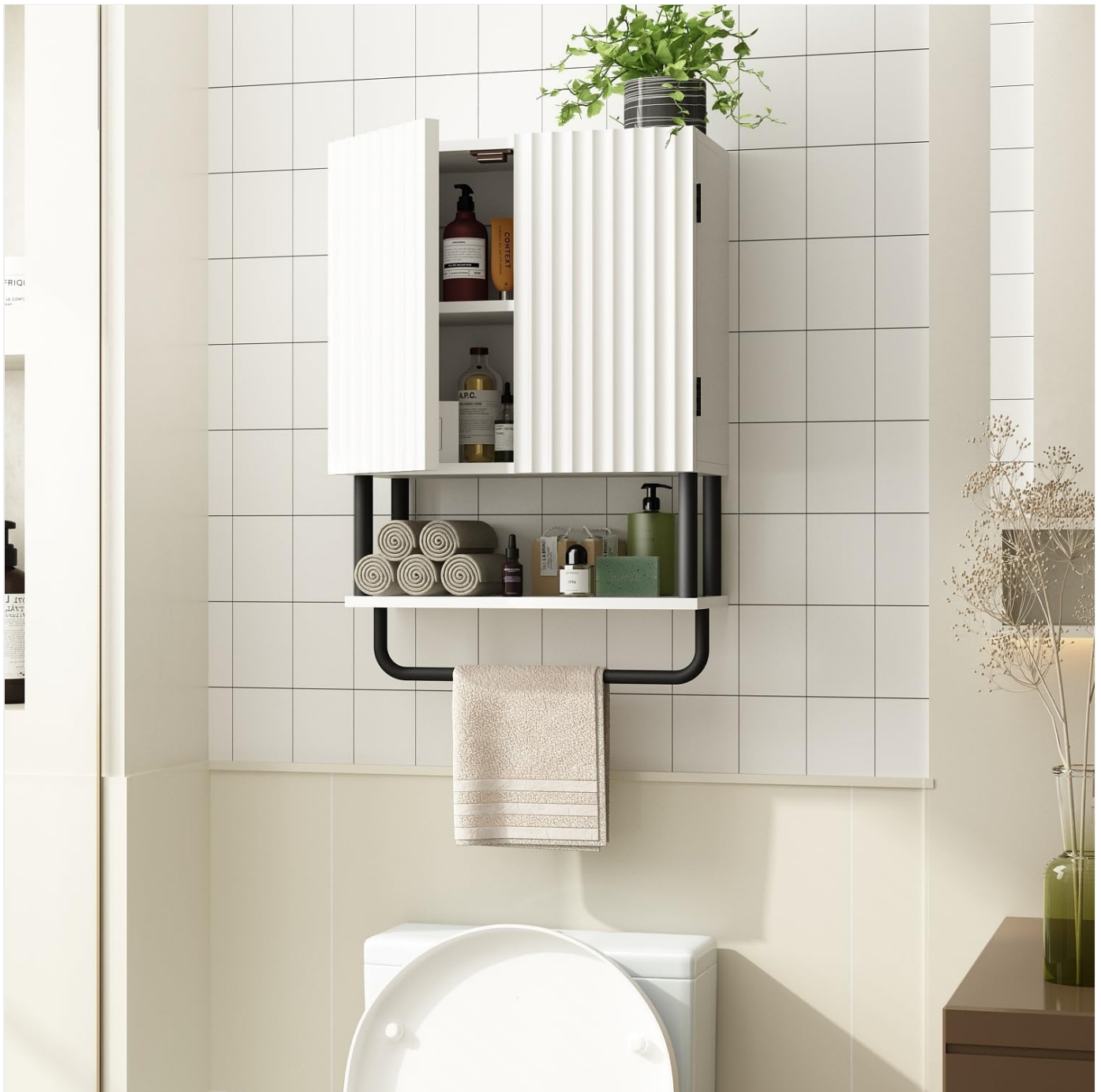
Image 4: Cabinet installed in a bathroom, demonstrating typical usage.