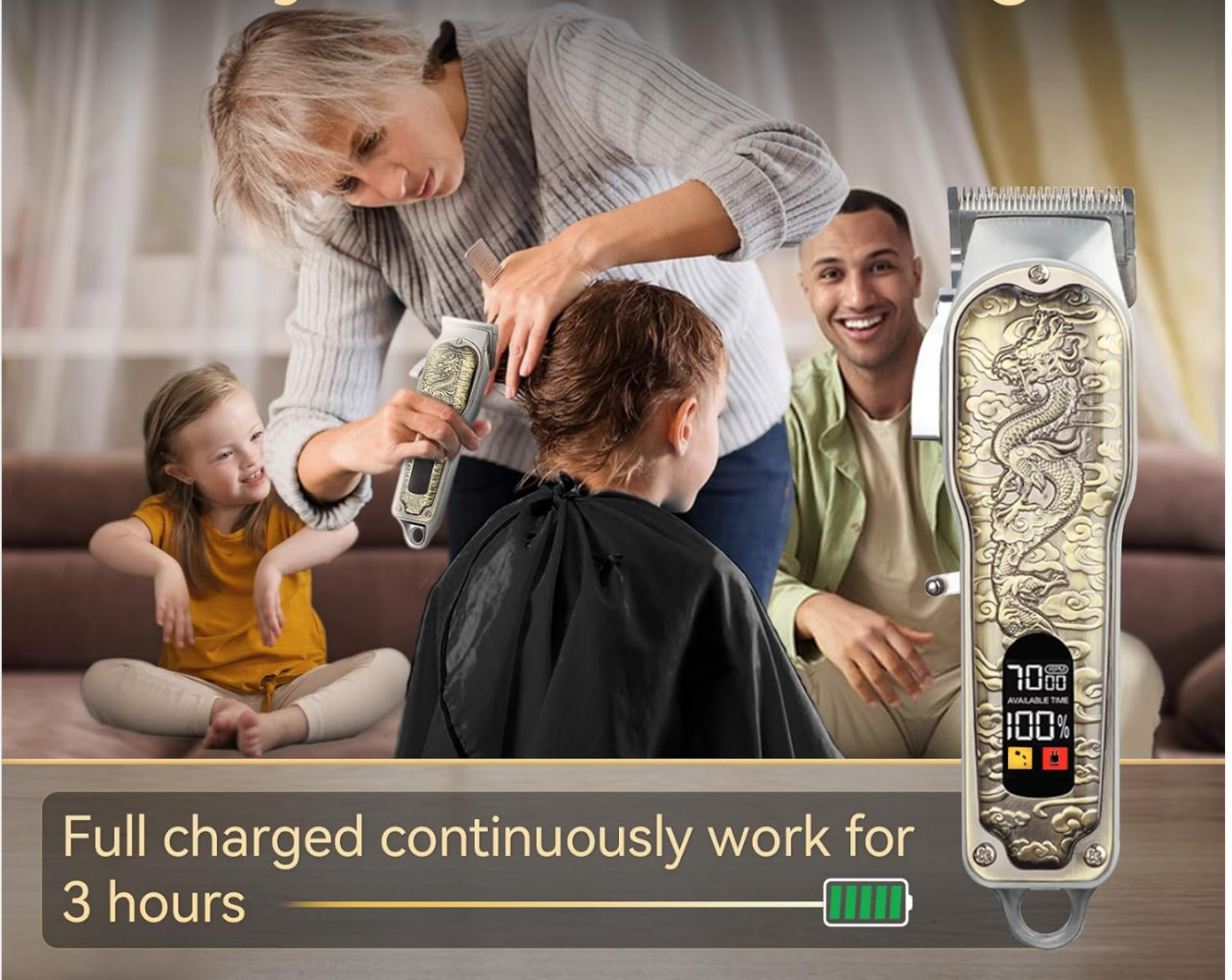
Image: Detailed view of the LCD display on both devices.