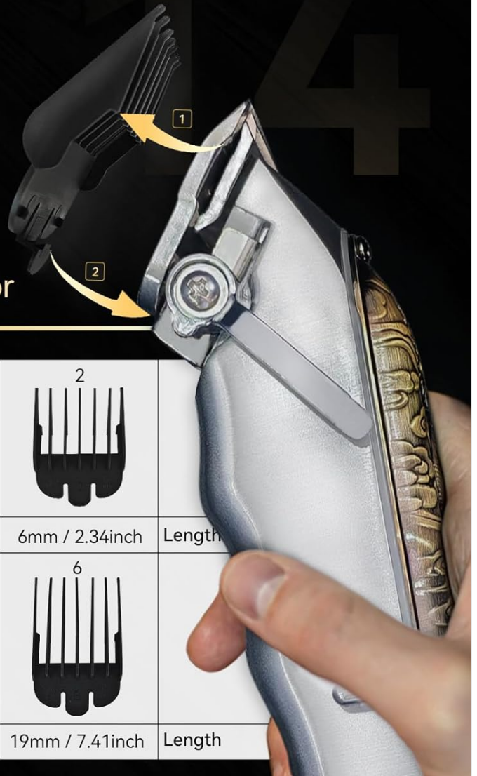
Image: Hair trimmer in use for precise detailing.