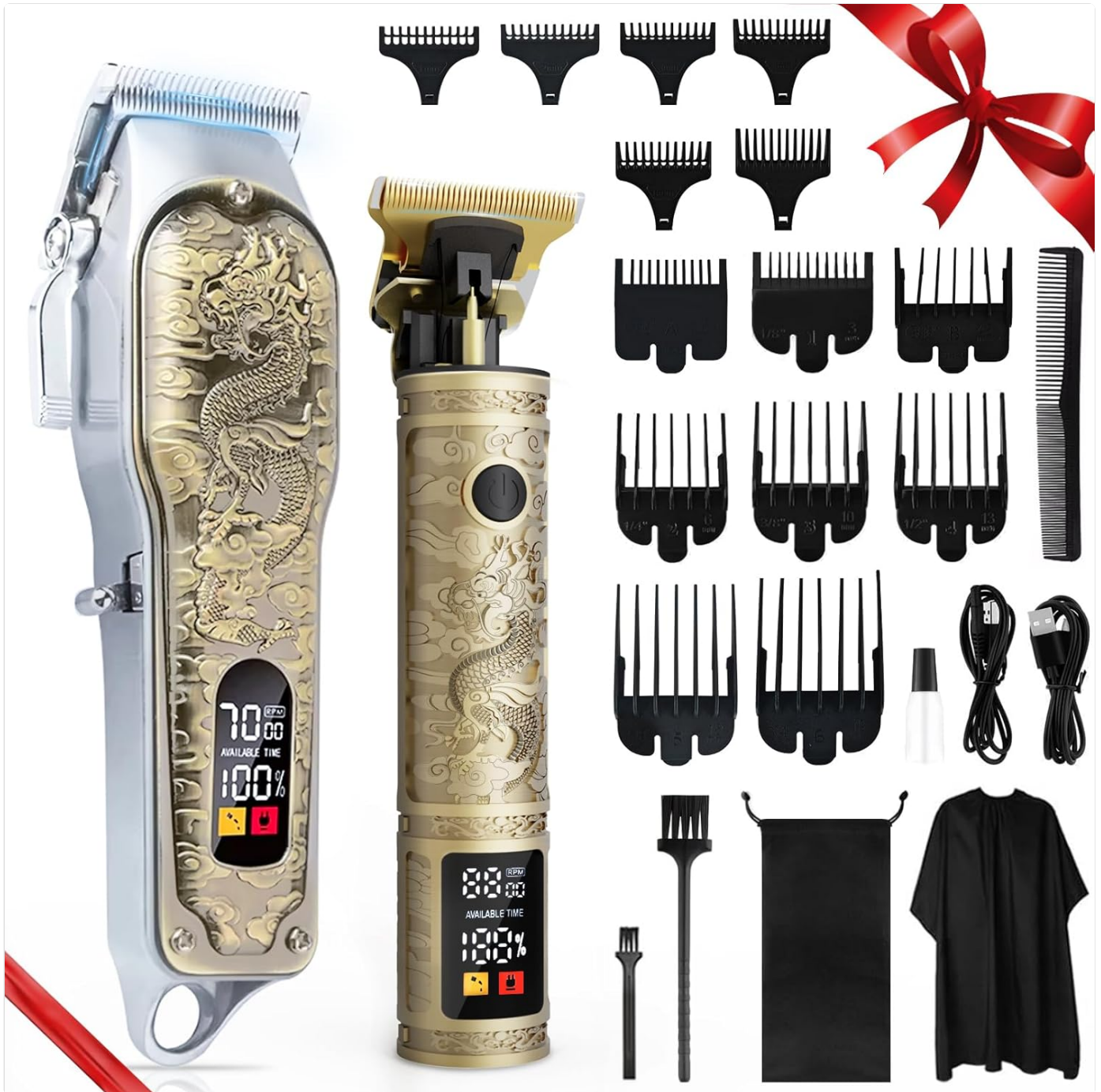
Image: All components included in the ZUWSUJS Professional Hair Clippers and Trimmers Set.