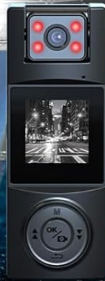
Image: The camera's advanced night vision capability is shown with four IR lights, designed for clear recording in dark environments.