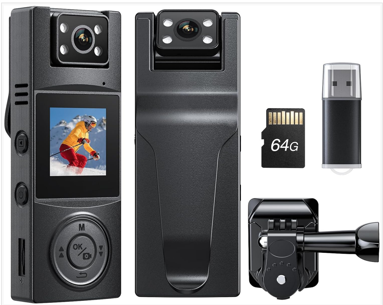
Image: The BOBLOV A23Pro Body Camera shown with its 180-degree rotatable lens, display screen, control buttons, and included accessories like a 64GB Micro SD card, USB drive, and helmet mount.