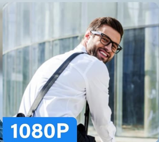
Image: A comparison demonstrating the clarity of 2K resolution versus 1080P, showcasing the superior detail captured by the A23Pro camera.