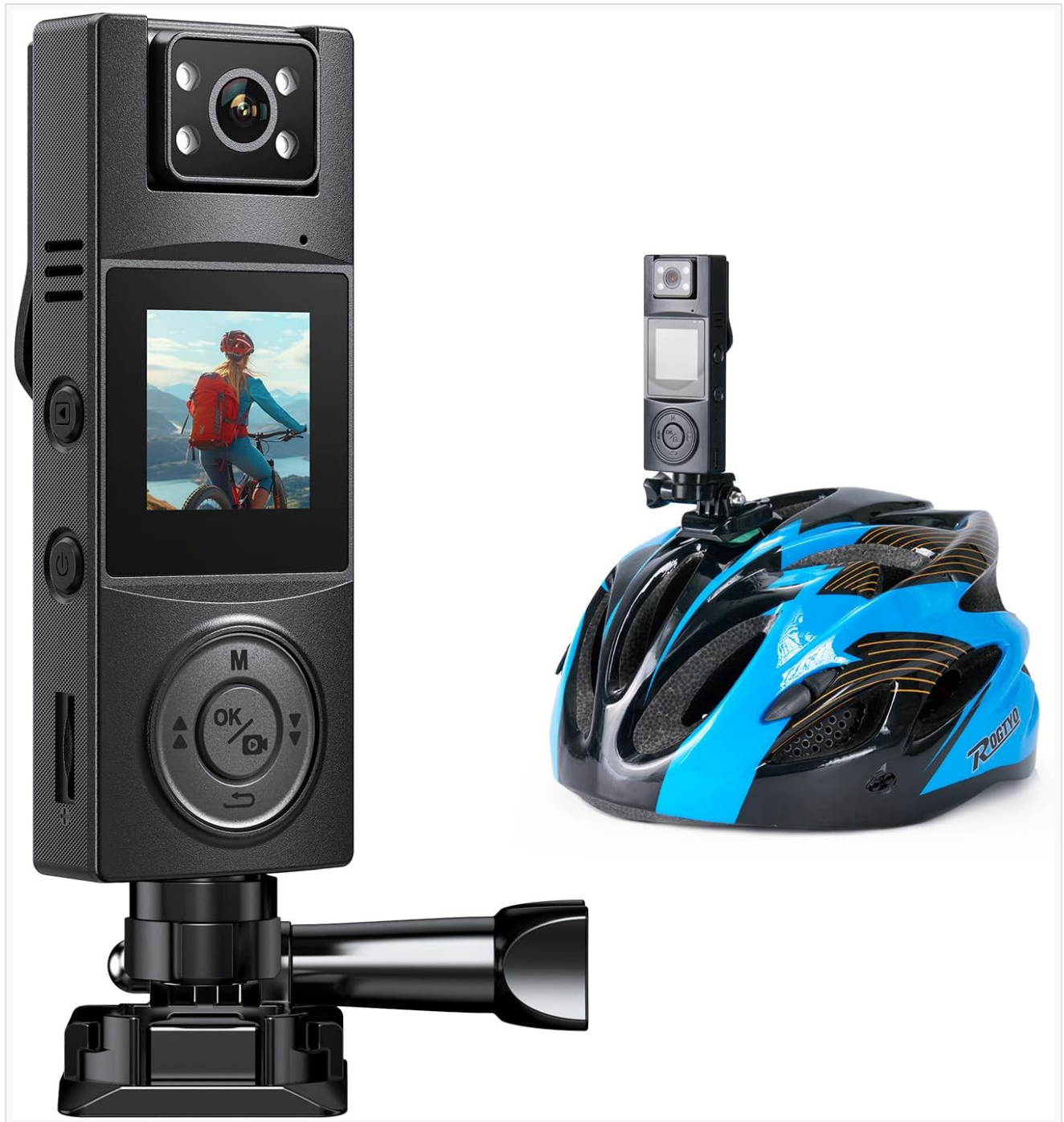
Image: The BOBLOV A23Pro Body Camera securely attached to a helmet using the included mount, demonstrating its use as a riding camera.

The included helmet mount allows for hands-free recording during activities like cycling or other outdoor sports. Attach the camera to the mount using the 1/4 nut, then secure the mount to your helmet. Ensure the camera is firmly attached before beginning any activity.