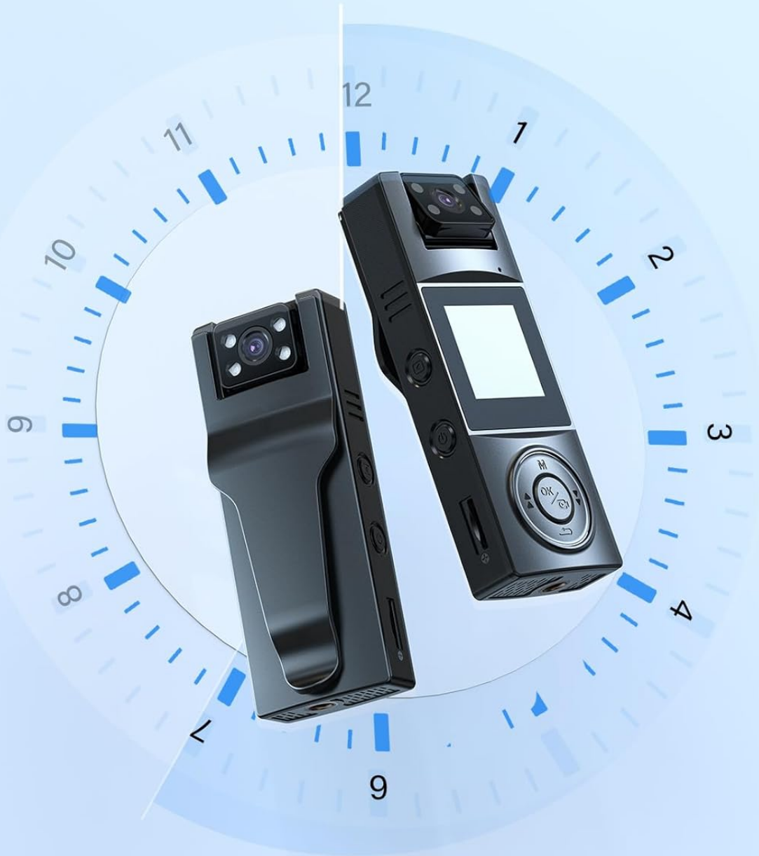
Image: A graphic illustrating the camera's built-in 2200mAh battery, emphasizing its capacity for up to 7 hours of recording time.

Record Time of 7 Hrs (1080P, Screen&IR Off)