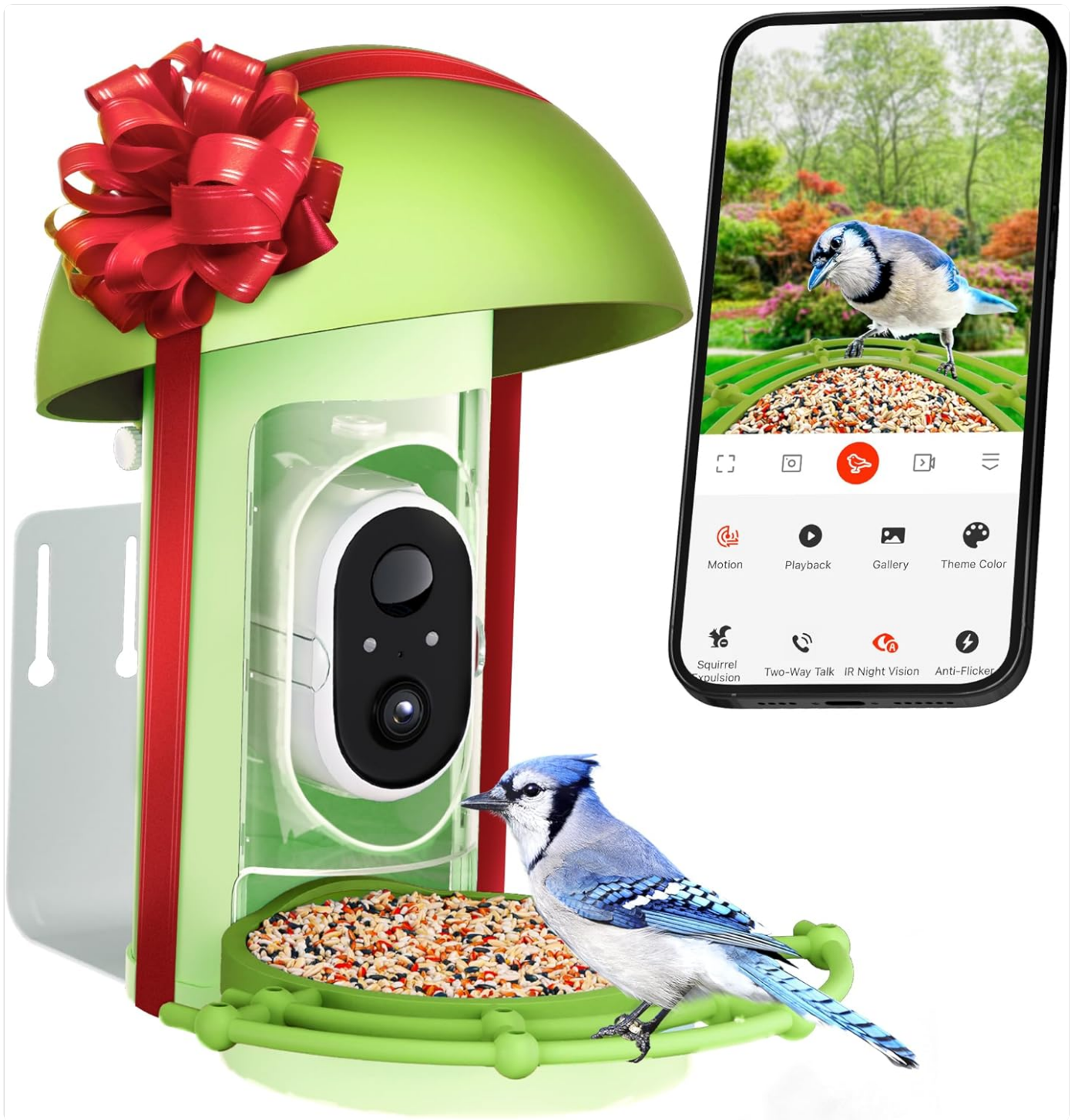
Image Description: A green BBPECO Smart Bird Feeder with an integrated camera, shown with a blue jay perched on its feeding tray. A smartphone screen next to it displays the live camera feed, highlighting the birdwatching experience.