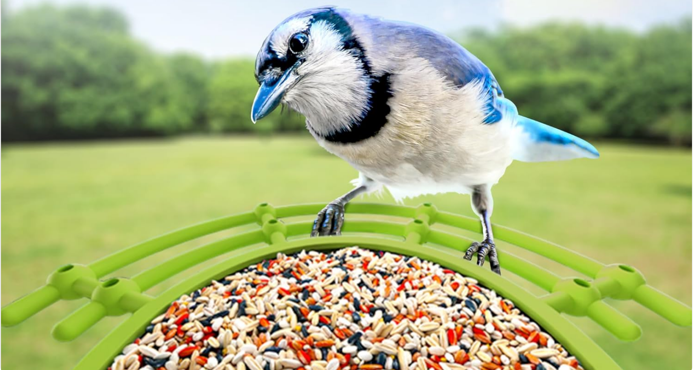
Image Description: A blue jay is shown on the feeder, with an overlay indicating 'Bird Detection' and 'Blue Jay' identified by the AI system, demonstrating the accurate recording and identification feature.

Birds (Blue Jay) detected by Smart Bird Feeder at 14:35:16.