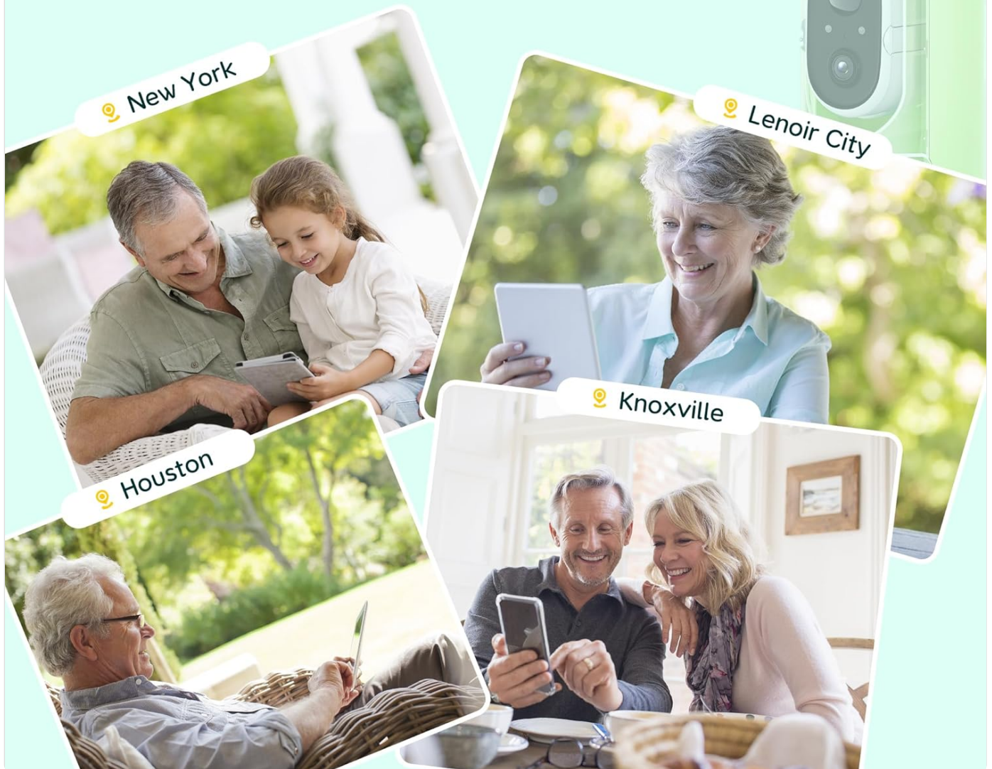
Image Description: Multiple individuals, including families and seniors, are shown viewing content from the bird feeder on their smartphones and tablets, illustrating the multi-viewer and sharing capabilities.