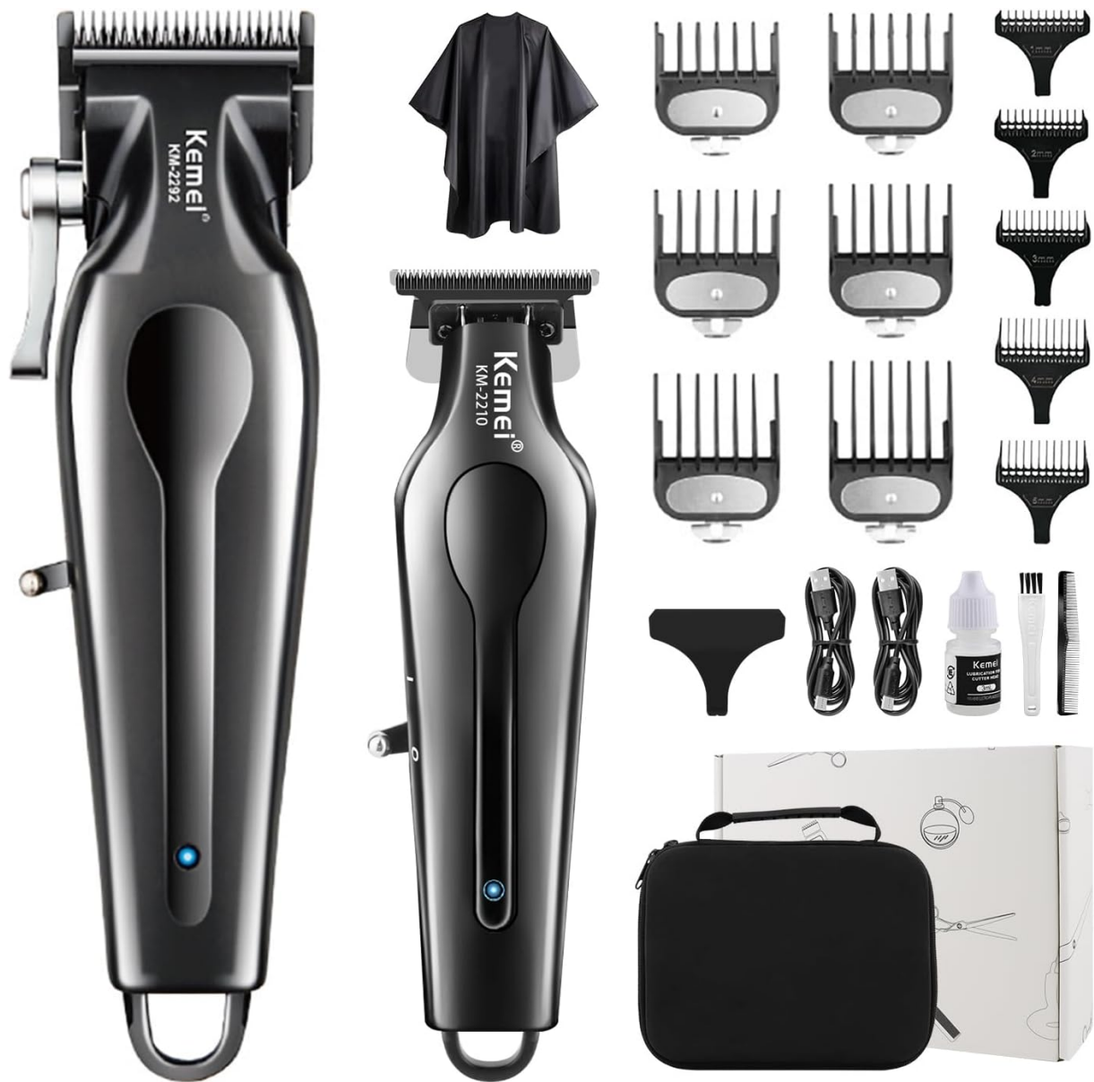
The KEMEI Professional Hair Clippers Set, emphasizing the need for regular cleaning with the included brush and oiling the blades to maintain performance.