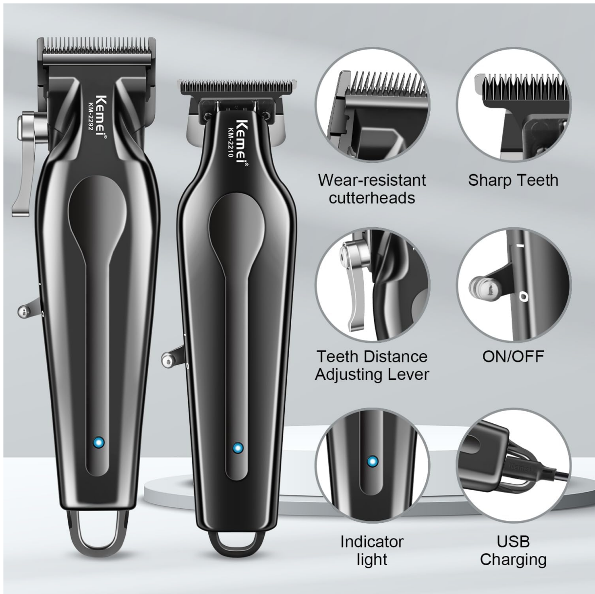
A close-up view of the KEMEI KM-2210 hair trimmer and its guide combs, showing how to attach and detach them for different cutting lengths.