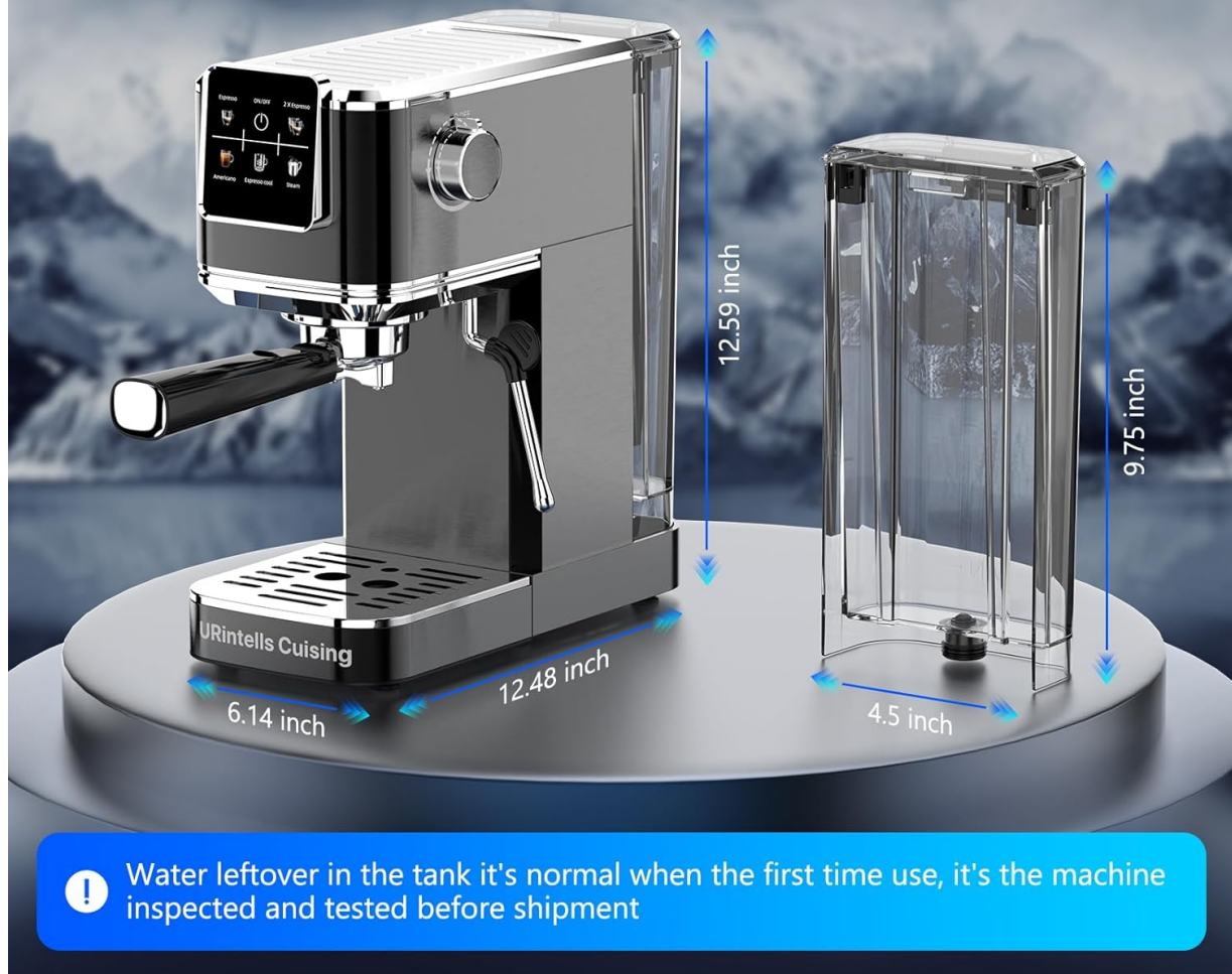
Figure 1: Exploded view of the URintells Cusing Espresso Machine and its included accessories. This image shows the main unit, water tank, portafilter, single and double shot filters, and the coffee spoon with tamper.