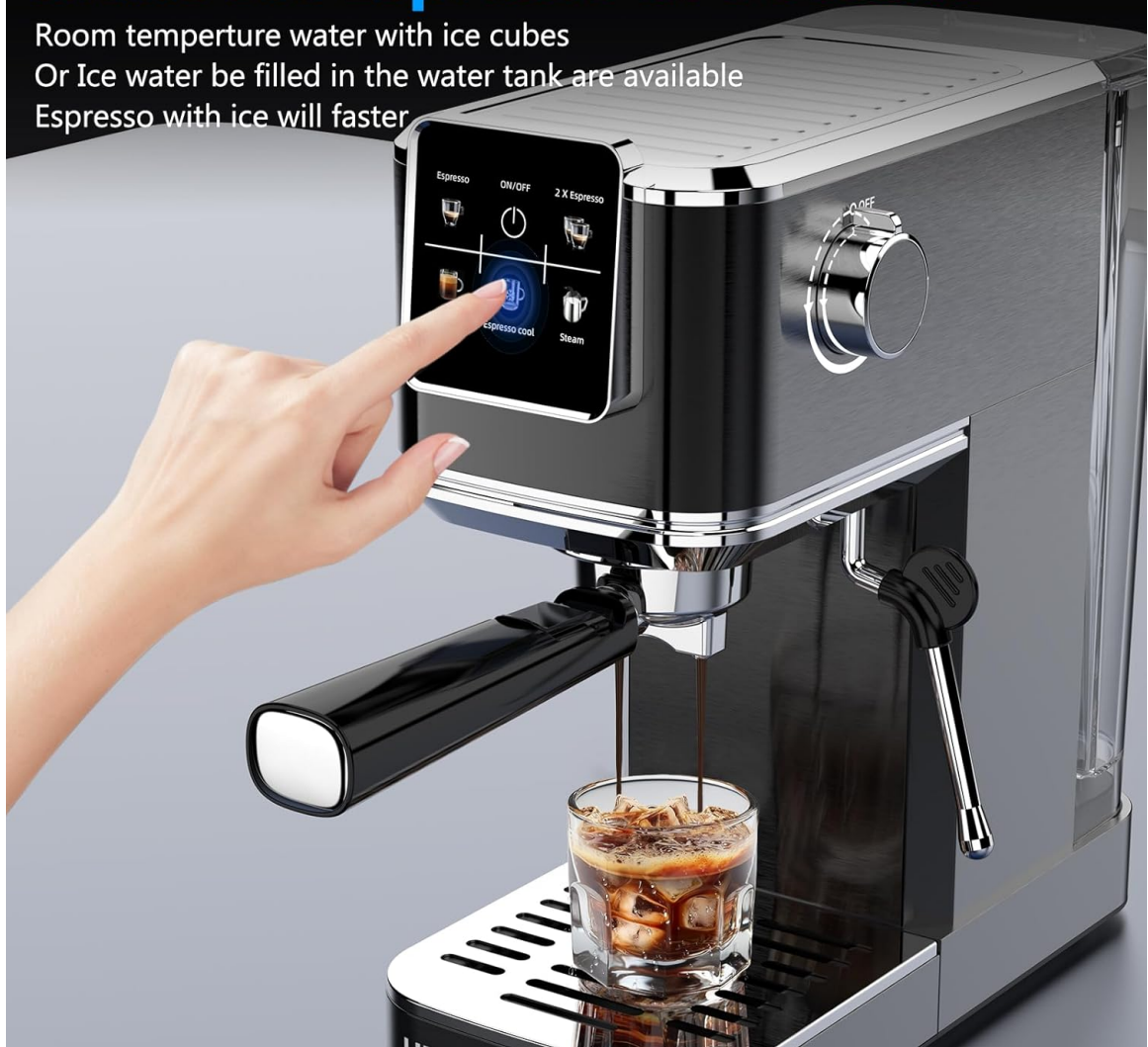
Figure 6: A hand interacts with the touchscreen, selecting the 'Espresso Cool' option to prepare iced coffee. The image shows the machine brewing into a glass with ice.

Room temperature water with ice cubes Or Ice water be filled in the water tank are available Espresso with ice will faster