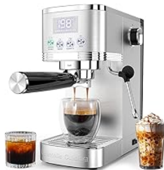
Figure 8: The detachable drip tray is shown, highlighting its ease of removal for cleaning and its adjustability for different cup heights.

The drip tray is removable for easy cleaning. Simply slide it out, empty any accumulated liquid, and wash with warm soapy water. It is recommended to clean the drip tray regularly.