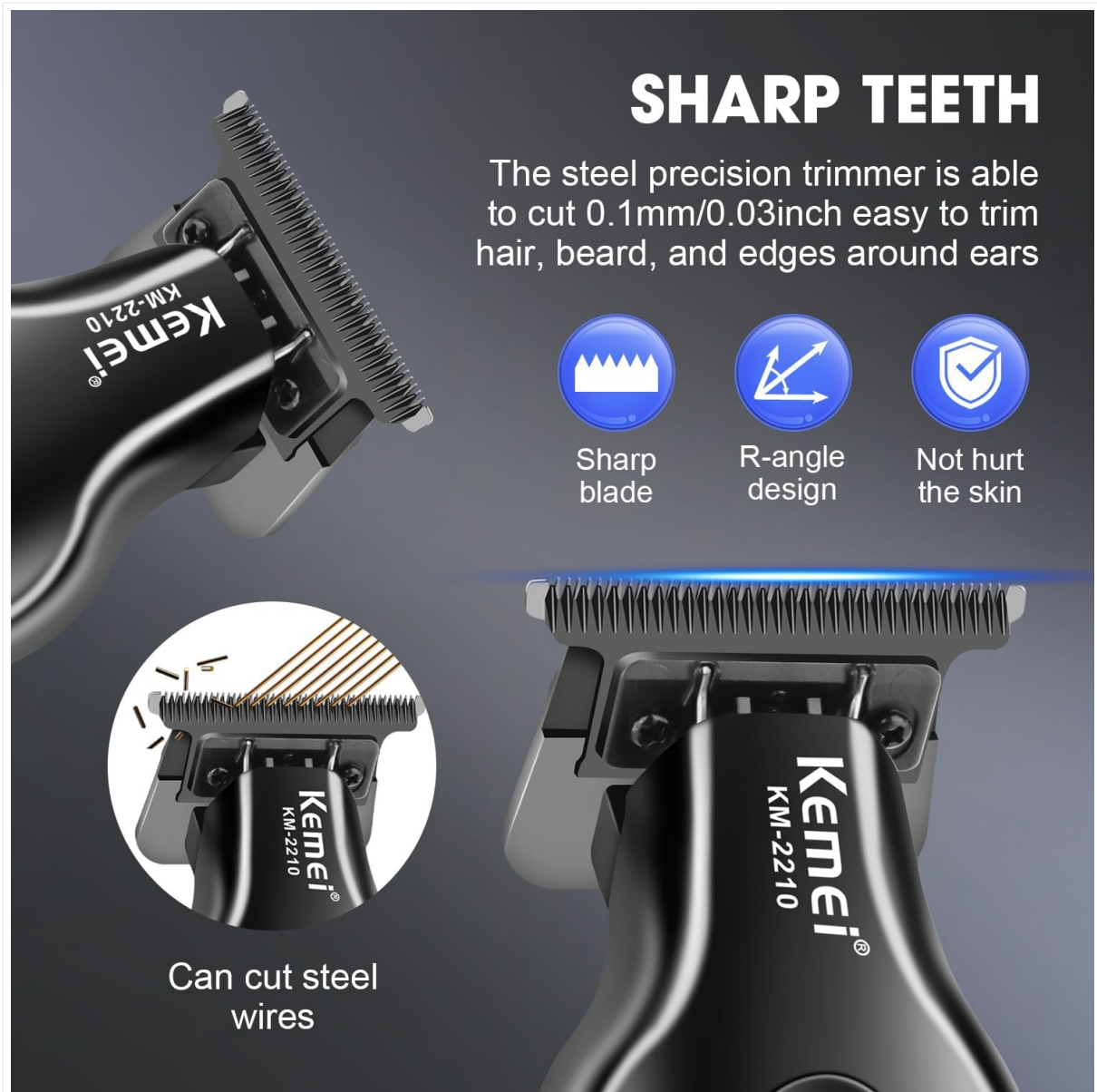
Figure 5.2: Close-up of the KEMEI KM-2210's sharp steel precision trimmer blade with R-angle design, highlighting its ability to cut hair as short as 0.1mm without harming the skin.