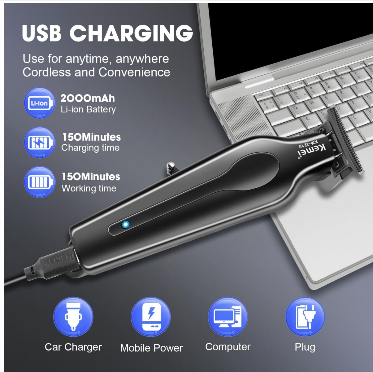
Figure 4.1: The KEMEI KM-2210 trimmer connected via USB for charging, illustrating its compatibility with various USB power sources.

The KEMEI KM-2210 features a 2000mAh Lithium-ion battery, providing approximately 150 minutes of working time after a 150-minute charge.