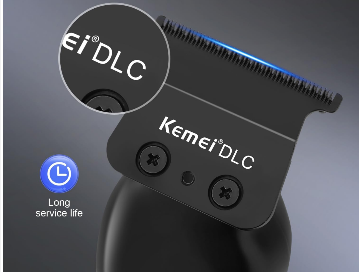
Figure 5.3: Detail of the KEMEI KM-2210 blade featuring DLC (Diamond-Like Carbon) coating for high hardness, abrasion, and corrosion resistance, ensuring a long service life.

High hardness abrasion and corrosion resistance long service life