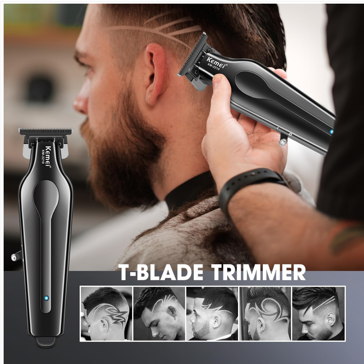
Figure 5.1: The KEMEI KM-2210 T-Blade Trimmer being used for precise hair cutting and detailing.