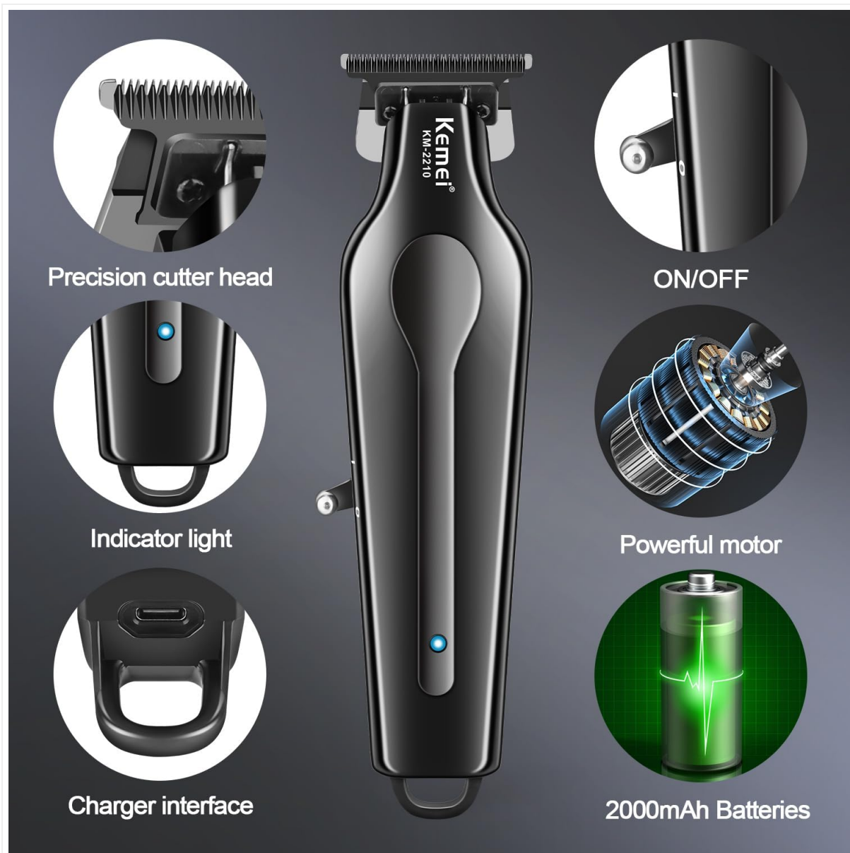
Figure 3.1: Overview of the KEMEI KM-2210 trimmer showing its precision cutter head, ON/OFF switch, indicator light, powerful motor, charger interface, and 2000mAh battery.