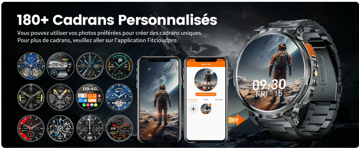
Image: A variety of customizable watch faces available for the LIGE FV6 smartwatch, including options to use personal photos.

Vous pouvez utiliser vos photos préférées pour créer des cadrans uniques. Pour plus de cadrans, veuillez aller sur l'application Fitcloudpro.