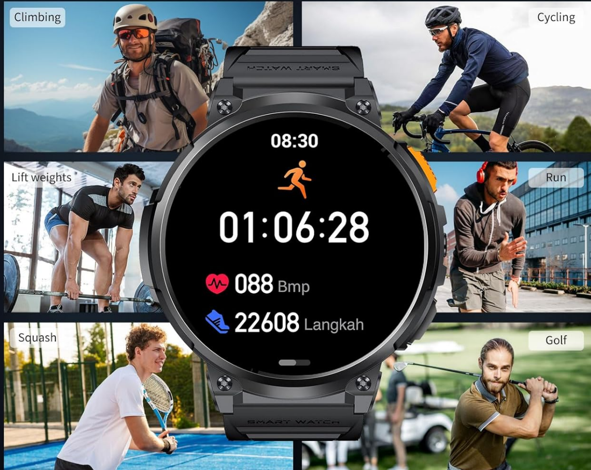
Image: Various sports activities like climbing, cycling, weightlifting, running, squash, and golf, demonstrating the smartwatch's extensive sports mode tracking.