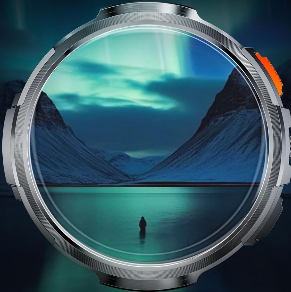
Image: Close-up of the smartwatch screen, emphasizing its 1.85" HD large display with high resolution and wide viewing angle.