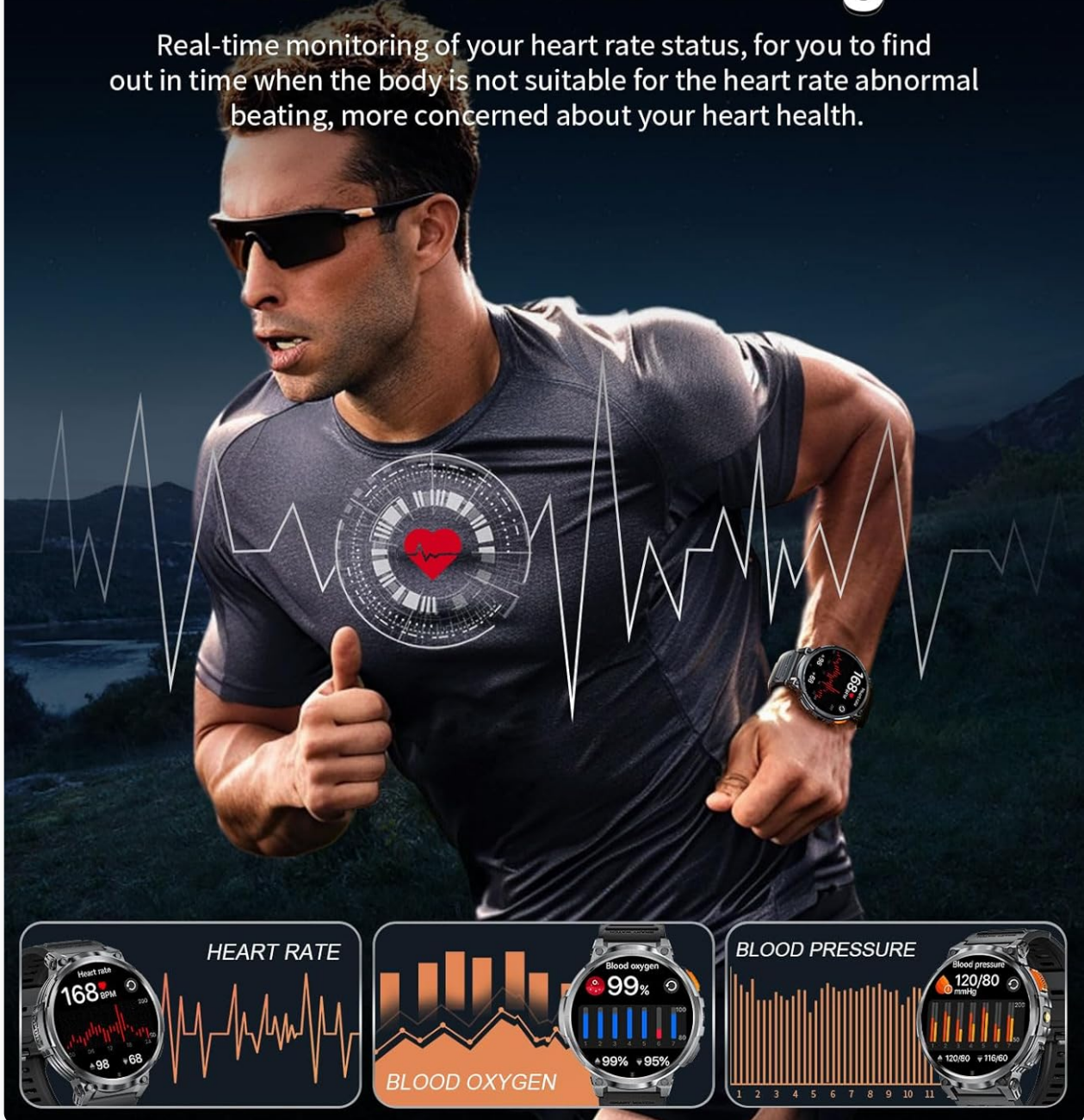
Image: A user running while the smartwatch displays real-time heart rate, blood oxygen, and blood pressure data, illustrating its health monitoring capabilities.

Real-time monitoring of your heart rate status, for you to find out in time when the body is not suitable for the heart rate abnormal beating, more concerned about your heart health.