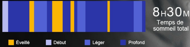
Image: A graphic illustrating the smartwatch's real-time sleep monitoring, showing different sleep stages (awake, REM, light, deep) and total sleep time.

Affiche la qualité du sommeil chaque nuit, enregistre le sommeil profond et léger, et permet de consulter des données de sommeil détaillées via l'application pour vous aider à mieux ajuster votre vie.