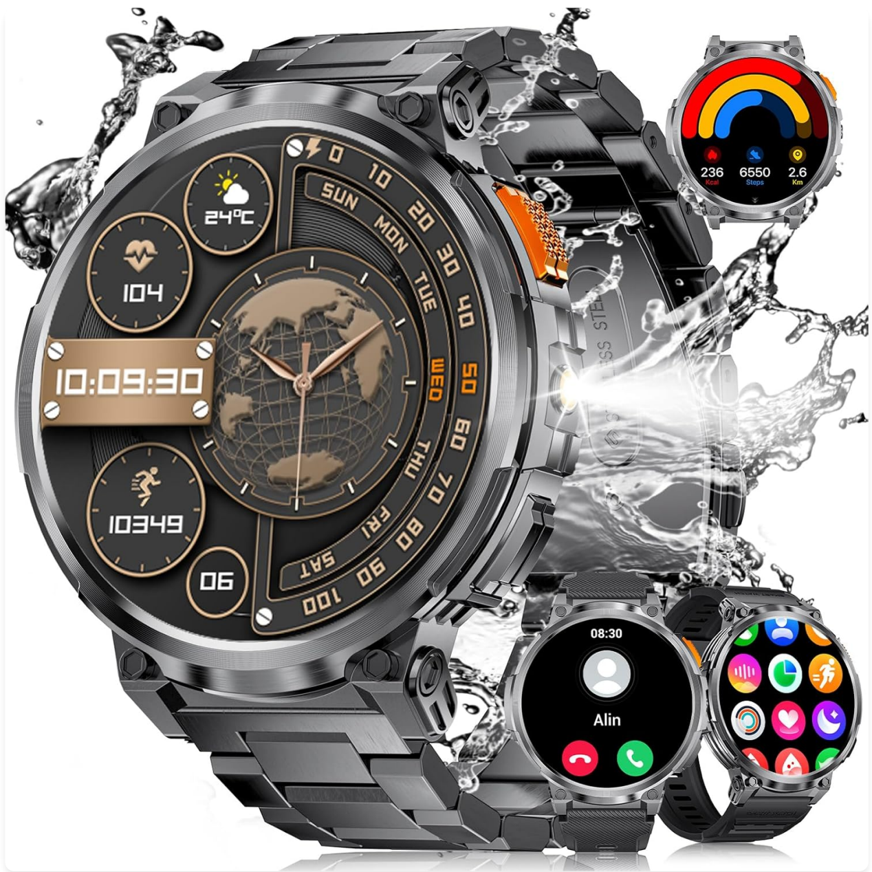
Image: The LIGE FV6 Military Smartwatch, showcasing its rugged design and vibrant display with various watch faces.