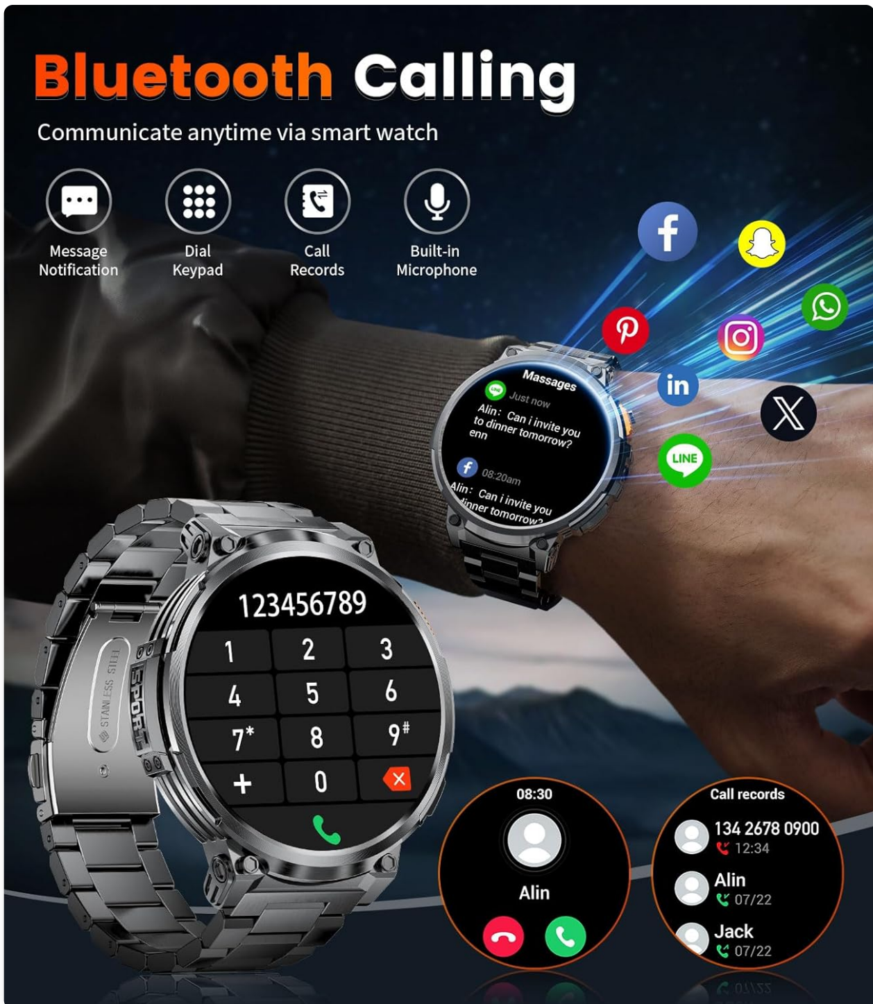
Image: The smartwatch displaying its Bluetooth calling interface, showing message notifications, dial keypad, call records, and built-in microphone.

5. Confirm the pairing request on both your phone and the smartwatch.