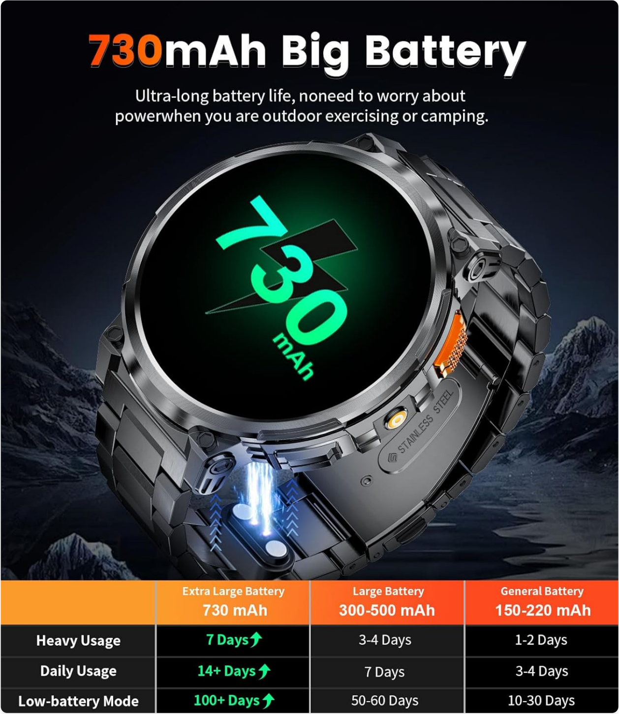
Image: Illustration of the smartwatch being charged, highlighting its 730mAh battery capacity and long endurance.

on the back of the watch and plug the USB end into a standard USB power adapter (not included). A full charge takes approximately 2.5 hours.