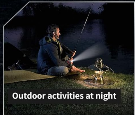
Outdoor activities at night