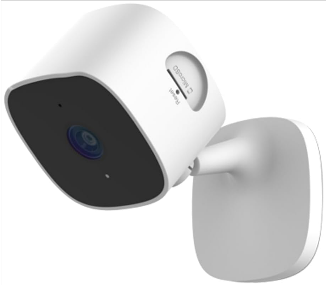
Image: The Swann EVO 2K Indoor Wi-Fi Security Camera shown with its wall mount, highlighting its compact design and flexible placement options.

The Evo Indoor Camera offers adjustable mounting options. It can be placed on a flat surface like a table or shelf, or mounted to a wall using the included wall mount, screws, and plugs. Ensure the camera is positioned to capture the desired area effectively.