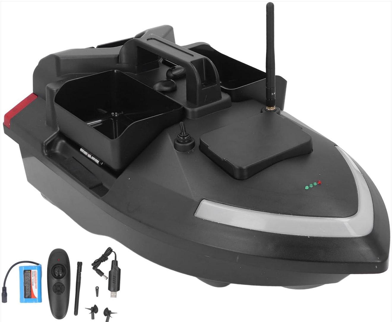
Image 3.1: The complete package contents, including the bait boat, remote control, battery, charging cable, and other accessories.