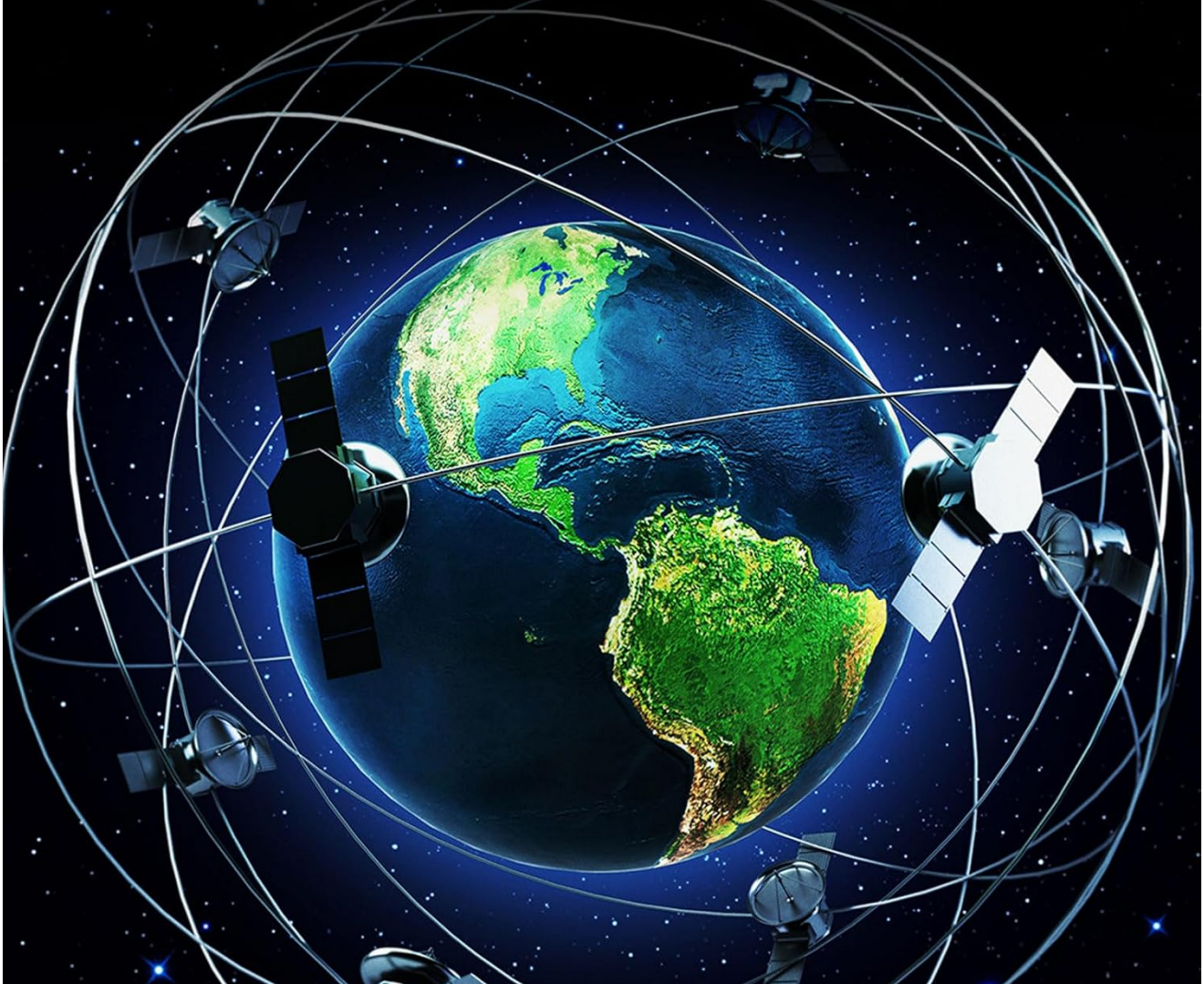
Image 5.4: Graphic illustrating the BDS+GPS dual satellite module for precise positioning and navigation.

MULTIPLE POSITIONING POINTS CAN BE SET, AUTOMATIC NAVIGATION BETWEEN POSITIONING POINTS