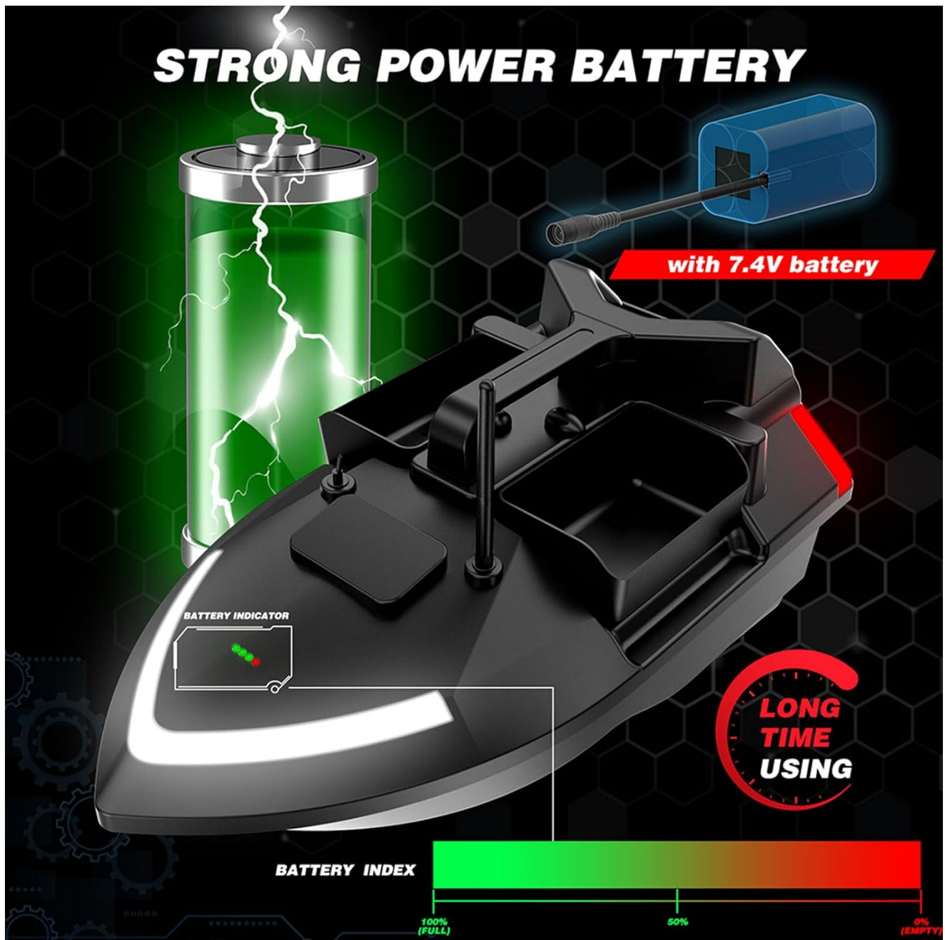
Image 4.1: Illustration of the boat's battery indicator and charging process, showing a 7.4V battery.