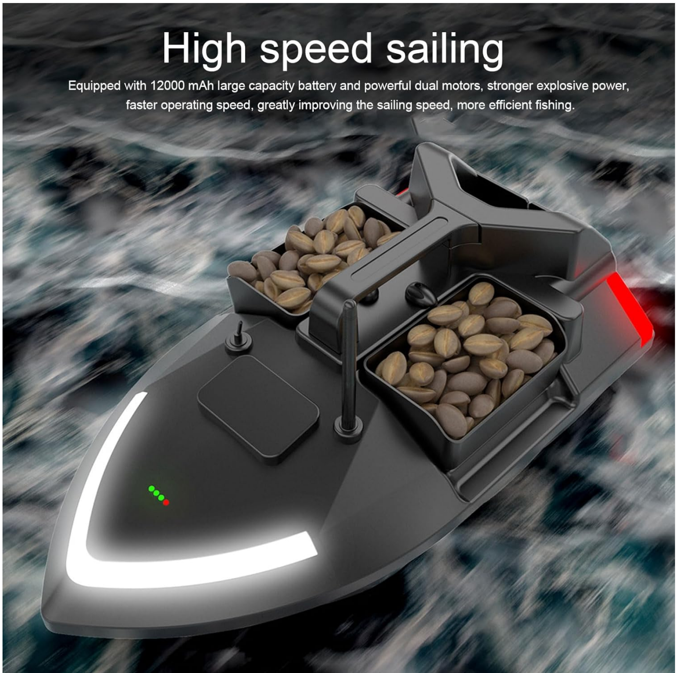
Image 5.1: The bait boat demonstrating high-speed sailing capabilities.