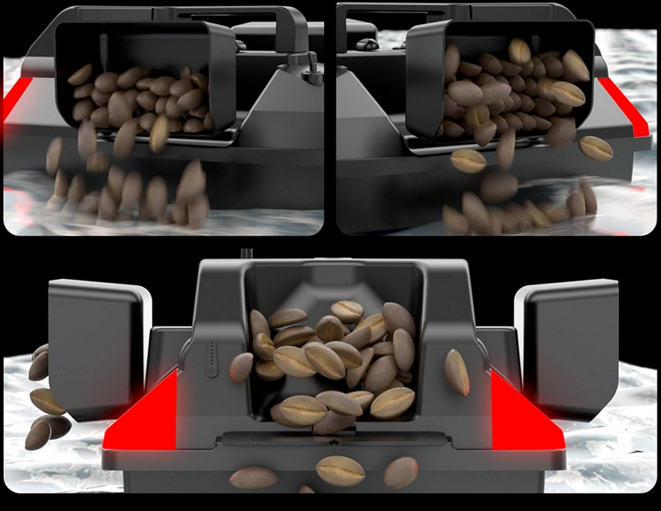
Image 5.2: Close-up view of the three bait tanks, showing bait being released.