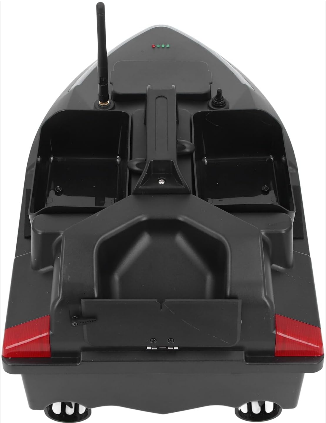
Image 1.1: Top-down view of the Bewinner RC Fishing Bait Boat, showing the bait compartments and antenna.