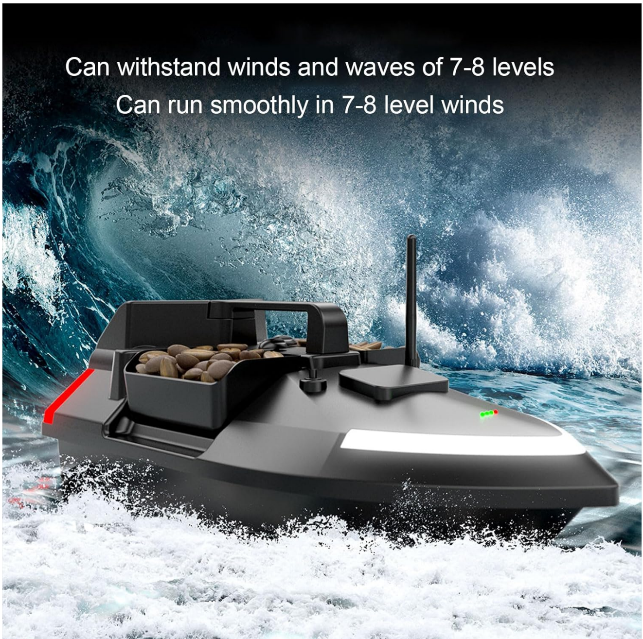
Image 2.1: The bait boat navigating through water, demonstrating its stability in moderate conditions.