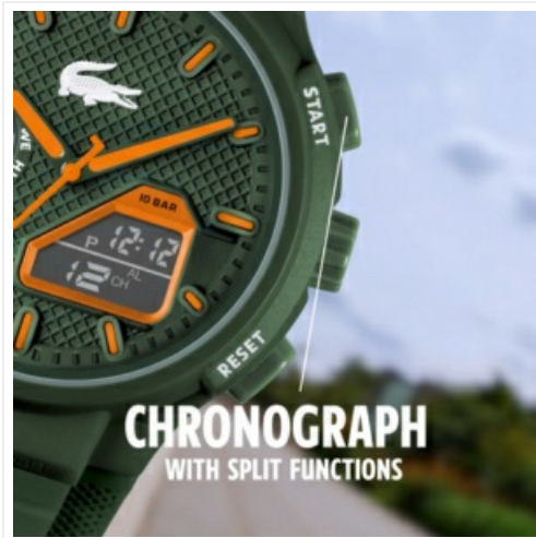
The watch dial illustrating the chronograph feature with split functions for precise time measurement.