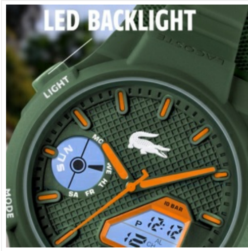
The watch dial illuminated by its LED backlight, ensuring visibility in low-light conditions.