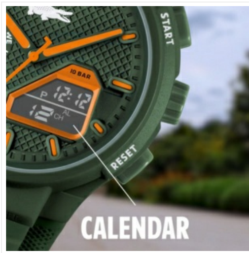
The watch dial showcasing its calendar function, displaying the day of the week and date.