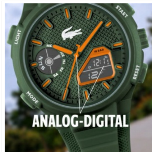
Close-up of the watch dial, emphasizing the integrated analog and digital time displays.