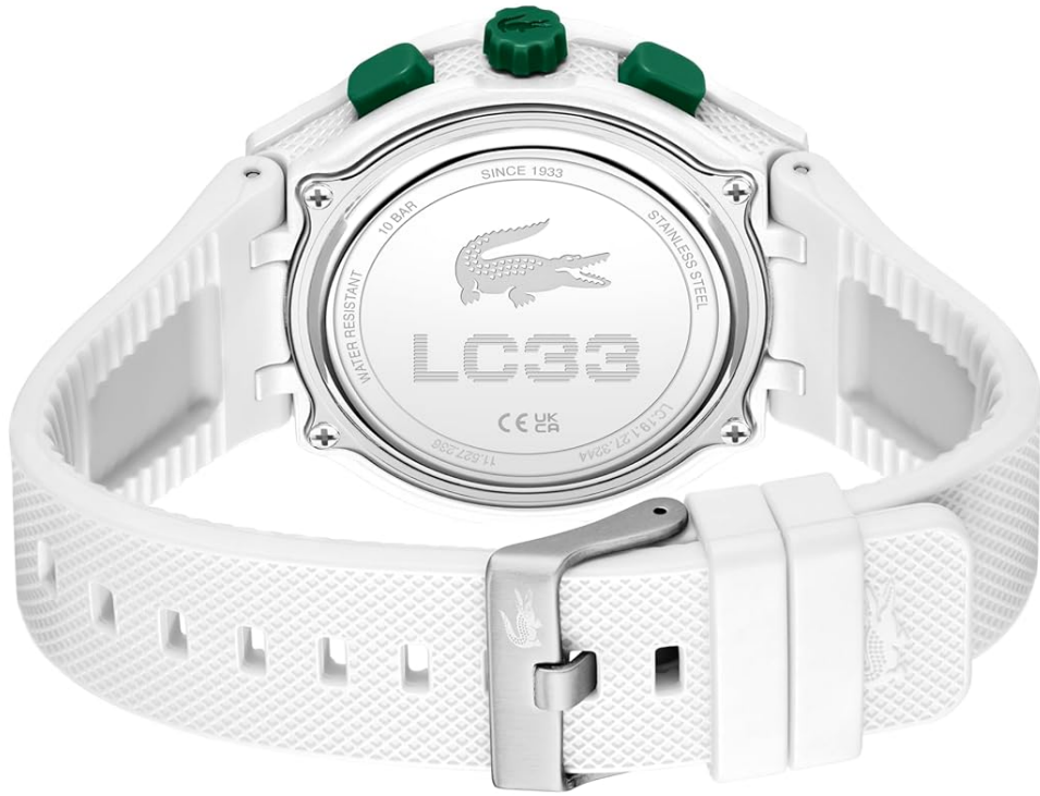
Back view of the Lacoste LC33 watch, featuring the stainless steel case back engraved with the Lacoste crocodile logo and model details.