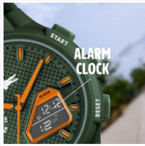
The watch dial displaying the alarm clock function, indicating the set alarm time.