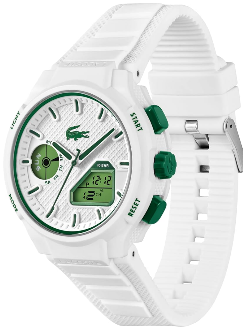
Side view of the Lacoste LC33 watch, showing the watch's profile and the green control buttons on the side.