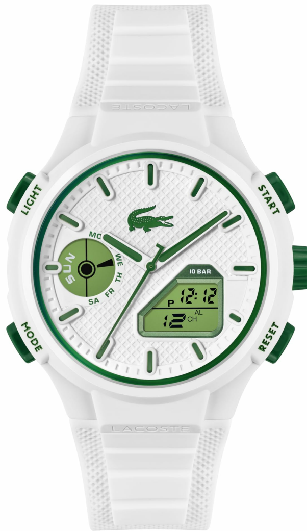
Front view of the Lacoste LC33 watch, showcasing its white strap, white dial, green accents, and dual analog-digital display.