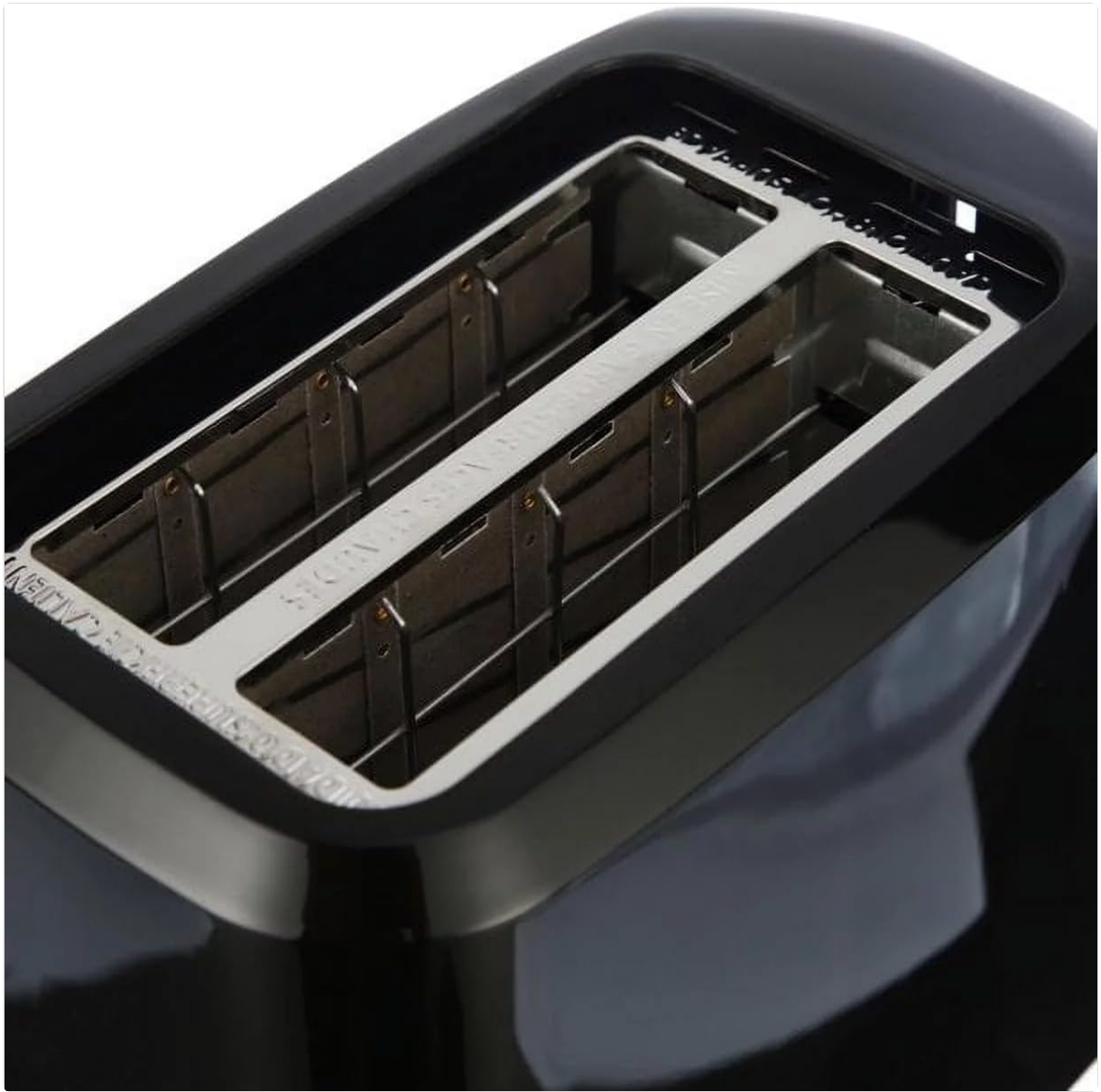
Figure 3.3: Detailed view of the two toasting slots, showing the internal metal guides designed for auto-centering bread slices.