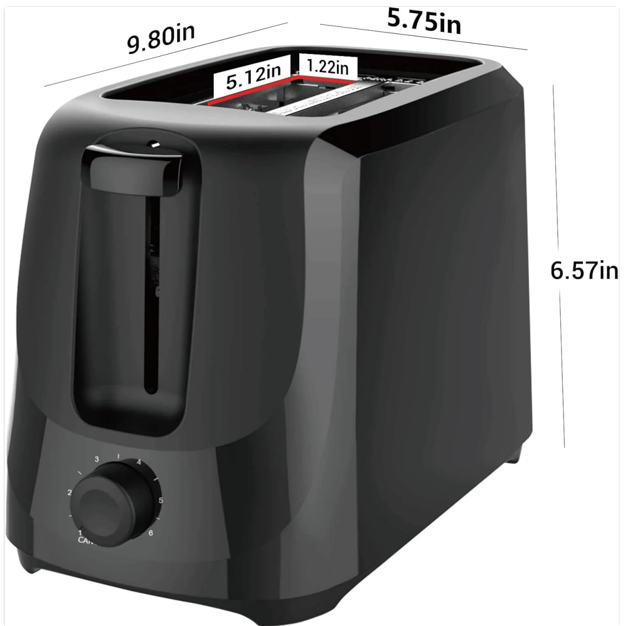
Figure 3.2: Dimensional view of the toaster, indicating a length of 9.80 inches, width of 5.75 inches, and height of 6.57 inches. The slots are approximately 5.12 inches long and 1.22 inches wide.