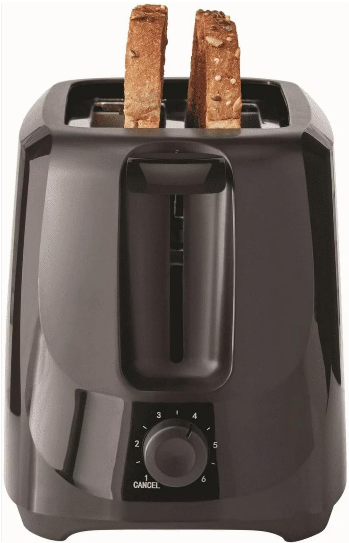
Figure 3.1: Front view of the Mainstays 2-Slice Toaster with bread inserted. This image shows the toaster's compact design and the top-loading slots.