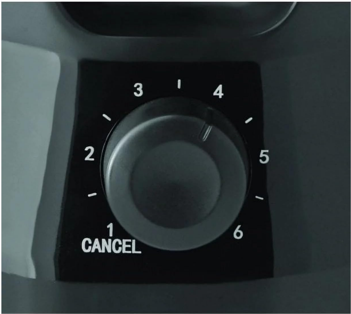
Figure 3.4: Close-up of the shade control dial, featuring settings from 1 (lightest) to 6 (darkest), and a 'CANCEL' button for stopping the toasting cycle.