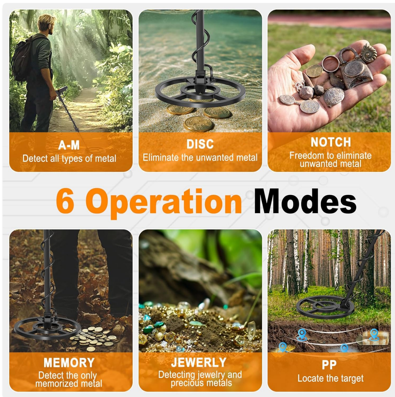
Figure 2: Overview of the 6 Operation Modes.

The OMMO MD-7011 features 6 distinct detection modes to optimize your treasure hunting experience: