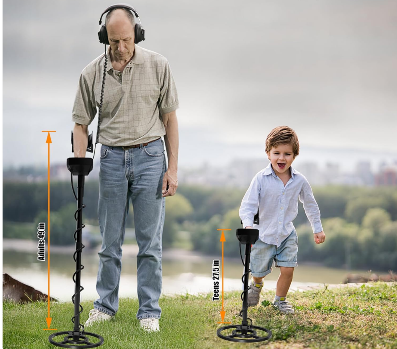
Figure 5: Adjustable stem for users of all ages.

70cm-125cm/27.5"-49" telescopic stem can be freely adjusted