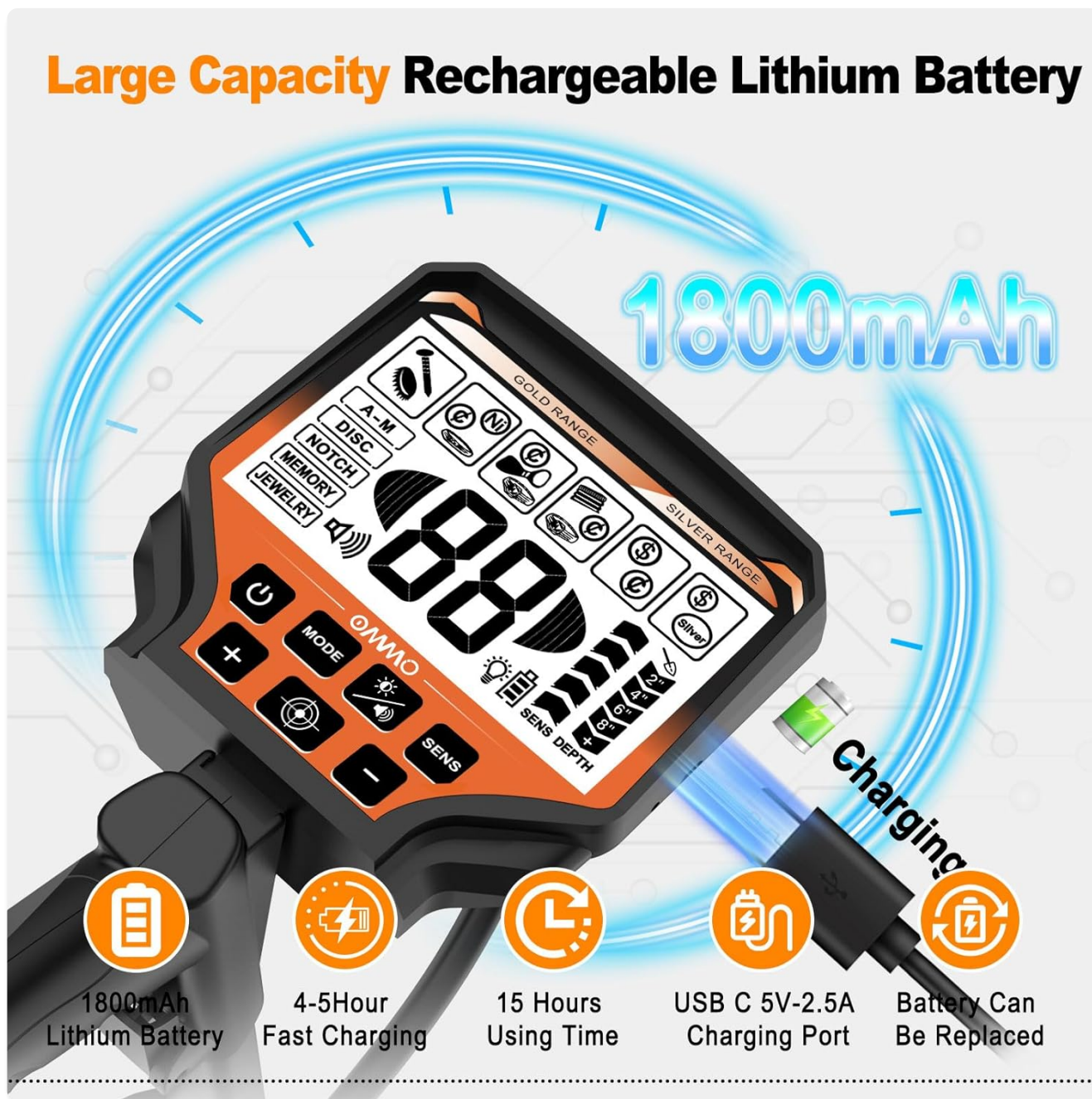
Figure 3: Rechargeable Battery and Charging.

The OMMO MD-7011 is equipped with a long-lasting 1800mAh rechargeable lithium battery. To charge the device: