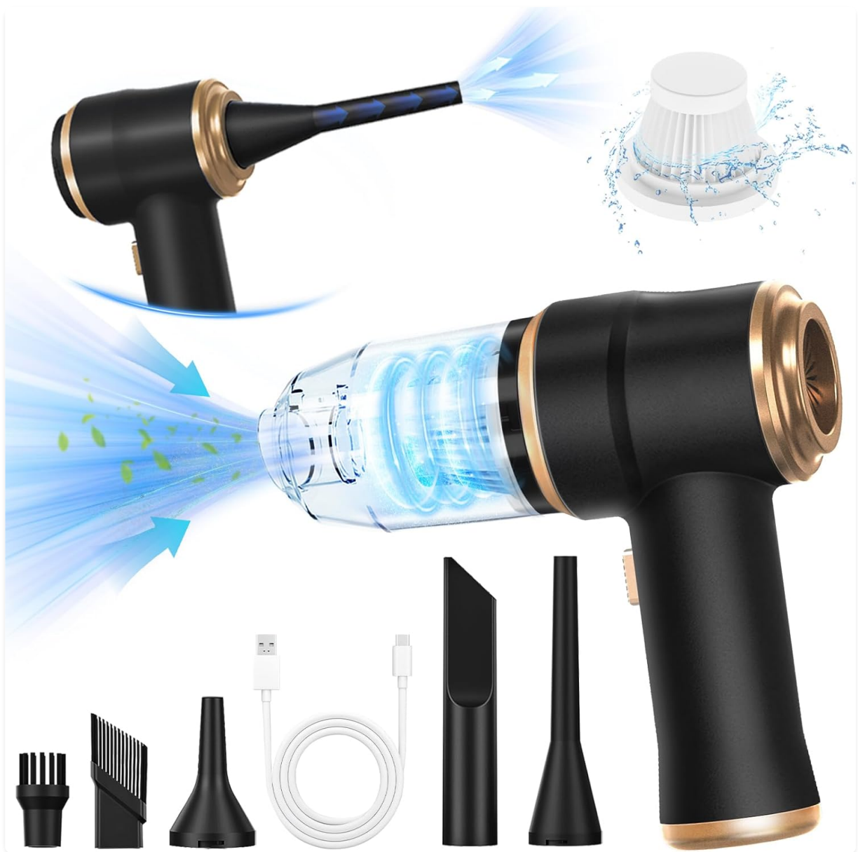
Image: The BELIBUY Mini Car Vacuum, showcasing its main unit and the array of included accessories such as different nozzles and a charging cable. This illustrates its dual functionality as both a vacuum and an air duster.