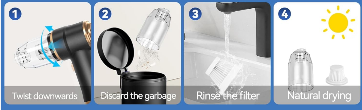
Image: A step-by-step visual guide showing how to disassemble the vacuum (twist downwards), discard garbage, rinse the HEPA filter, and allow for natural drying, emphasizing the ease of cleaning and reuse.