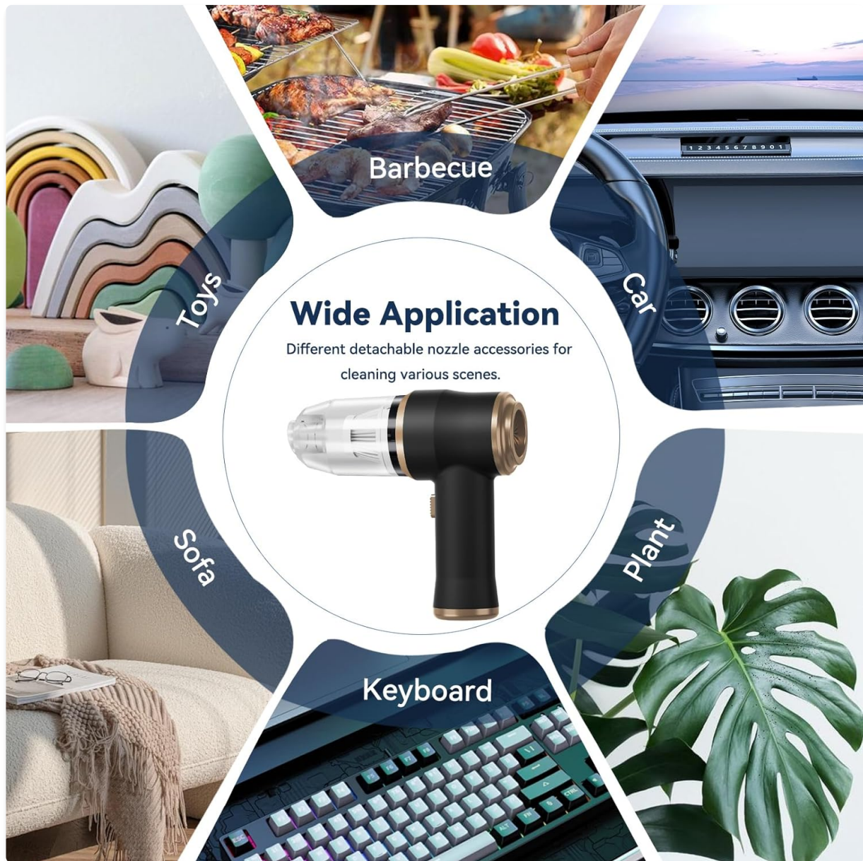
Image: Demonstrates the wide range of applications for the vacuum, including cleaning car interiors, keyboards, sofas, toys, plants, and even for use as a barbecue blower, highlighting its versatility with different nozzle accessories.

Important: Do not attempt to use both vacuum and blow functions simultaneously.