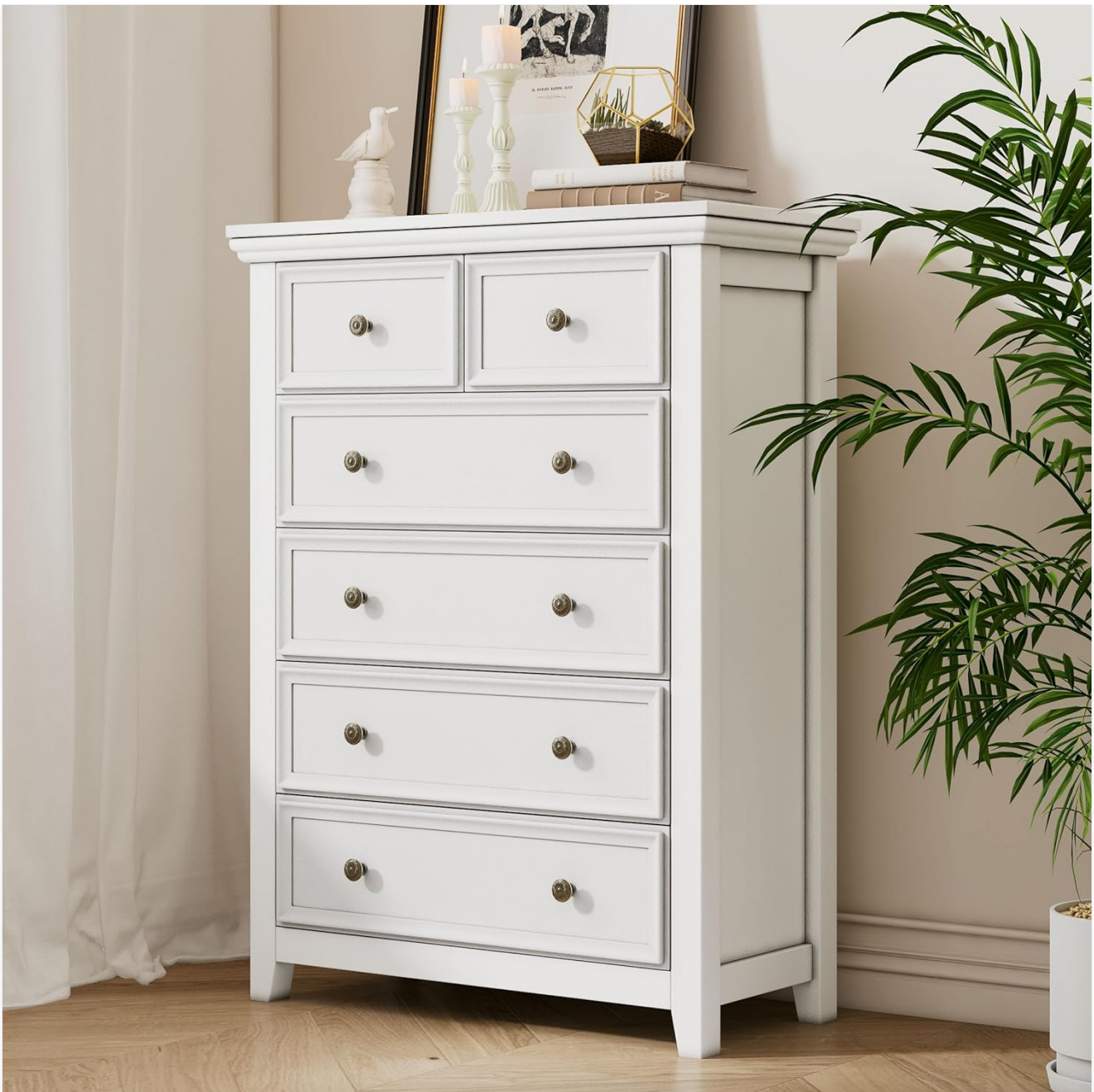
Image: The BOSHIRO White 6-Drawer Dresser, featuring a modern farmhouse style with vintage metal knobs, positioned in a room with a plant and window.