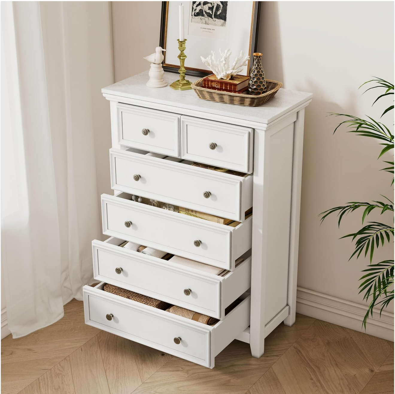
Image: The BOSHIRO 6-Drawer Dresser with all drawers pulled out, demonstrating the ample storage space available for various items.