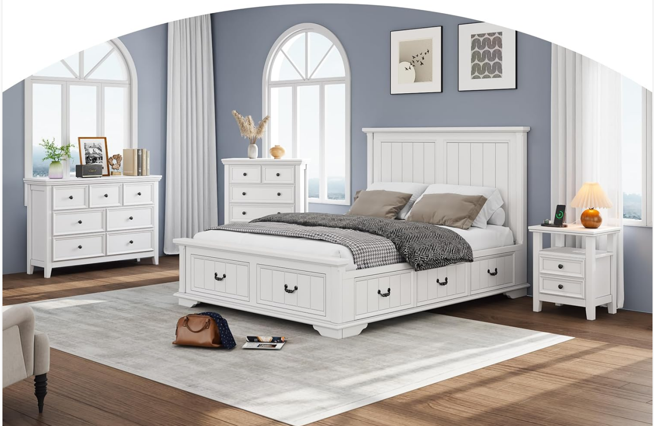
Image: A complete bedroom setup showcasing the BOSHIRO 6-Drawer Dresser alongside a bed and nightstand, illustrating its integration into a coordinated furniture collection.