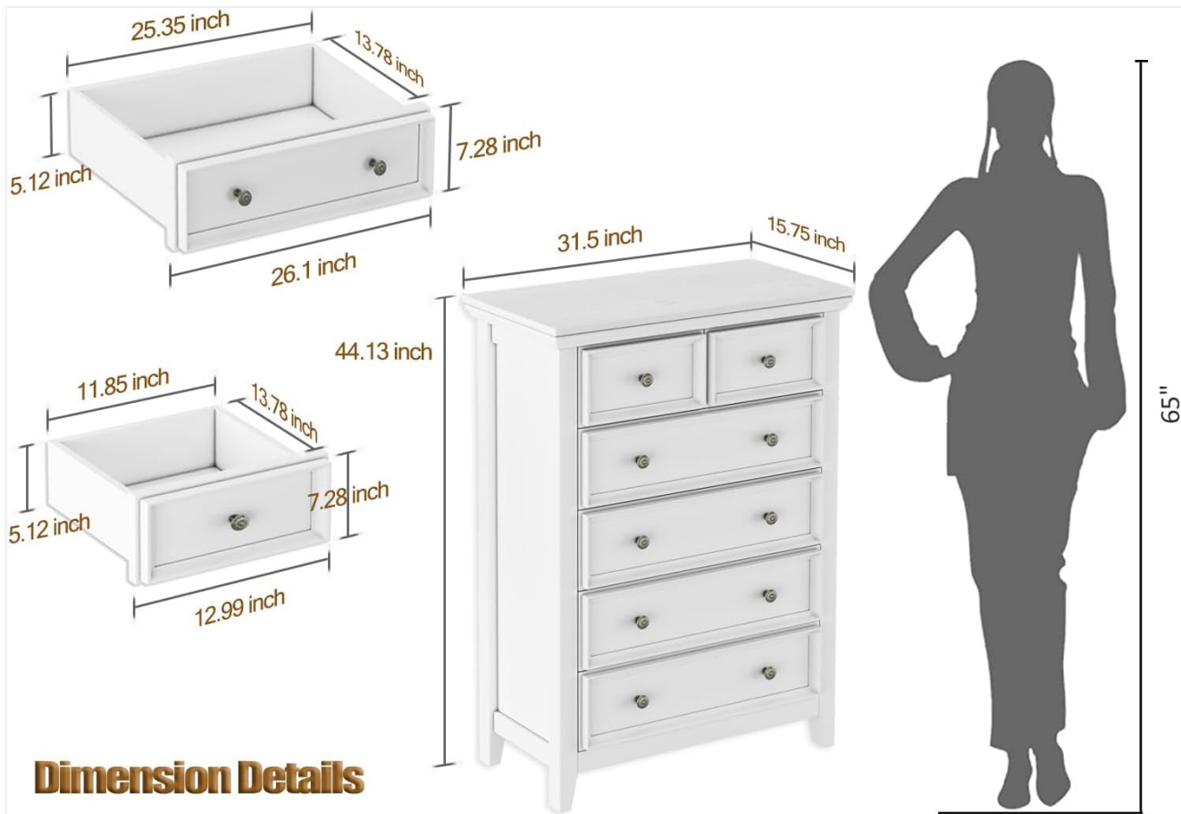
Image: Diagram illustrating the precise dimensions of the BOSHIRO 6-Drawer Dresser and its individual drawers, including depth, width, and height measurements.

Detailed specifications for the BOSHIRO White 6-Drawer Dresser.