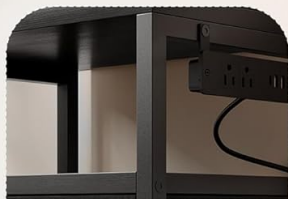
① DURABLE Metal Frame