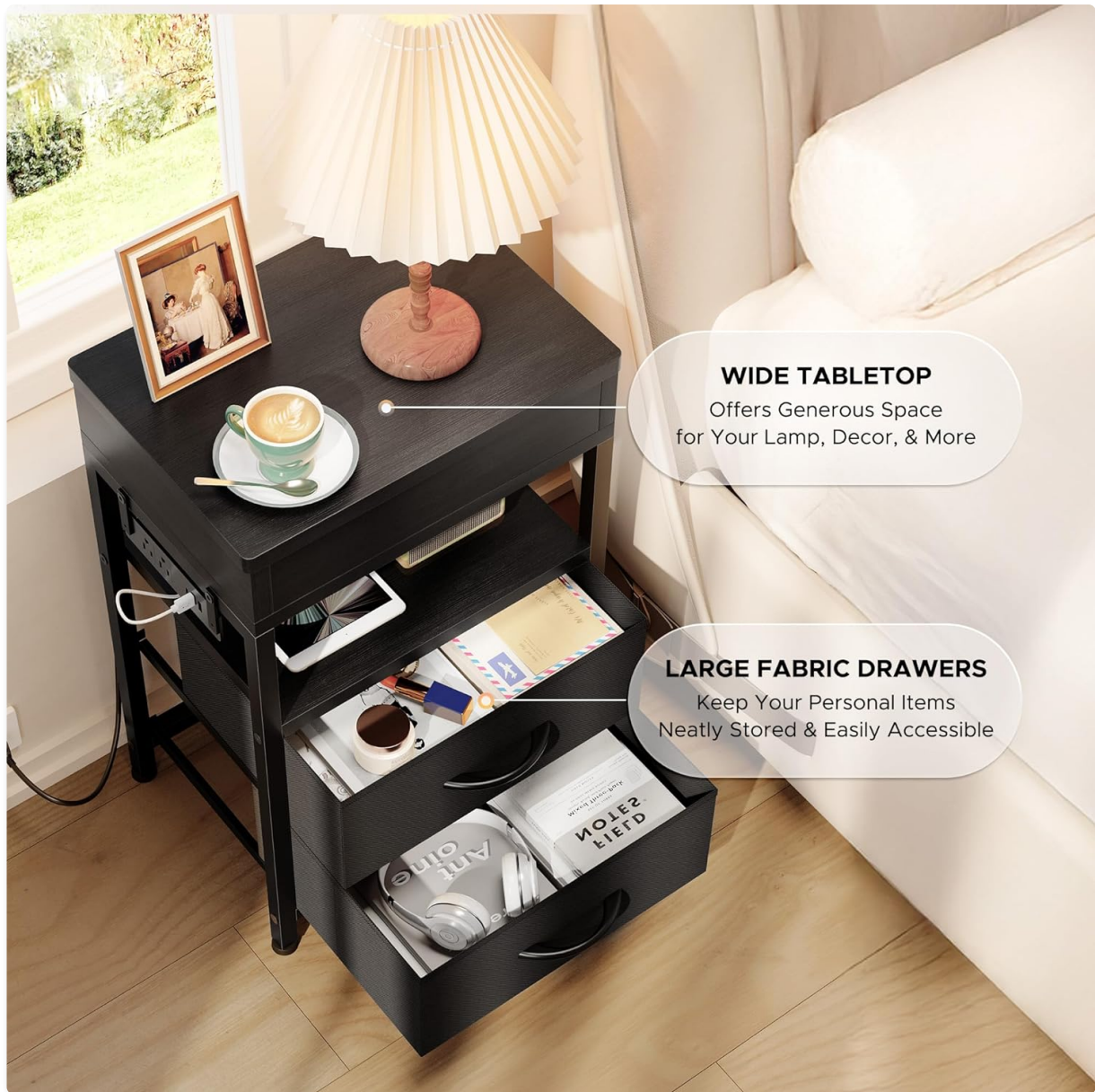
Image: The nightstand's tabletop with items and fabric drawers open, showing storage capacity.