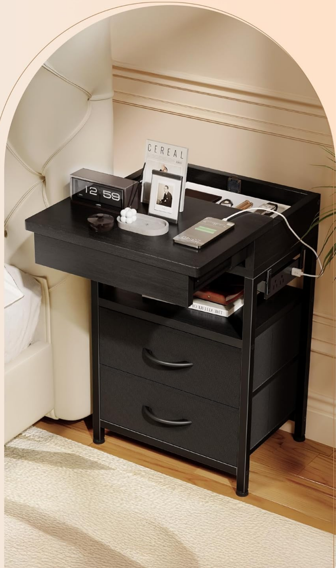
Image: Detailed view of the hidden drawer's flexible guide rails and manual keys for secure access.