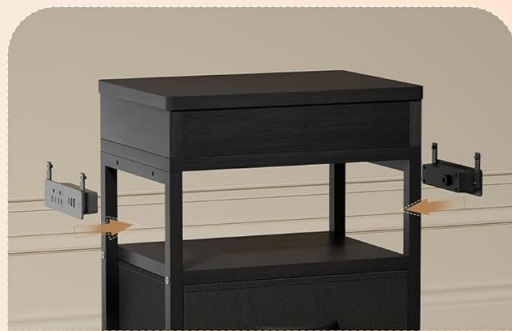
Image: Illustration of the charging station's flexible mounting options on either side of the nightstand.

Set Your Nightstand on Either Side of the Bed for Convenient Charging