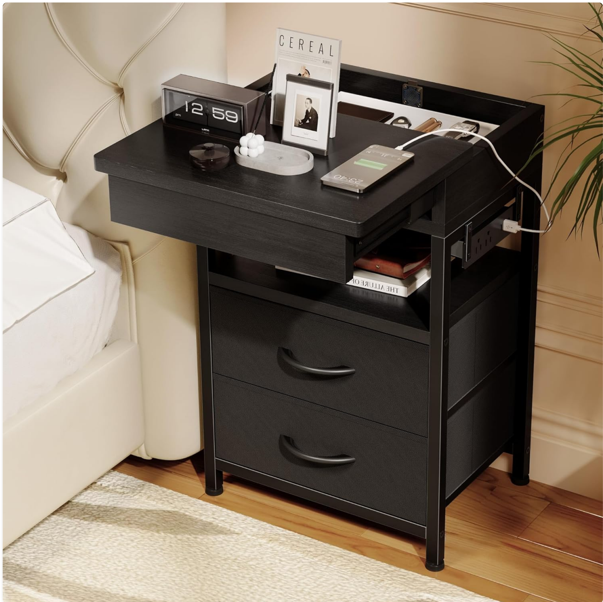
Image: Lazzanto Nightstand with hidden drawer partially open, displaying stored items and the integrated charging station.