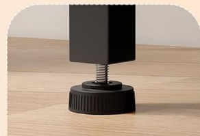
④ ADJUSTABLE Footpads

Image: Close-up of the nightstand's structural elements, including the durable metal frame and adjustable footpads.