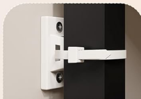
② RELIABLE Anti-Tip Kit