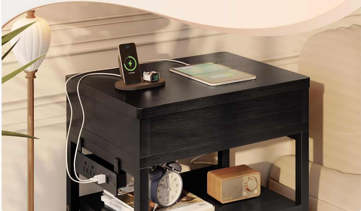
Image: Close-up of the charging station with various ports and devices connected.