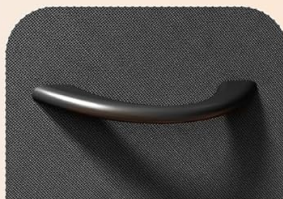
③ STURDY Drawer Pulls