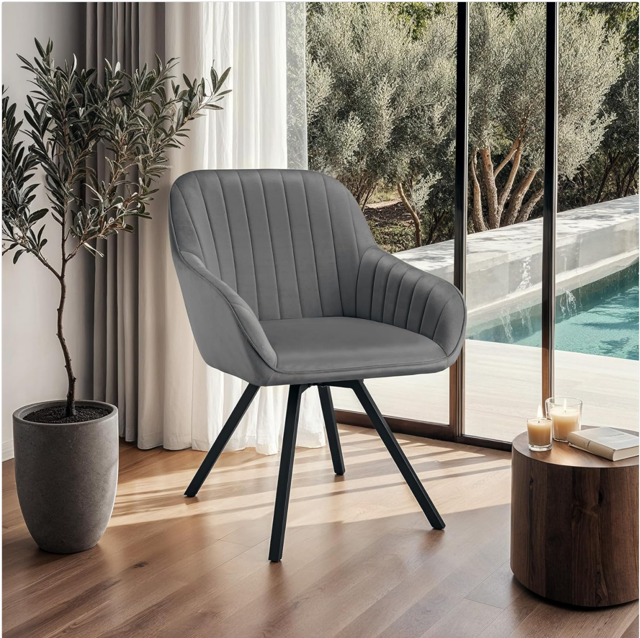
Image: The tectake Swivel Dining Chair positioned in a modern living space next to a large window, demonstrating its aesthetic appeal and functional design.