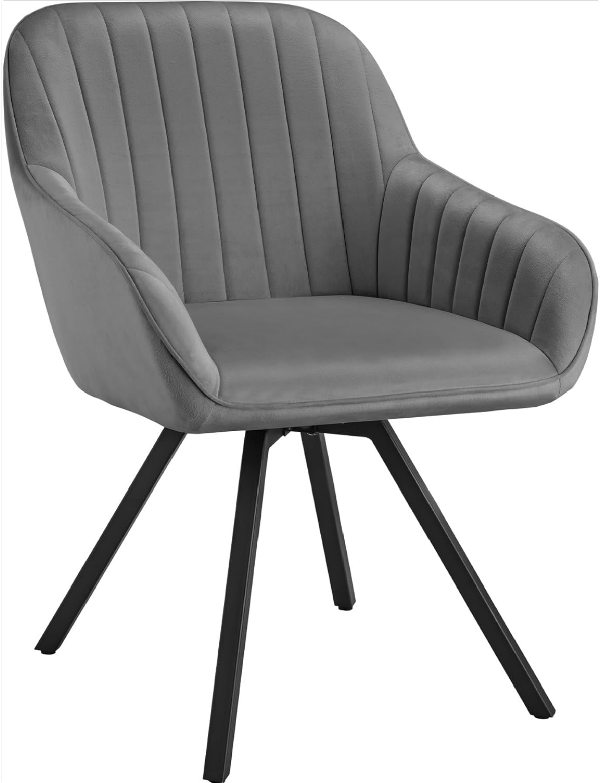
Image: Front view of the fully assembled tectake Swivel Dining Chair, showcasing its grey velvet upholstery and black metal legs.

Unpack all components and lay them out on a soft, clean surface to prevent damage. Identify the chair seat, swivel base, legs, and hardware pack.