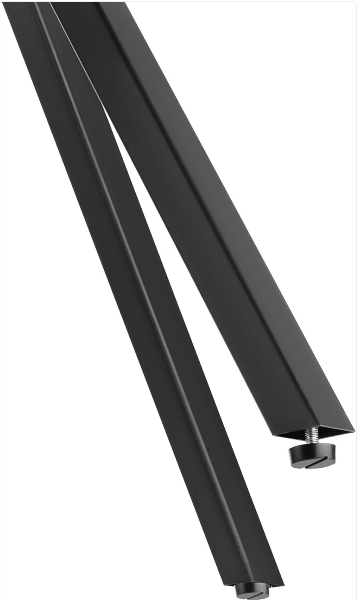
Image: Detail of the black metal chair legs, showing the square profile and the adjustable foot pads at the bottom.