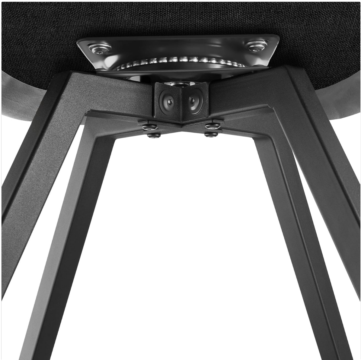
Image: Close-up view of the underside of the chair seat, showing the circular swivel mechanism attached to the base.