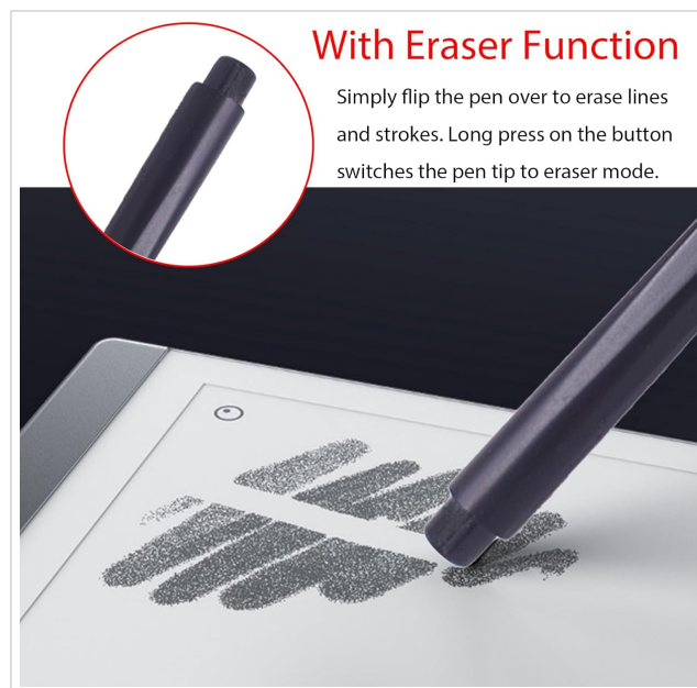
Figure 6: Close-up of the stylus pen's eraser end being used to remove digital ink from a BOOX tablet screen.

To erase, simply flip the pen over and use the eraser end on the screen. This allows for quick and intuitive corrections without interrupting your workflow.