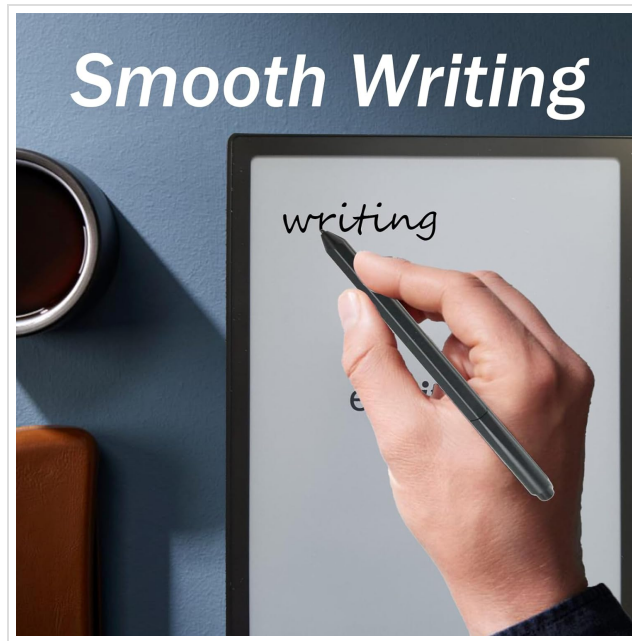
Figure 3: A hand holding the stylus pen, demonstrating smooth writing on a BOOX tablet screen.

Hold the stylus pen as you would a traditional pen. Apply varying pressure to achieve different line thicknesses and shades, thanks to the 4096 levels of pressure sensitivity. The soft tip ensures a smooth experience without scratching the screen.