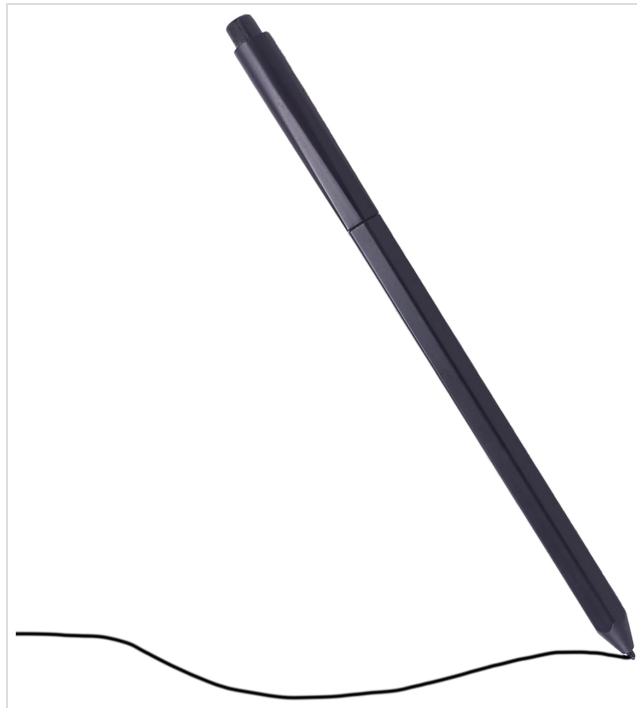
Figure 2: The Dakexiong Stylus Pen, black in color, shown at an angle as if writing on a surface.

The Dakexiong Stylus Pen is a sleek, black digital pen designed for comfortable and efficient use. It features a fine tip for precise input and an integrated eraser function for quick corrections.