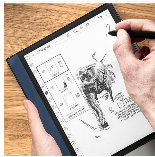
Figure 4: A hand using the stylus pen to draw an intricate sketch on a BOOX tablet, showcasing precision.