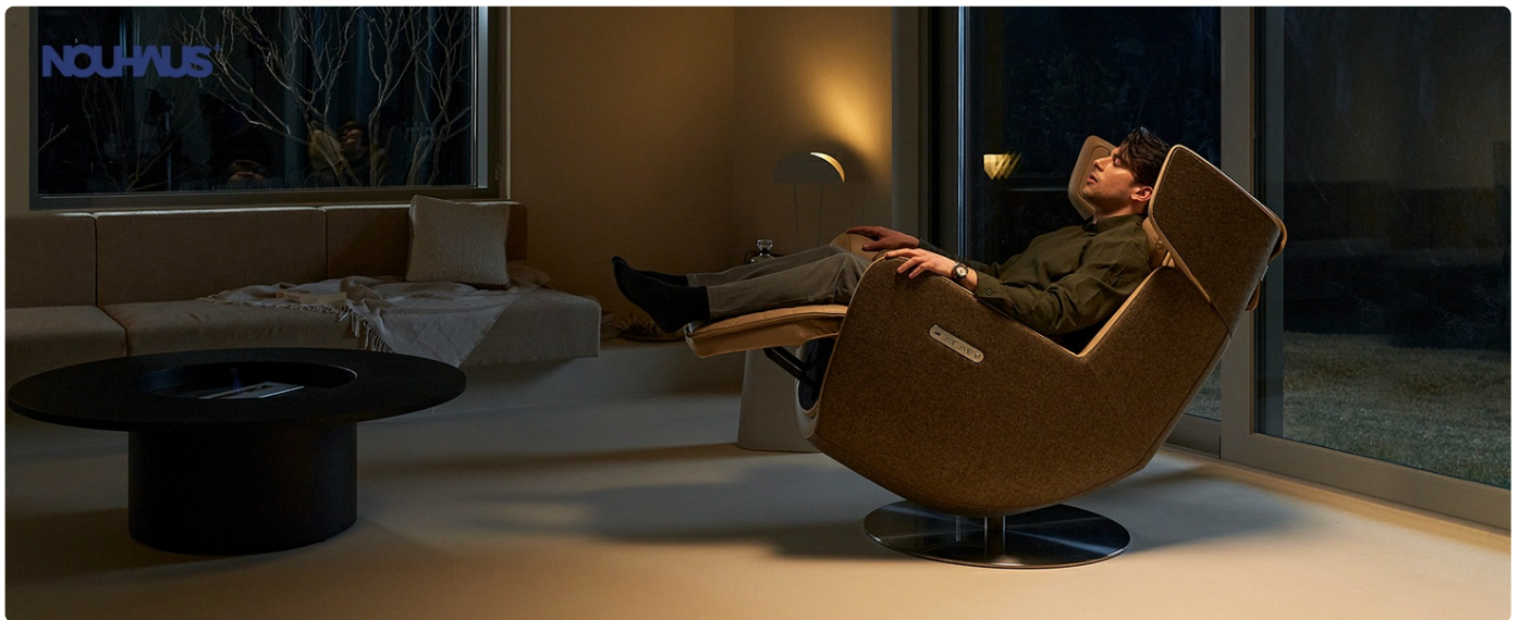
Figure 6: 2+1 Way Premium Sound System