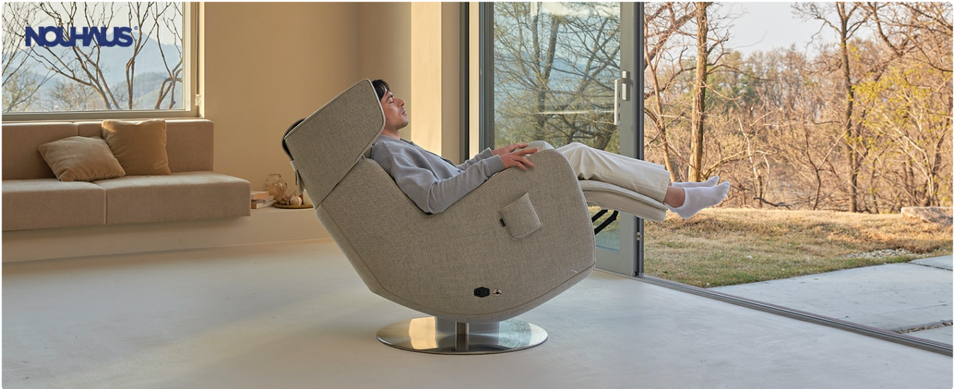
Figure 2: Chair Dimensions (45.6" H x 41.7" D x 28.7" W)