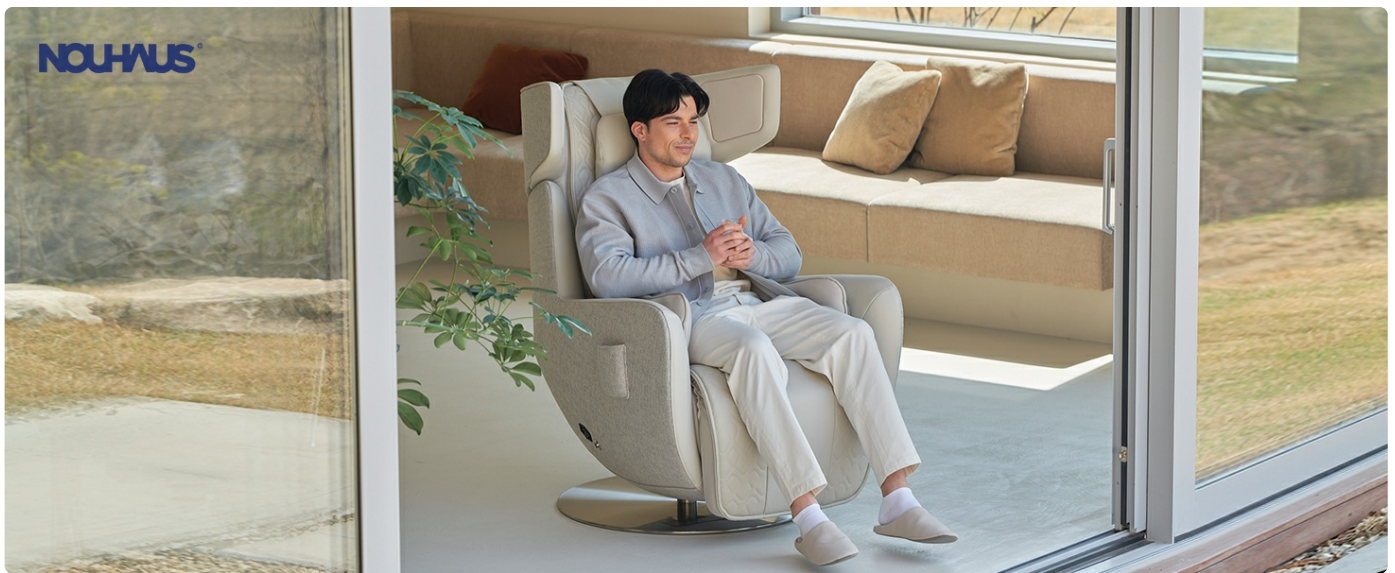
Figure 3: Key Features and Massage Modes