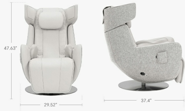
Figure 8: Product Details and Specifications