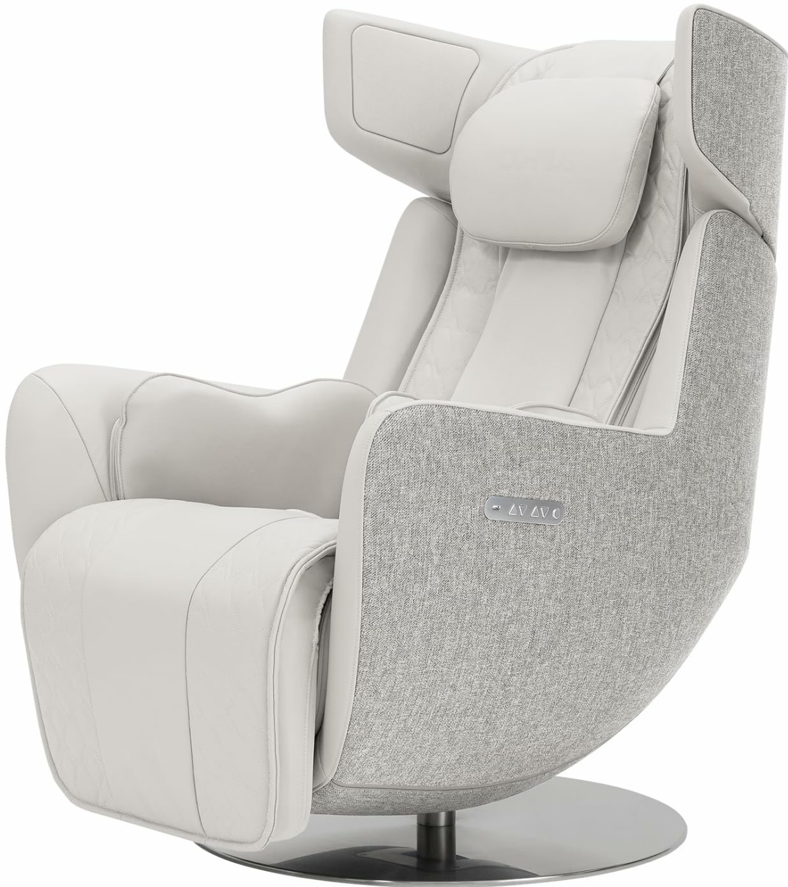
Figure 1: Nouhaus Orbit Heated Massage Chair (Elder White)