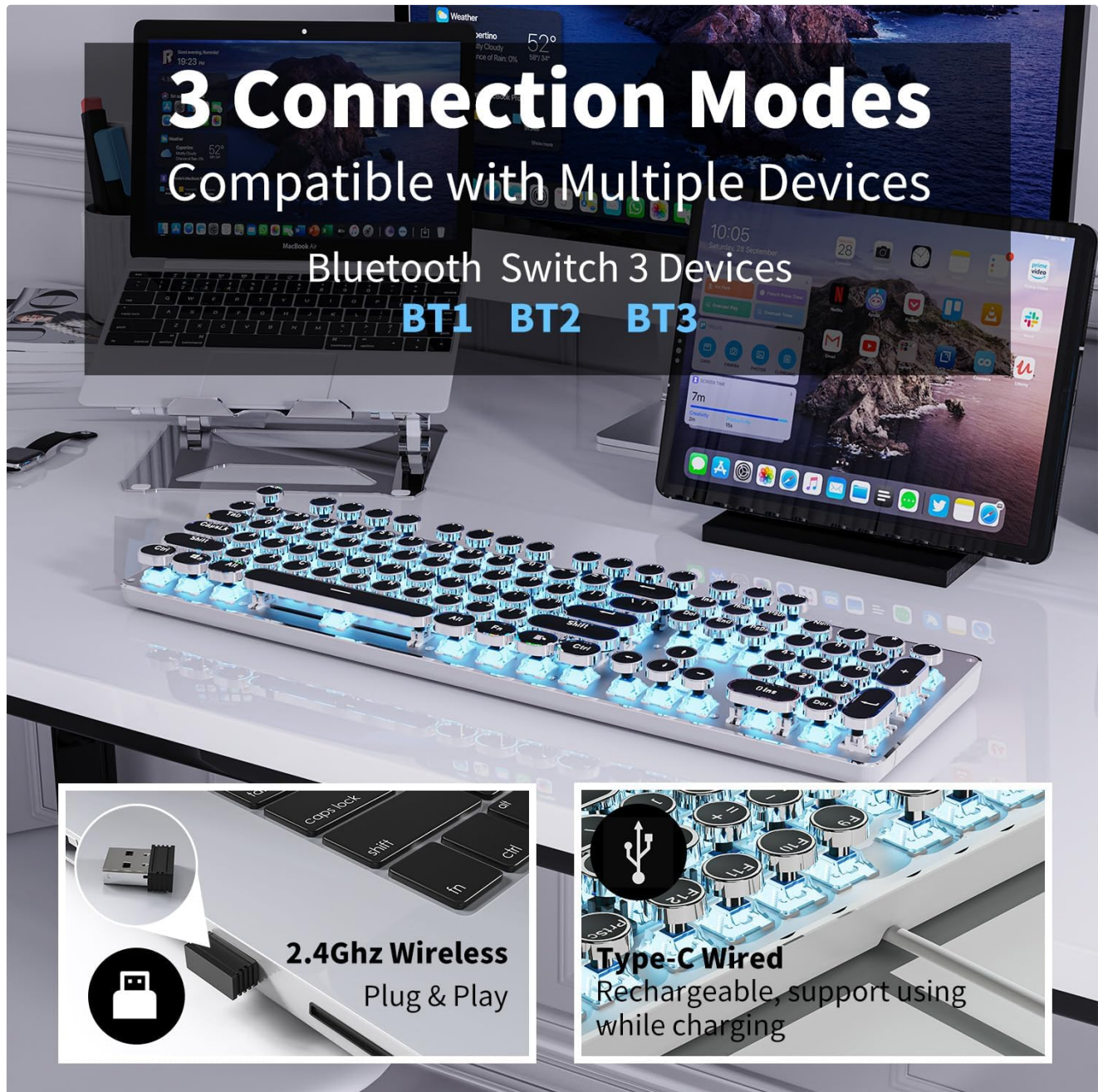
Figure 4: Mechanical Blue Switch Detail. This image provides a close-up view of the mechanical blue switches, known for their tactile and clicky feedback.