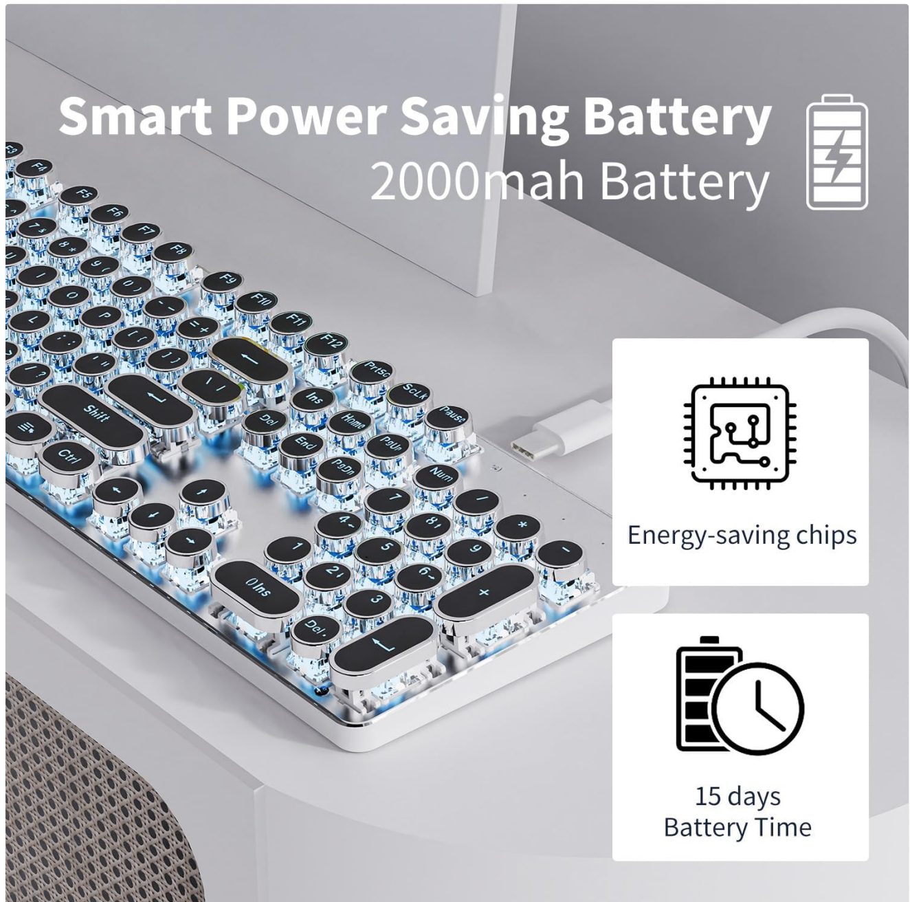
Figure 3: Smart Power Saving Battery. The image highlights the 2000mAh battery and energy-saving features of the keyboard.

The TK950 keyboard is equipped with a 2000mAh Lithium Ion battery.