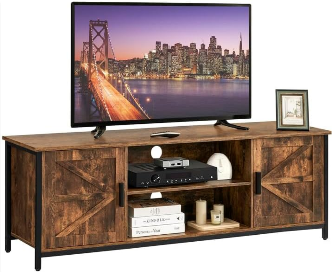
Image: The FIONESO Farmhouse TV Stand, designed to accommodate TVs up to 60 inches, features a rustic brown finish, two barn-style sliding cabinet doors, and an open central shelf. It is shown with a television and various media devices.