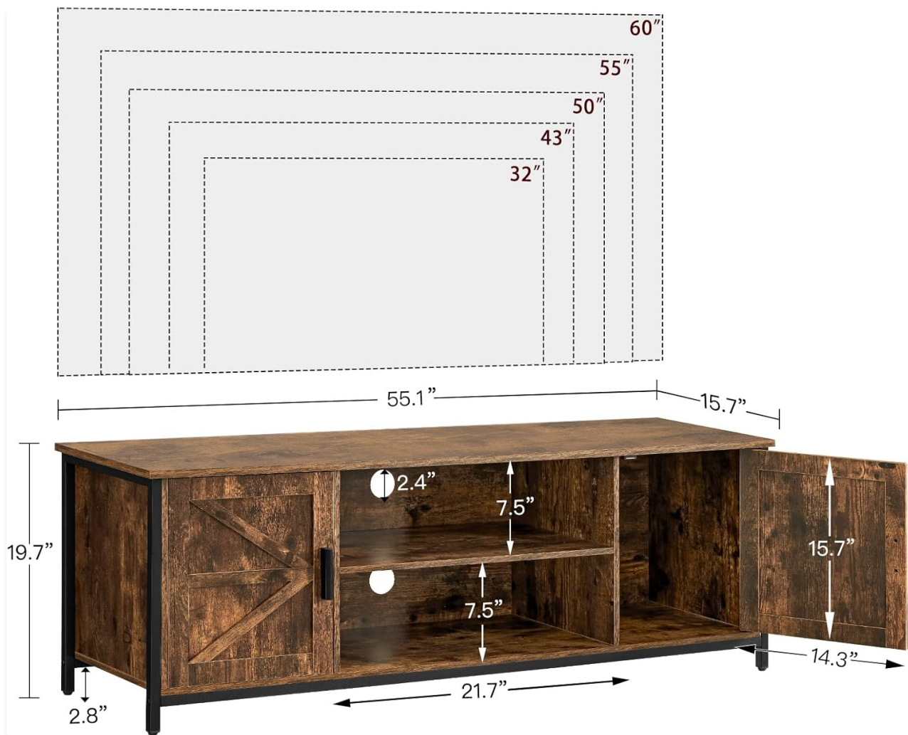
Image: A technical drawing illustrating the precise measurements of the TV stand, including its total length (140 cm / 55.1 inches), depth (40 cm / 15.7 inches), height (50 cm / 19.7 inches), and the dimensions of the internal shelves and cabinet openings.