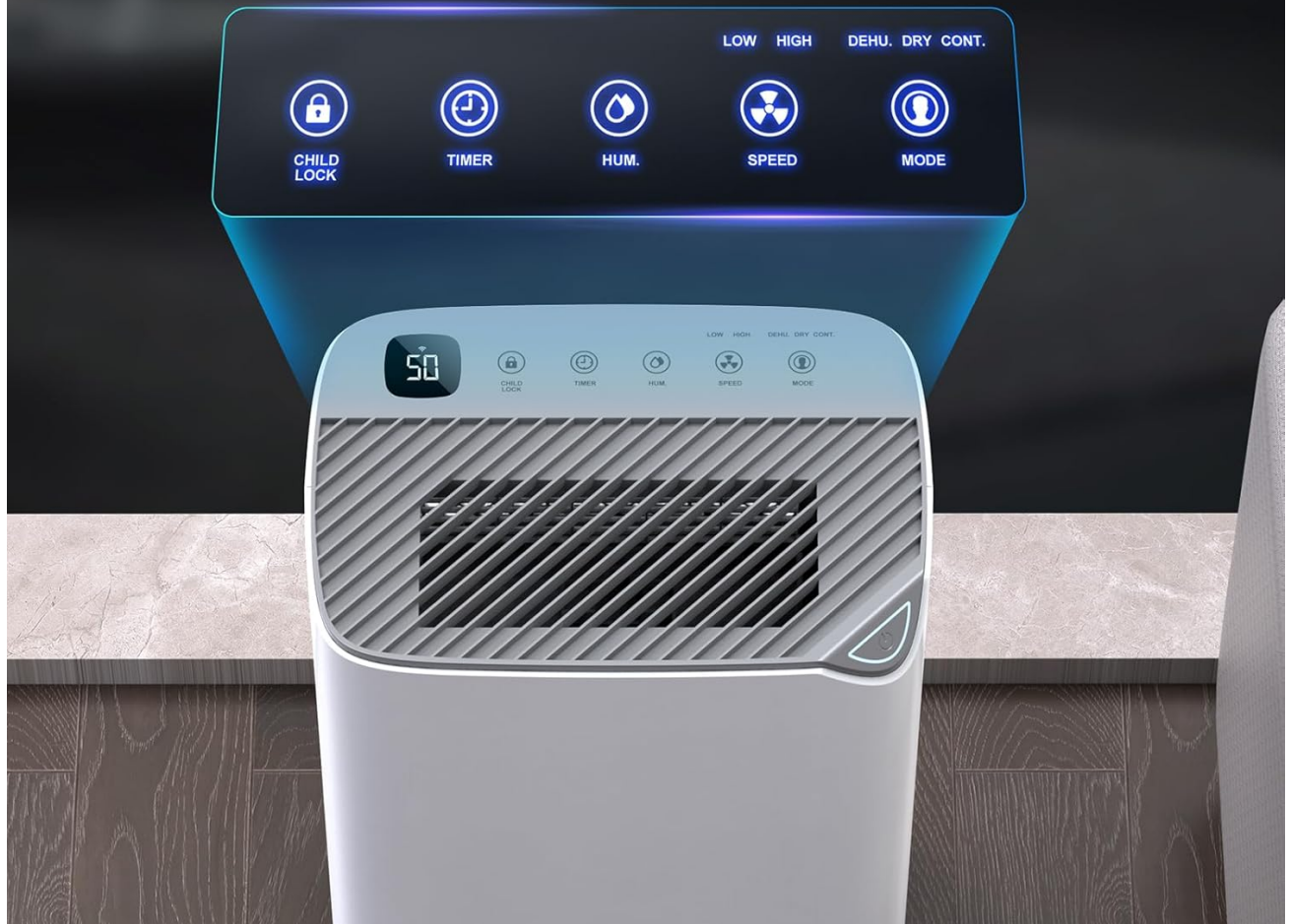
Image 3.2: The intelligent control panel features a digital display and touch controls for Child Lock, Timer, Humidity setting, Fan Speed, and Mode selection.

The intelligent control panel is easy to operate and convenient to use