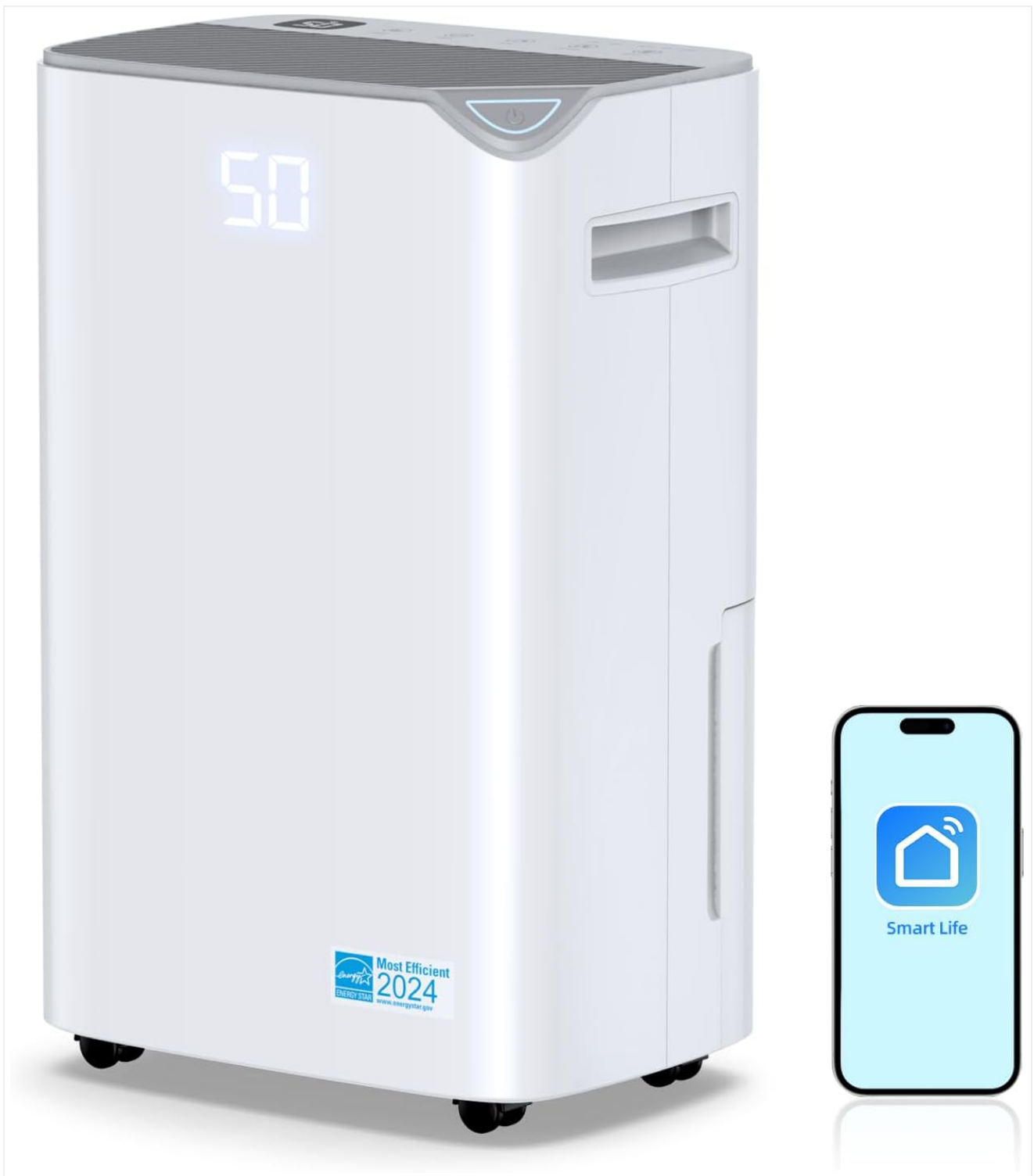
Image 1.1: The BBianLyy PD08DW Dehumidifier with its accompanying Smart Life app icon.