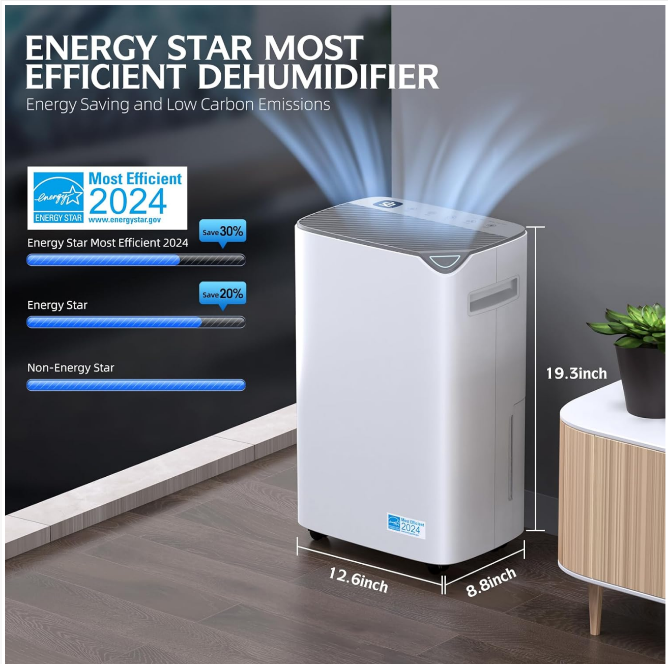
Image 3.1: Front view of the dehumidifier with key dimensions: 8.8 inches depth, 12.6 inches width, 19.3 inches height.

Familiarize yourself with the main parts of your dehumidifier: