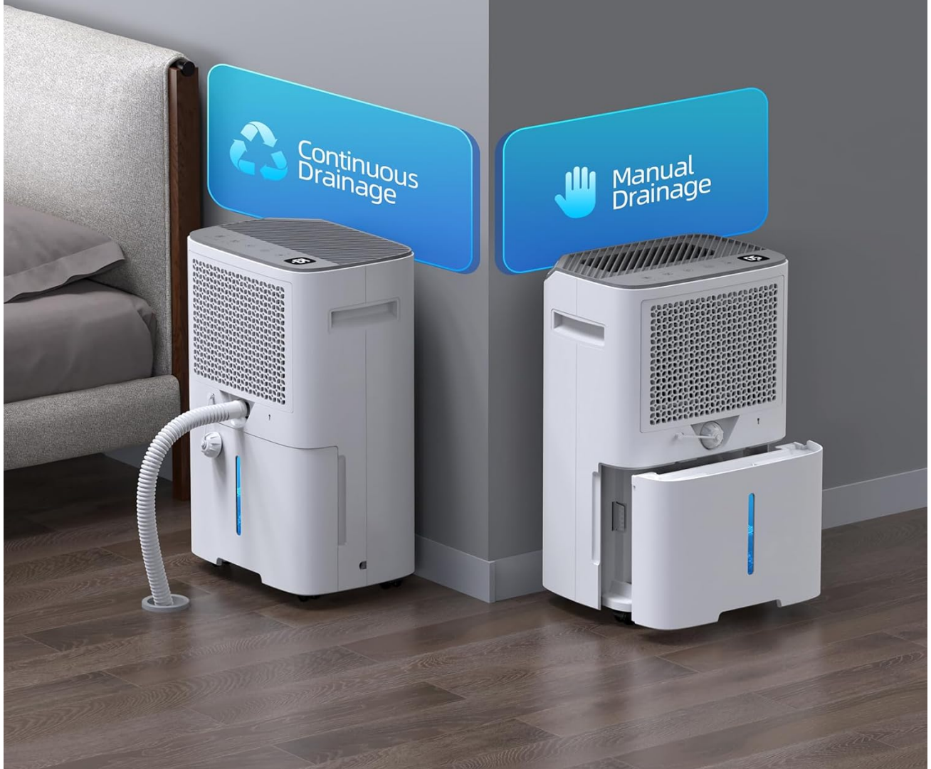
Image 6.1: The dehumidifier supports both continuous drainage via a hose and manual drainage by emptying the water tank.

Two dehumidification methods to quickly eliminate humid environments