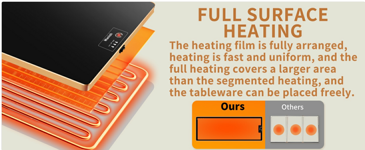
Image: Visual guide demonstrating the simple setup and use of the warming tray.