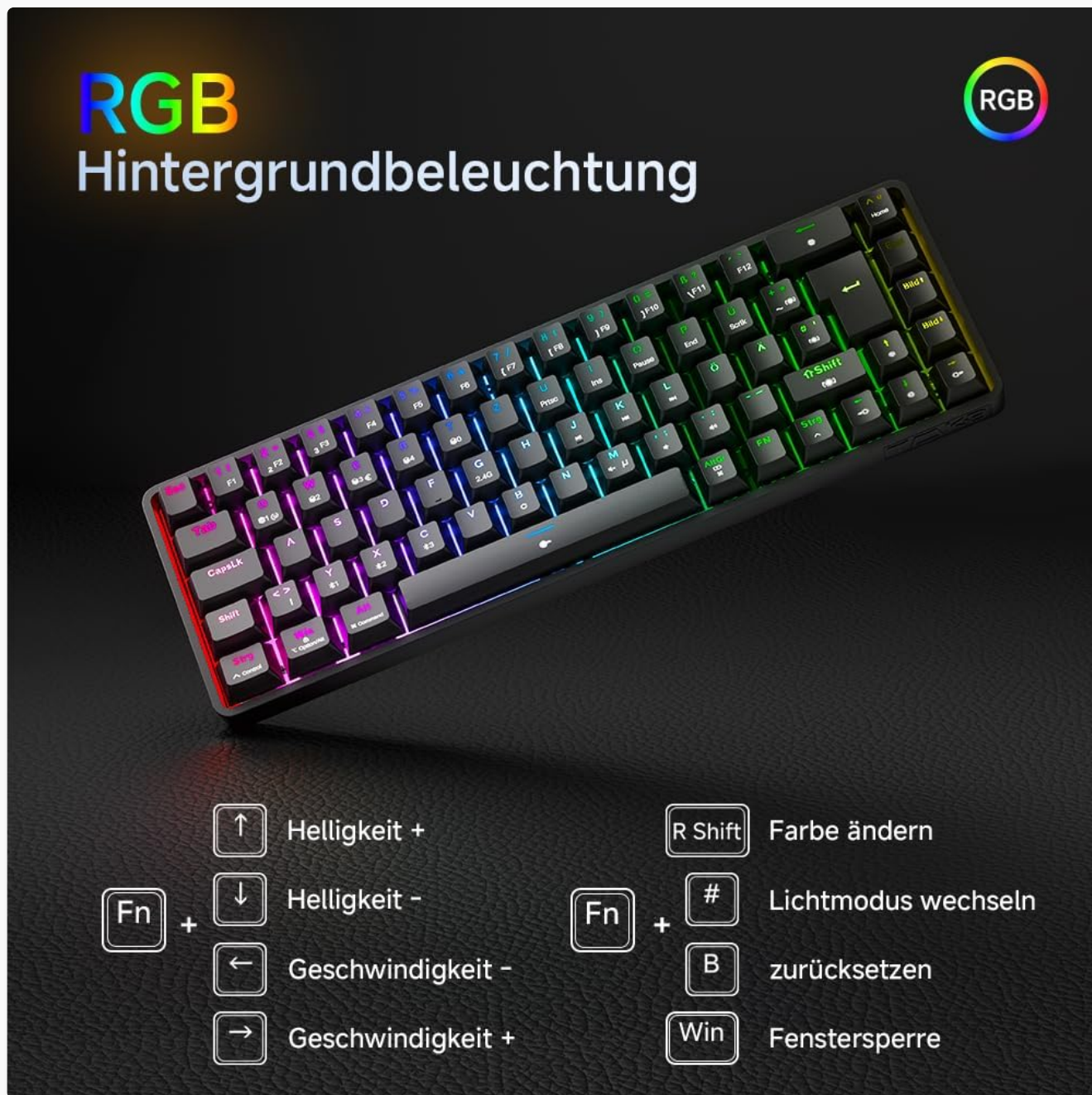
Image Description: This image details the FN key combinations for controlling the RGB backlight. It shows how to adjust brightness (FN + Up/Down Arrow), change color (FN + Right Shift), switch light modes (FN + #), reset settings (FN + B), and lock the Windows key (FN + Win).

The T68 features a dynamic RGB lighting system with 18 different lighting modes and 16.8 million customizable colors. Use the following FN key combinations to control the backlighting: