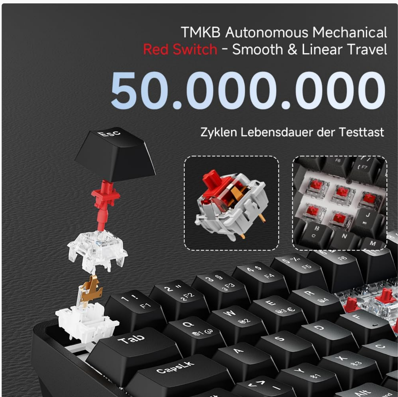
Image Description: This image illustrates the internal mechanism of a TMKB autonomous mechanical red switch, highlighting its linear travel. It also states a lifespan of 50 million cycles per key, emphasizing durability.

The TMKB T68 keyboard utilizes self-developed mechanical switches with a lifespan of 50 million keystrokes per switch. This ensures consistent tactile feedback over extended use. This model is equipped with linear red switches , which are known for their smooth and quiet operation, making them suitable for both office work and gaming.