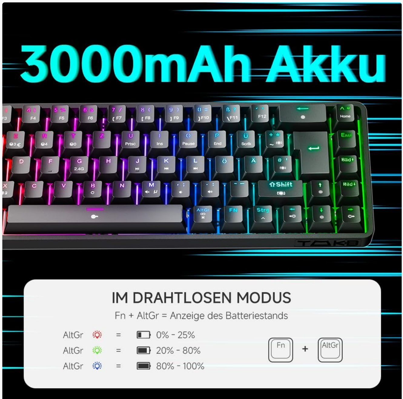
Image Description: This image demonstrates how to check the battery level in wireless mode by pressing FN + AltGr. It shows visual indicators for battery levels: 0-25%, 20-80%, and 80-100%.

The T68 is equipped with a 3000 mAh battery. In 2.4GHz or Bluetooth mode, you can check the battery status using a specific key combination: