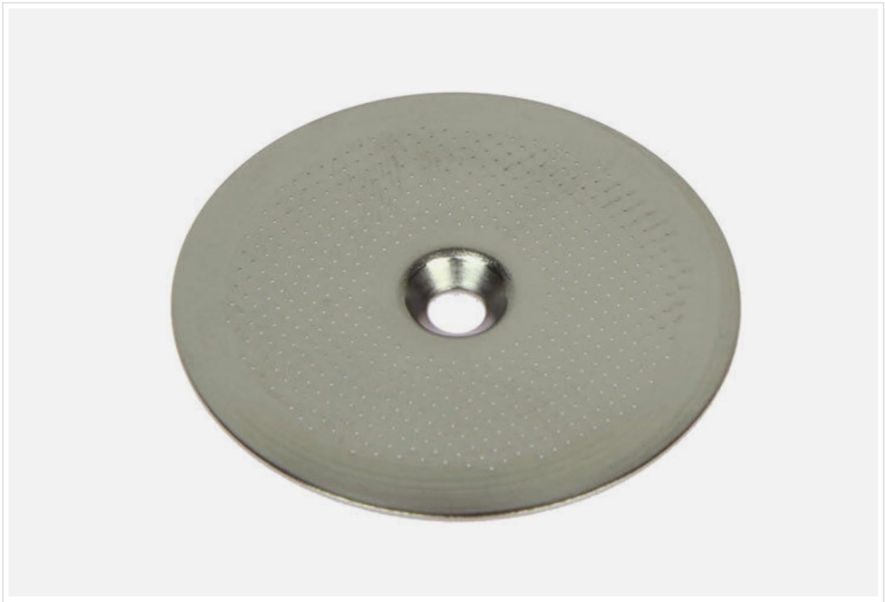
Figure 1: A close-up view of the metallic DeLonghi Coffee Maker Boiler Filter, part number 6013213181, showing its circular shape and central opening.