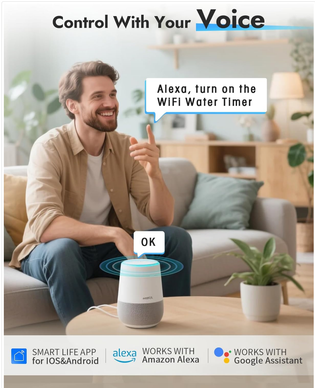
Image: A man using a voice assistant (Alexa) to issue a command, 'Alexa, turn on the WiFi Water Timer', illustrating the voice control feature.

The timer is compatible with Alexa and Google Assistant, allowing you to control watering with simple voice commands.