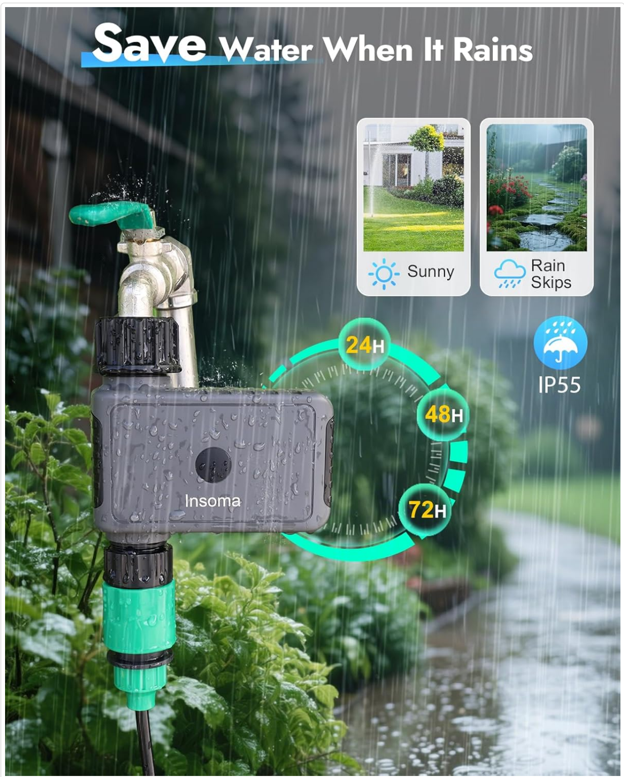
Image: The water timer installed outdoors during rain, with an overlay showing rain delay options for 24, 48, or 72 hours, indicating its IP55 water resistance.