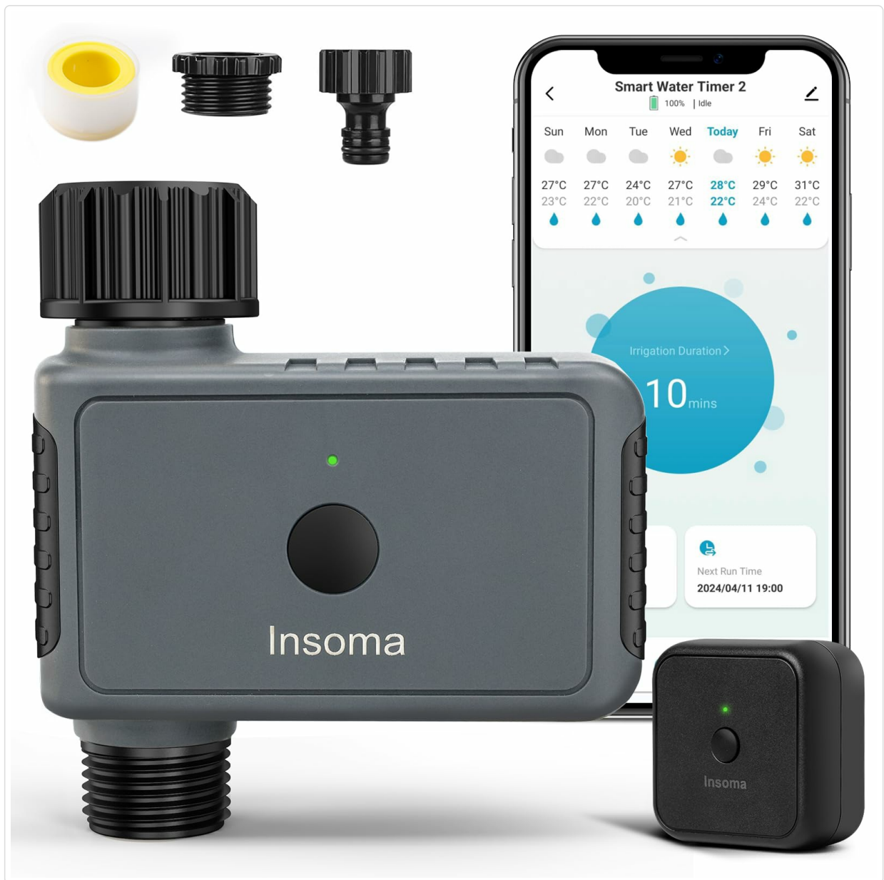
Image: The Insoma WiFi Sprinkler Timer connected to a faucet, with the separate WiFi hub shown.