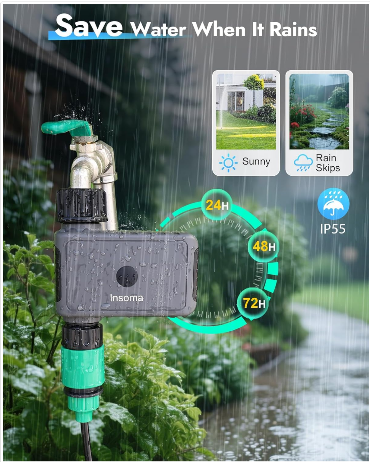
Image: The Insoma WiFi Water Timer securely attached to an outdoor water faucet, with a garden hose connected to its outlet.