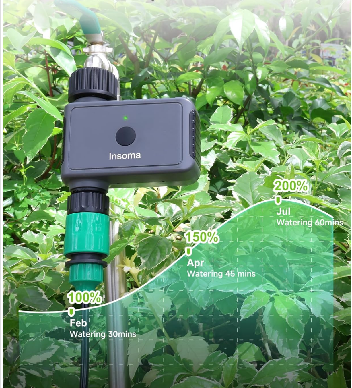
Image: A graph illustrating how watering duration can be adjusted throughout the year (e.g., 30 mins in Feb, 45 mins in Apr, 60 mins in Jul) to match seasonal plant requirements.

Meet The Watering Needs Of Different Seasons