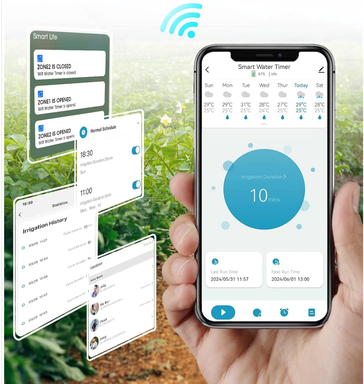
Image: A smartphone displaying the Smart Life app interface, showing weather information, current irrigation duration, and a detailed irrigation history log.