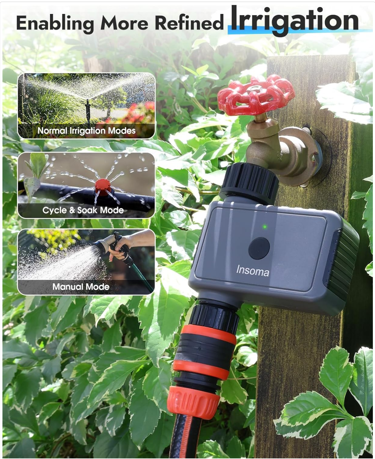
Image: Visual representation of various irrigation methods, including normal sprinkler operation, drip irrigation (cycle & soak), and manual hose watering.