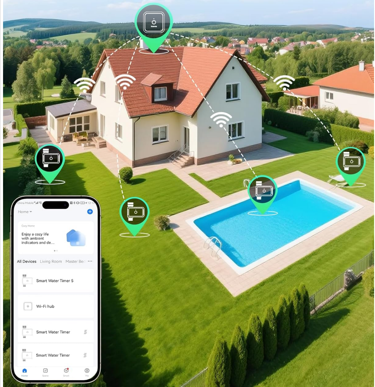
Image: An aerial view of a house and garden, illustrating how multiple WiFi water timers can be connected wirelessly to a central WiFi hub to manage different watering zones.

Add Additional Timers To Create Multiple Watering Zones In Your Garden