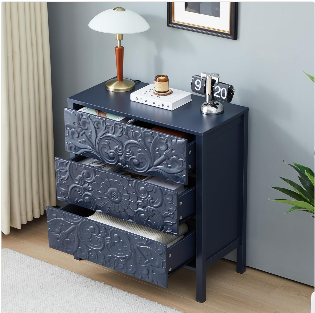
Image 5.1: The dresser with its three drawers partially open, illustrating the ample storage space for various items.

Video 5.1: Demonstration of the dresser's features, including the carved design, smooth drawer operation, push-to-open mechanism, and water-resistant surface.