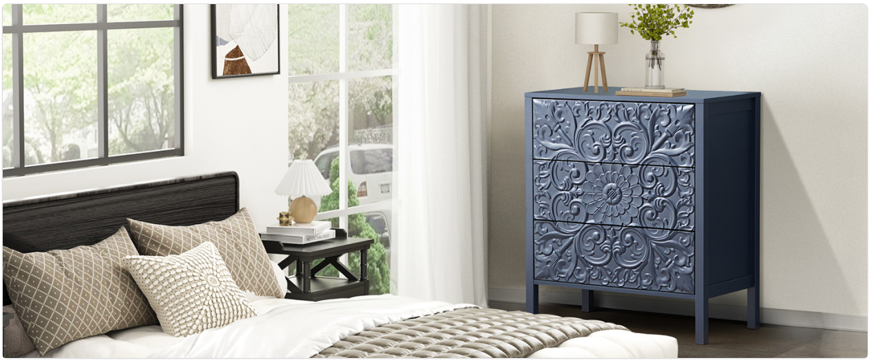
Image 2.1: Visual representation of the anti-tipping device, the intricate relief design on the drawers, and the organized interior of the drawers.