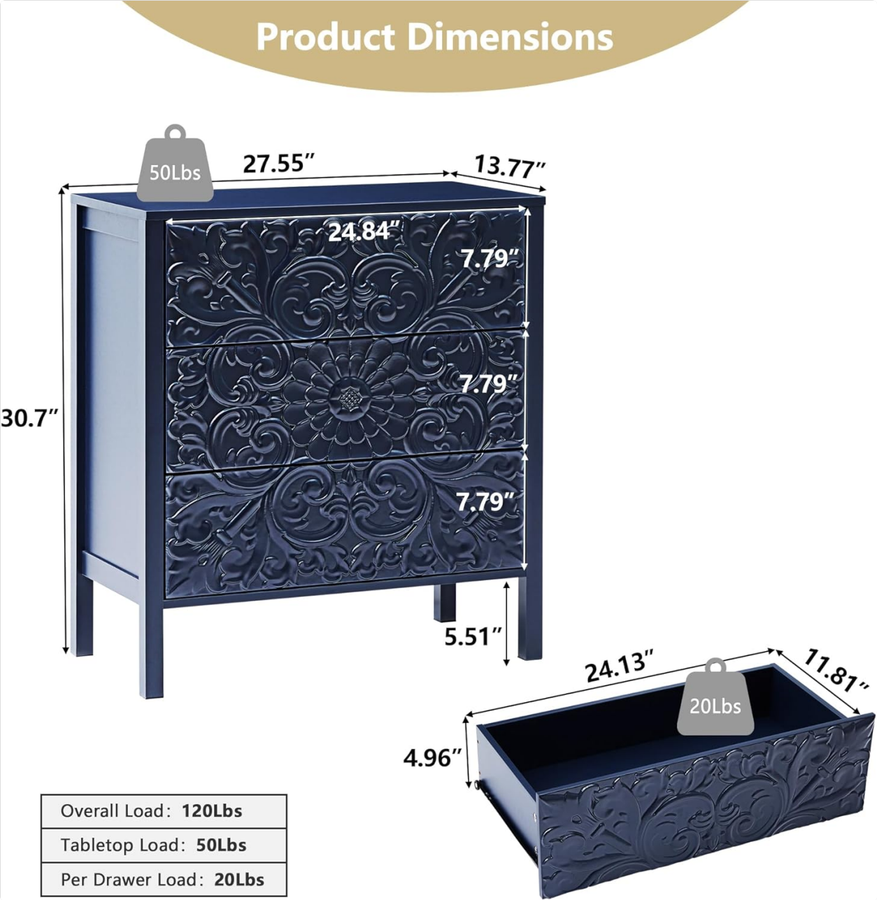
Image 8.1: Detailed diagram showing the product dimensions and various load capacities for the dresser and its drawers.

This weselon dresser comes with a limited warranty. For specific warranty details, please refer to the documentation included with your purchase or contact weselon customer service. If you have any questions, require assistance with assembly, or need to report missing/damaged parts, please