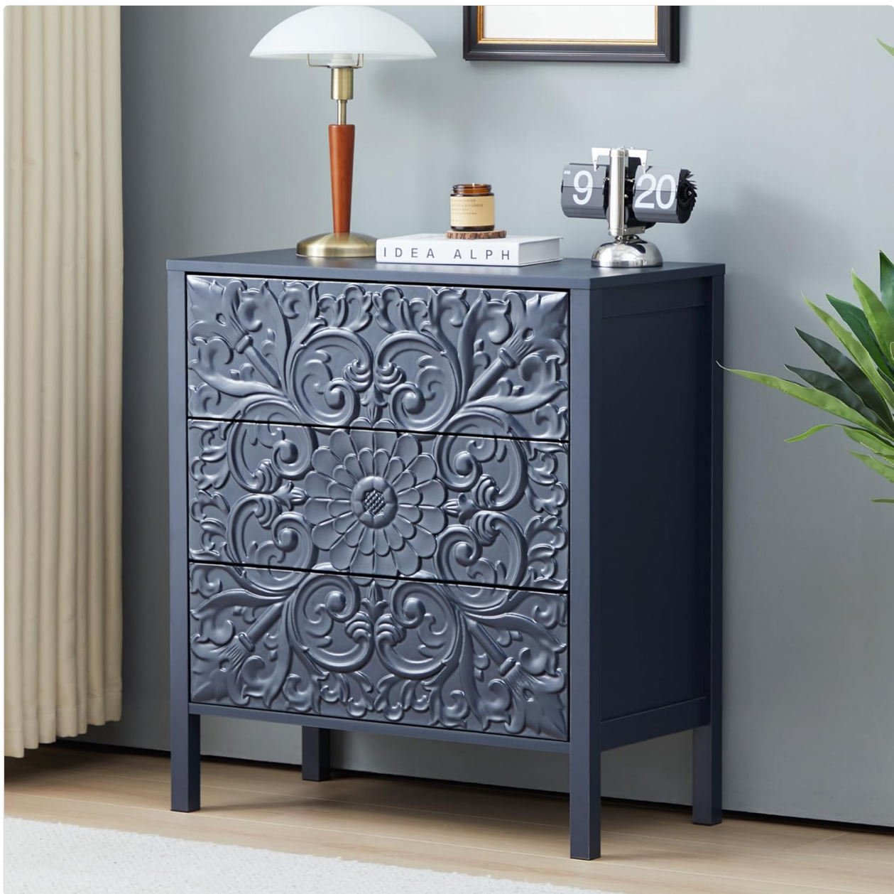
Image 1.1: The weselon Carving 3-Drawer Dresser, featuring its distinctive carved drawer fronts and gray-blue finish.