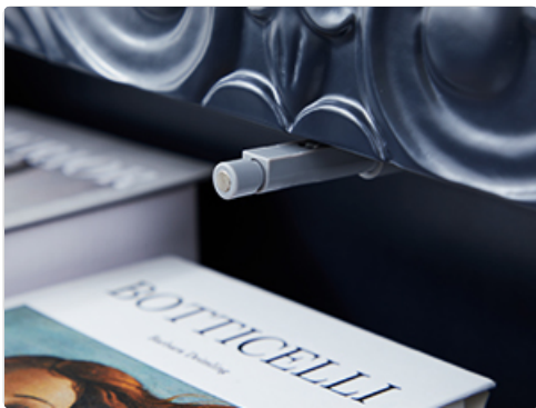
Image 5.2: A close-up view of the push-to-open mechanism located inside the drawer, allowing for handle-free operation.