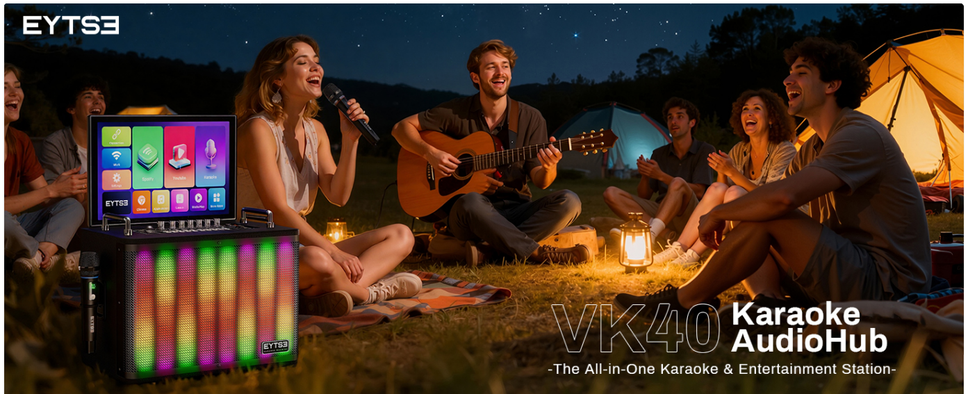
Image: Touch screen interface with Wi-Fi option.