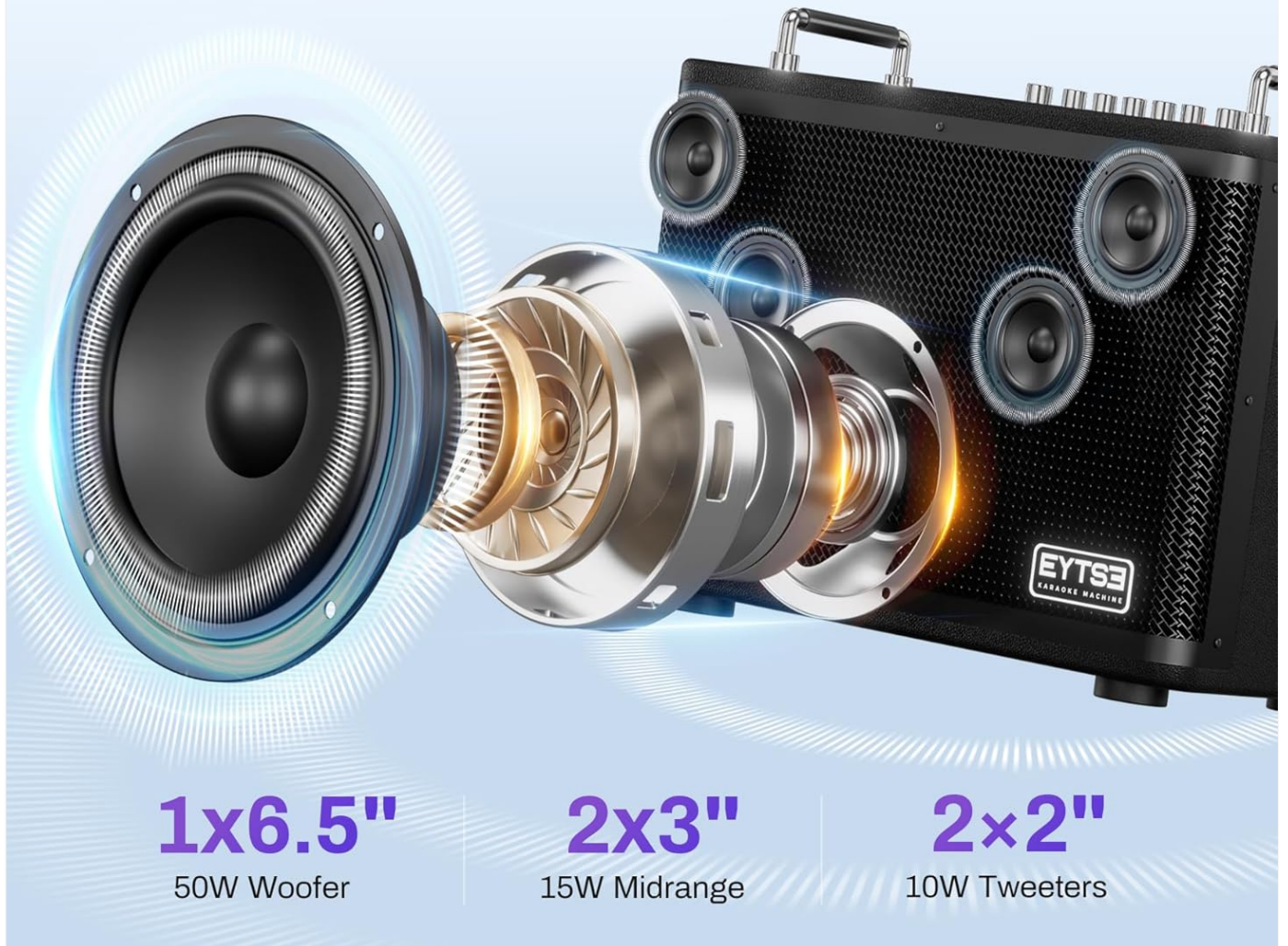
Image: Speaker components.

Command a powerful 5-speaker system soundstage with punchy bass, crystal-clear vocals and crisp highs, and full control over mic and music's bass, treble, and echo.