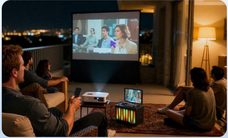
Image: EYTSE VK40 Karaoke Machine and its accessories.

Precise navigation with mouse-mode remote