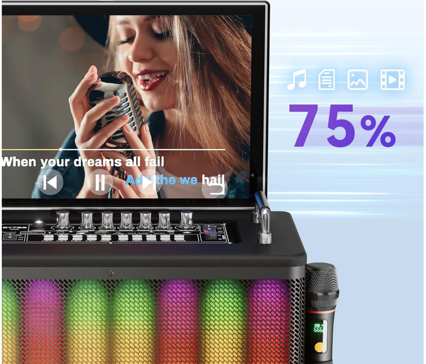
Image: Wi-Fi 6 connectivity.

Experience smoother streaming: Wi-Fi 6 cuts latency by 75% for sharper video and richer sound.