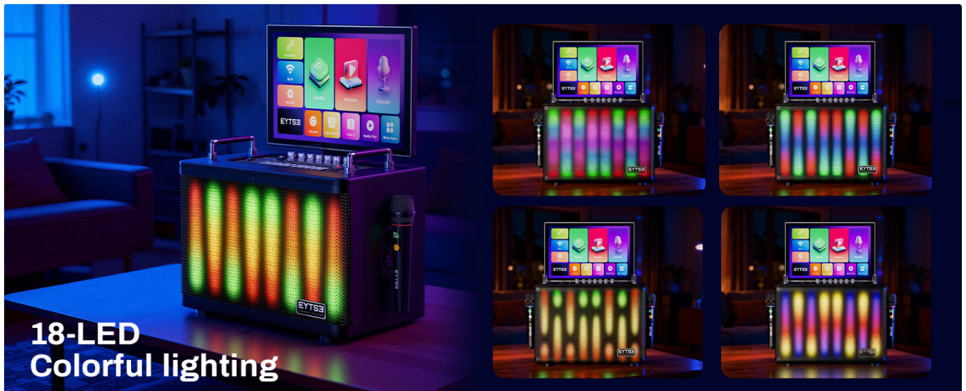
Image: Dynamic LED lighting.

The control panel provides access to microphone volume, bass, treble, echo, and music volume. It also includes input ports for HDMI, USB, TF card, AUX IN, Headset, AUX OUT, and OTG/LIVE connections.