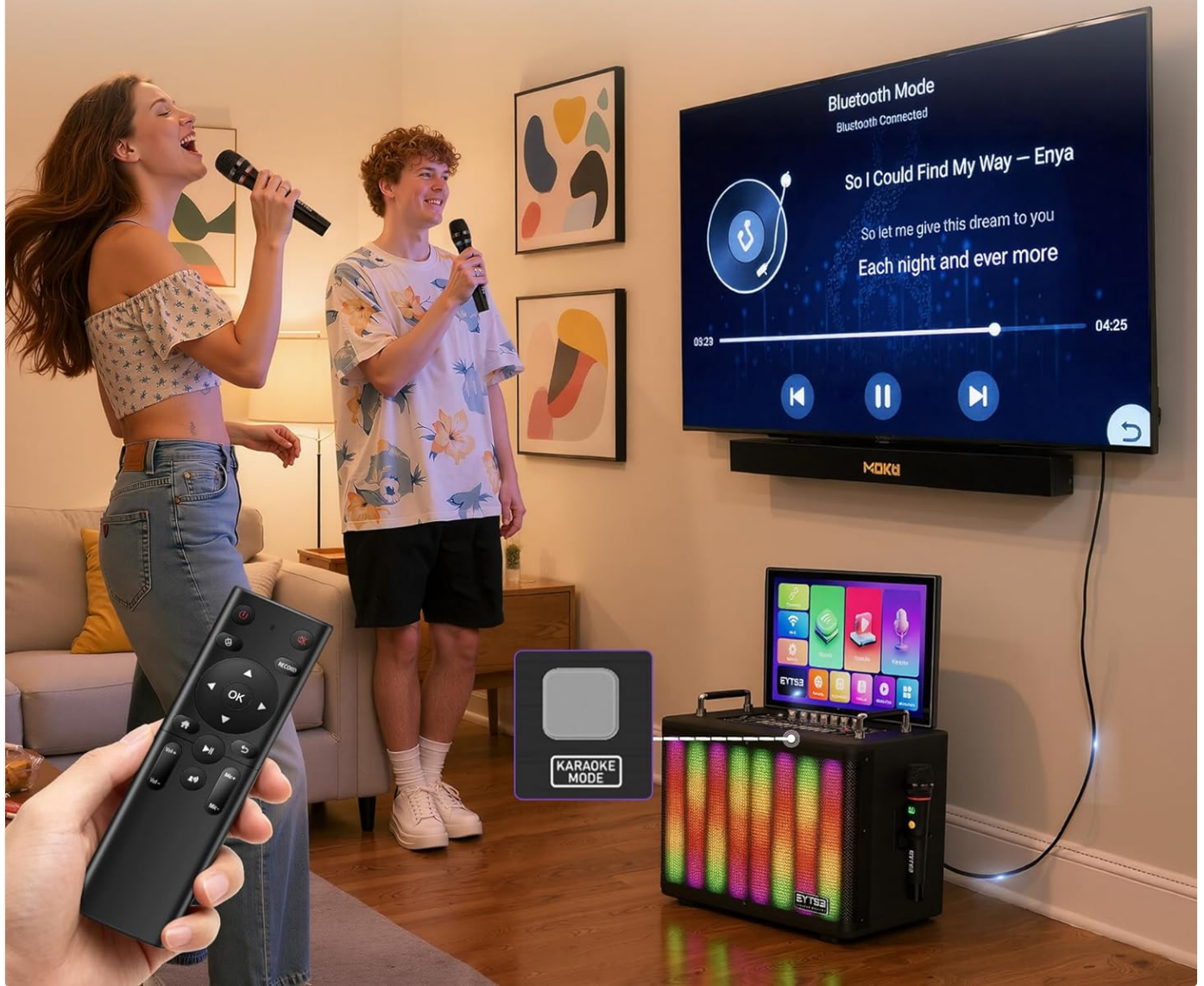
Image: HDMI connection to TV.

Connect via HDMI for a big-screen lyrics party! And control everything from your couch with the mouse-key remote.