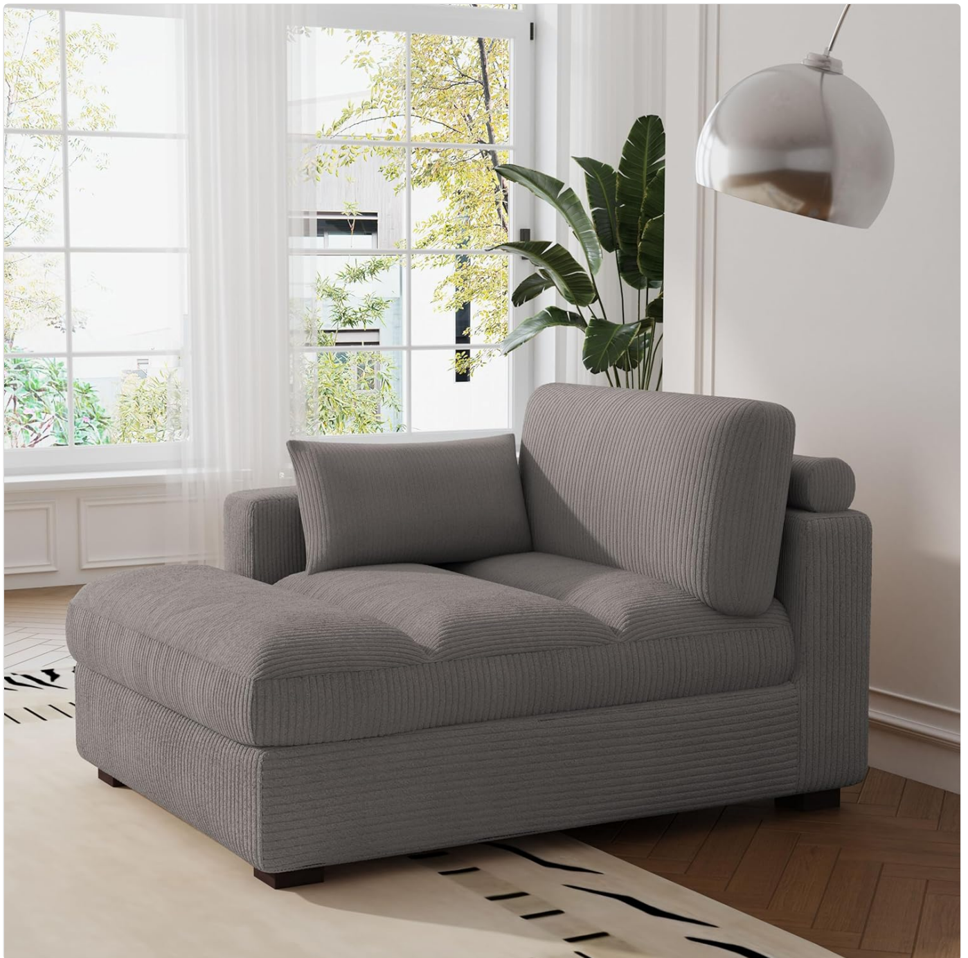
Figure 1: UIXE Oversized Chaise Lounge Chair in Light Gray.