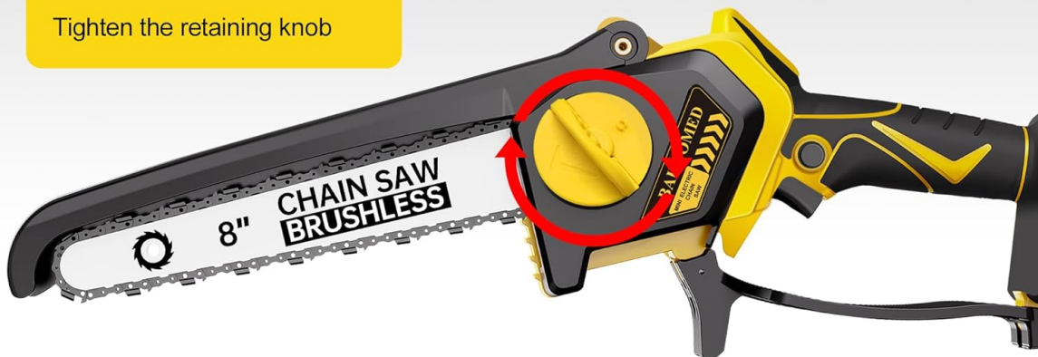
Image 5: Demonstrates the tool-free chain tension adjustment knob, showing how to loosen and tighten it for chain installation and adjustment.