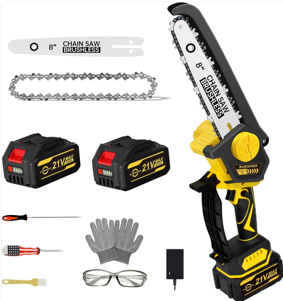
Image 1: Contents of the BAHOOMED Mini Cordless Chainsaw package, including the chainsaw unit, two batteries, two chains, guide bar, charger, screwdriver, file, goggles, gloves, and brush.