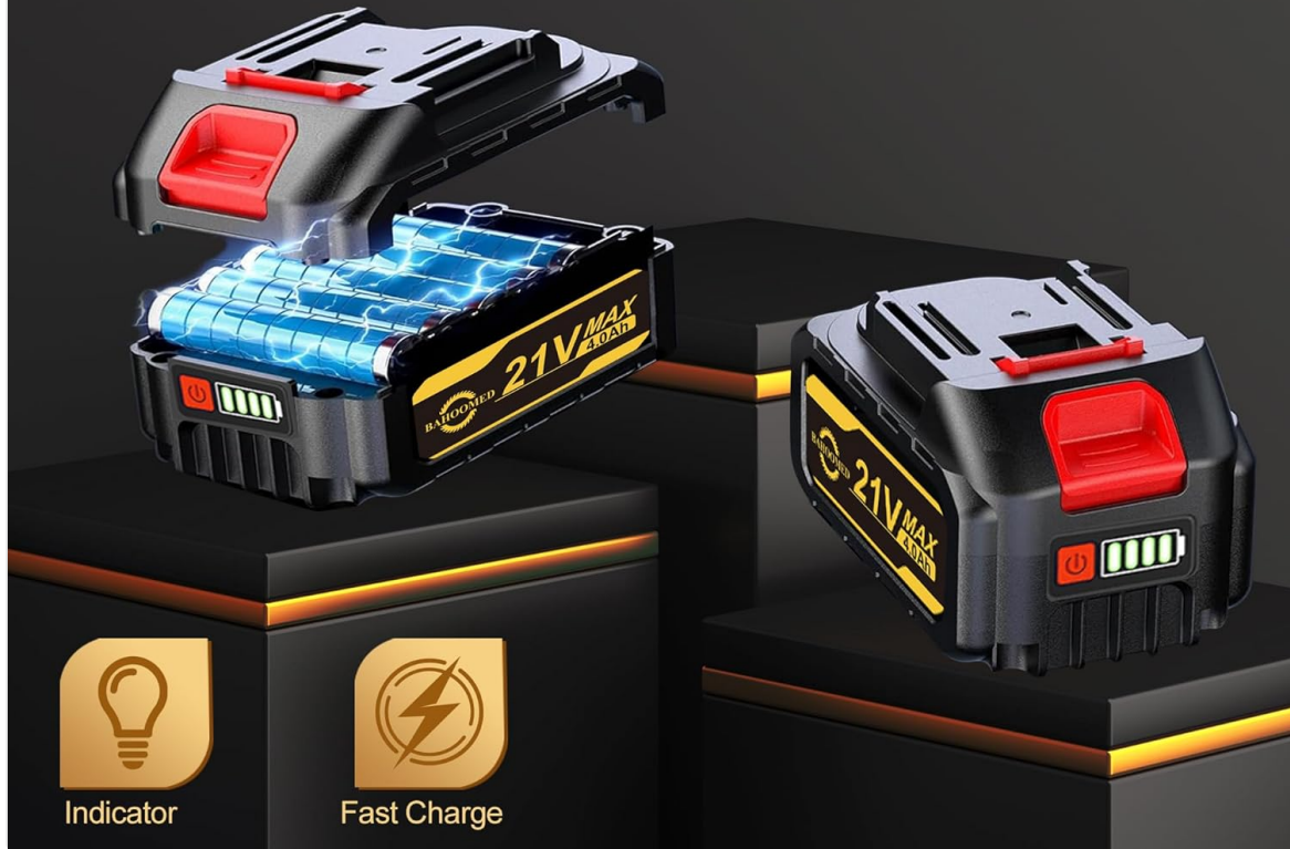
Image 4: Two 4000mAh high-capacity batteries, showing their indicator lights and fast charge capability.

High-Capacity Battery for Longer Operating Time