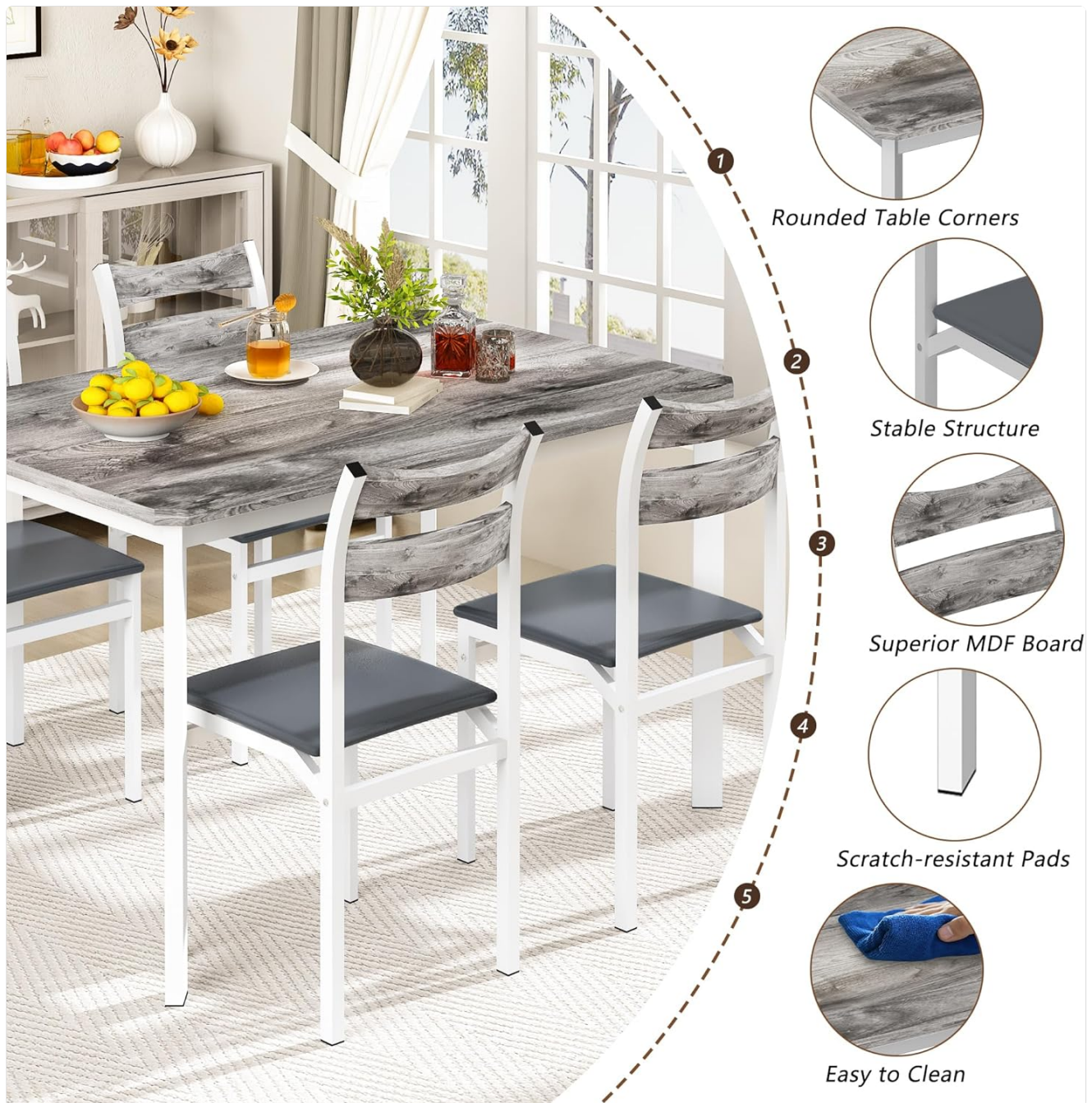
Figure 2.1: Key features of the Recaceik Dining Table Set, highlighting rounded corners, stable structure, MDF board, scratch-resistant pads, and easy-to-clean surface.

For a visual reference of the components and their features, please see the image below: