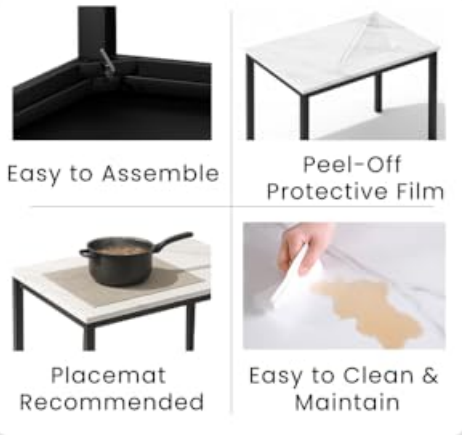
Figure 5.1: Maintenance tips for the dining set, including the recommendation for placemats and ease of cleaning.

We are committed to enhancing your experience by providing detailed instructions and helpful tips to ensure you get the most out of our products.