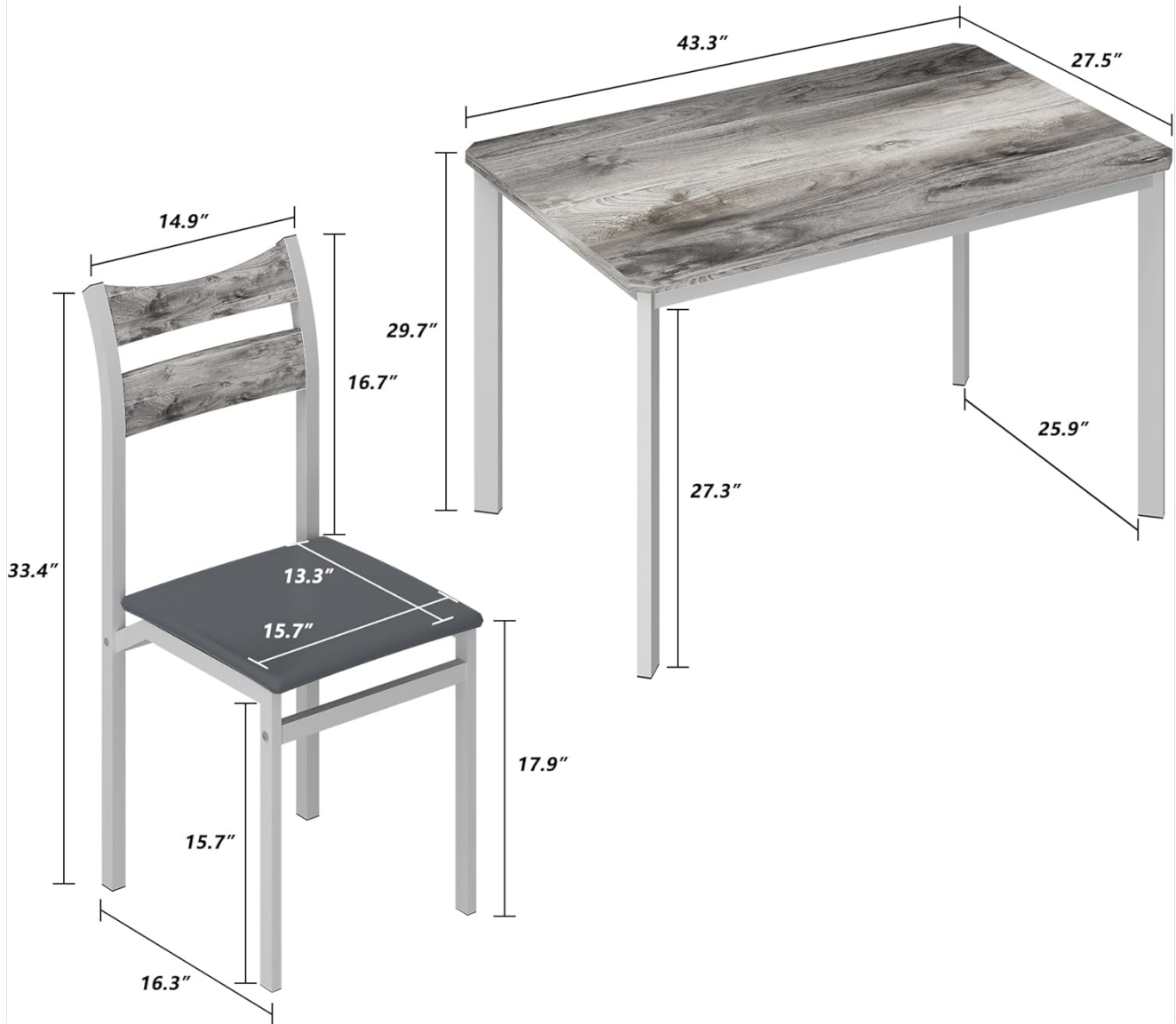
Figure 7.1: Detailed dimension information for the dining table and chairs.