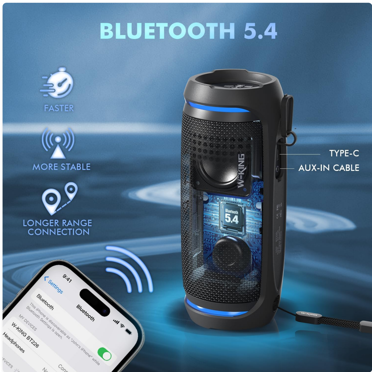
Figure 2: Bluetooth 5.4 Connectivity and Ports