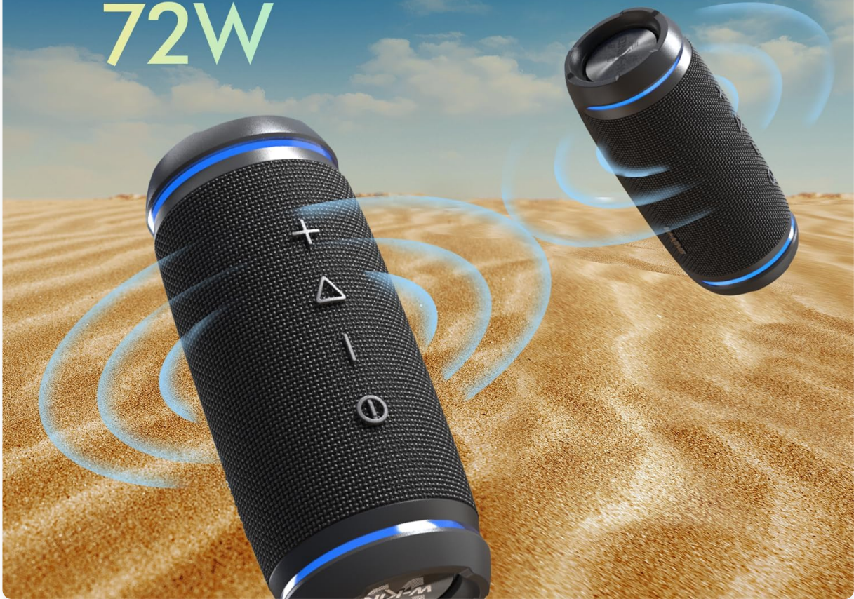
Figure 5: True Wireless Stereo Setup