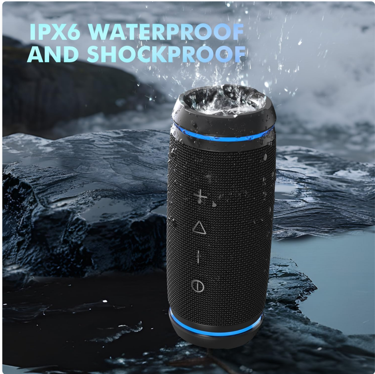
Figure 7: IPX6 Waterproof Design