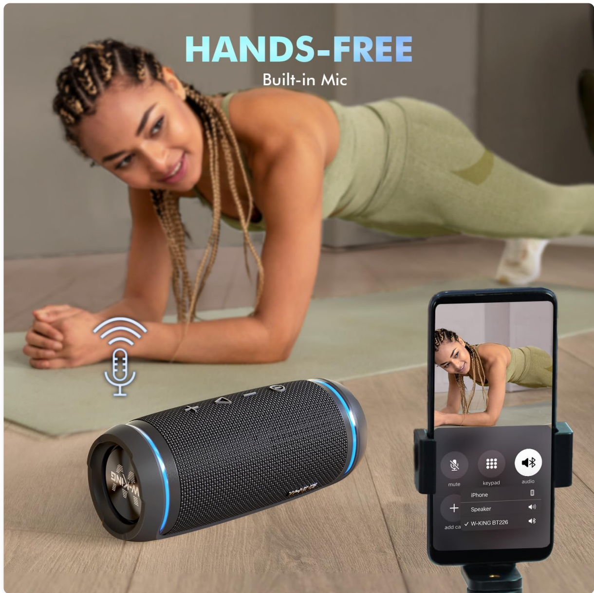
Figure 6: Hands-Free Call Functionality