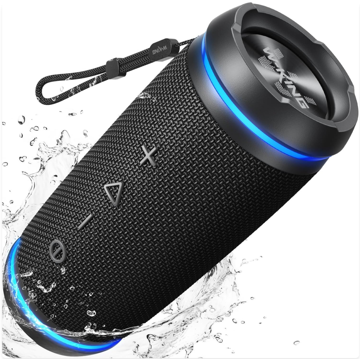
Figure 1: W-KING BT226 Portable Bluetooth Speaker