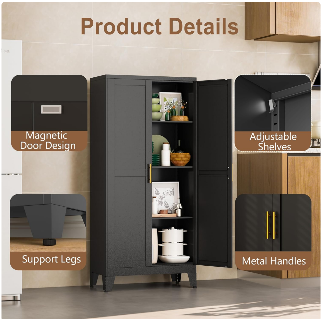
Figure 3: Key Features for Assembly and Use