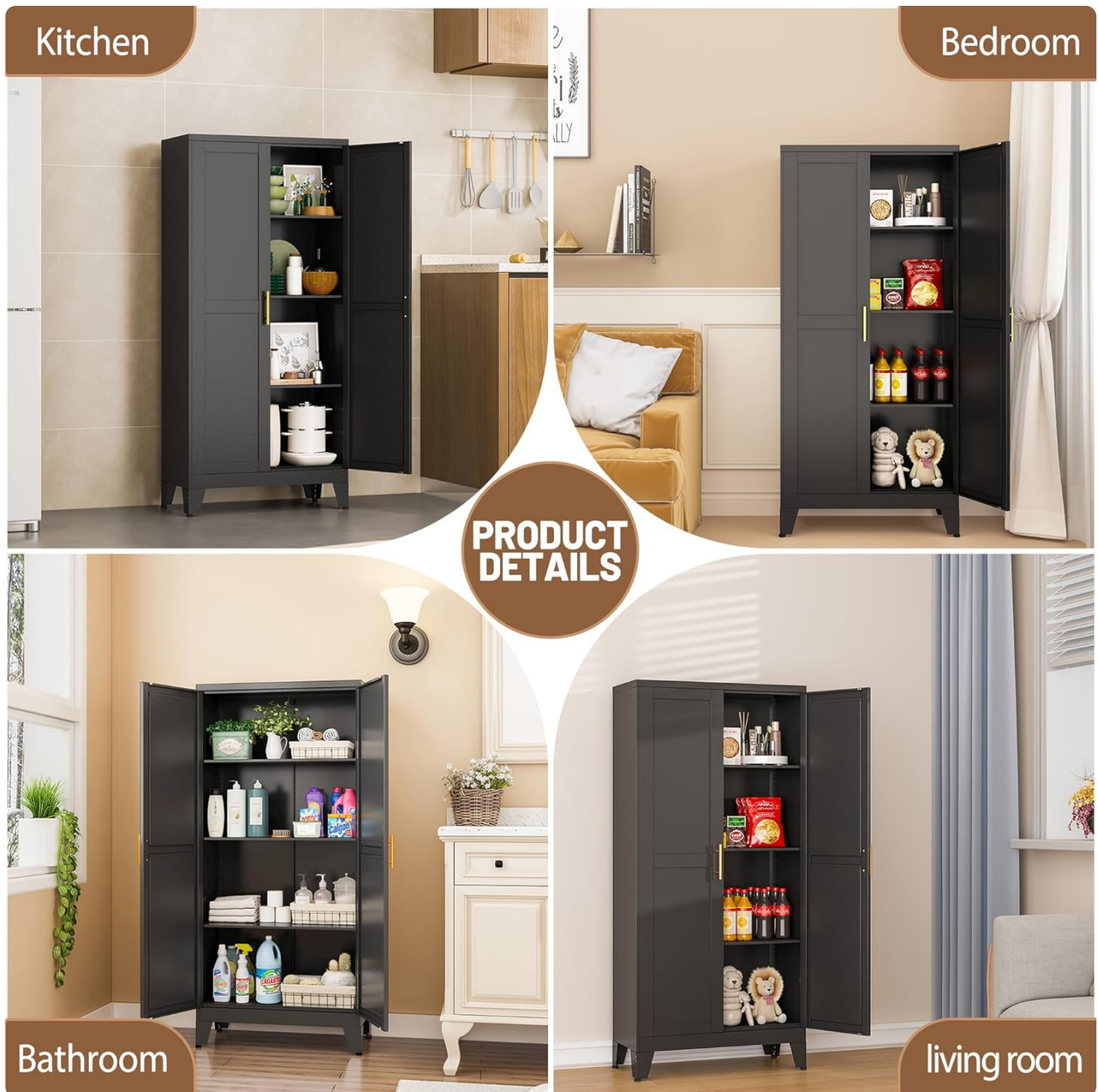
Figure 6: Versatile Use in Various Home Environments