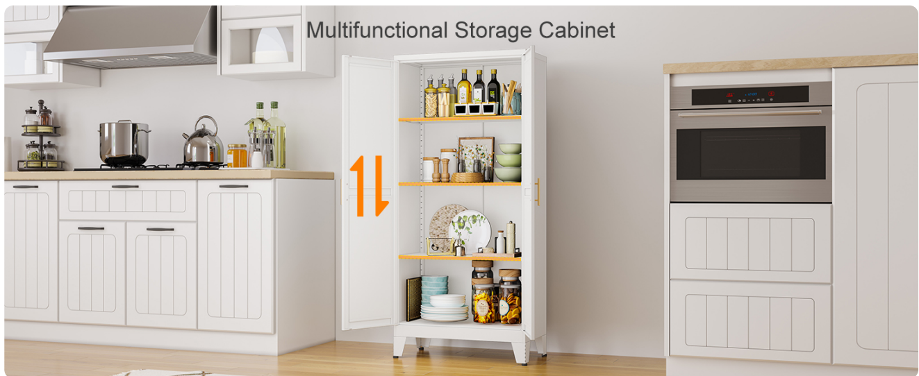
Figure 5: Multifunctional Storage with Adjustable Shelves