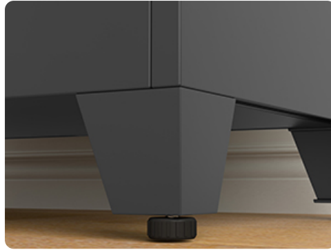
Figure 2: Adjustable Leveling Foot for Stability