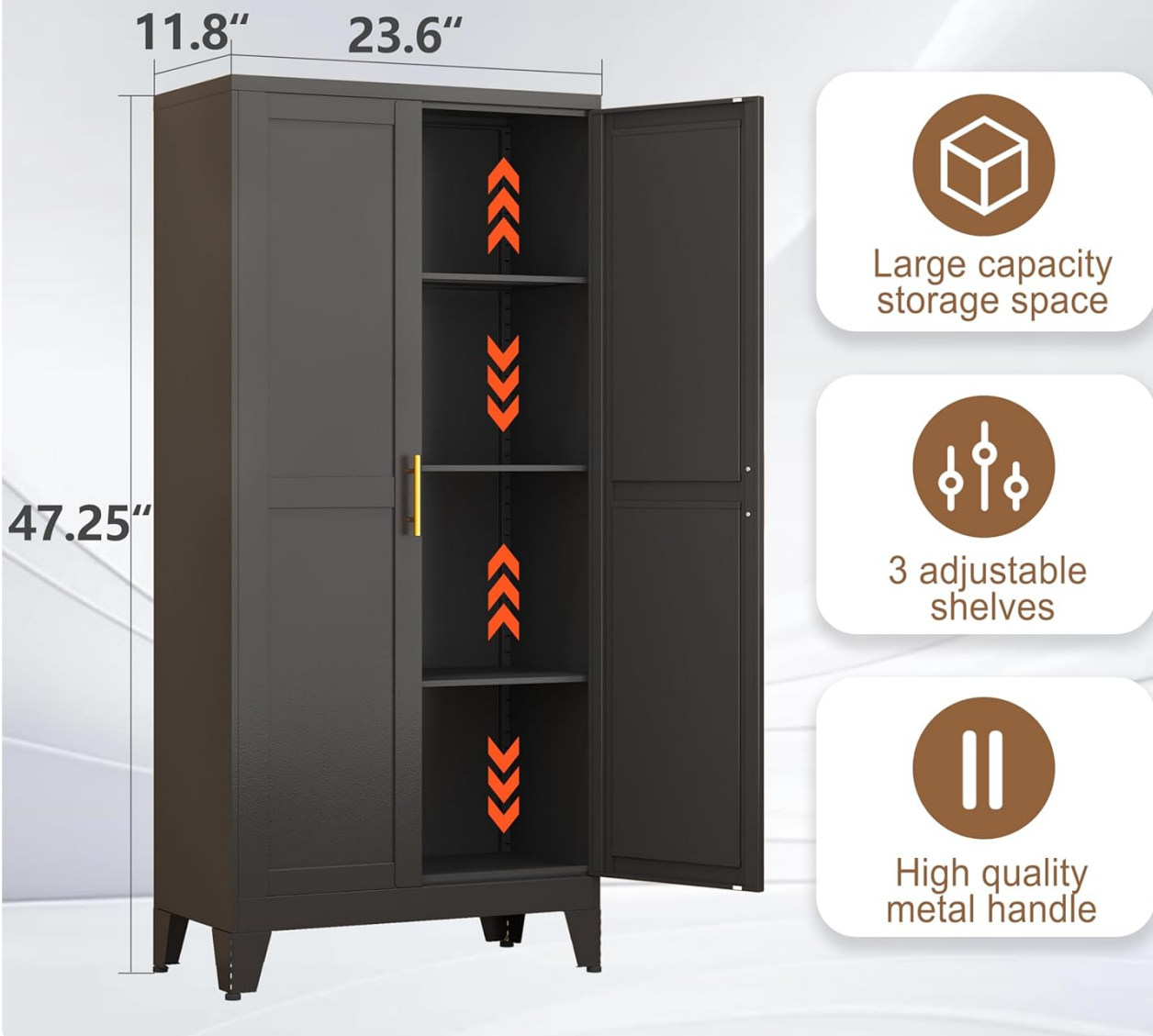
Figure 8: Cabinet Dimensions and Key Features