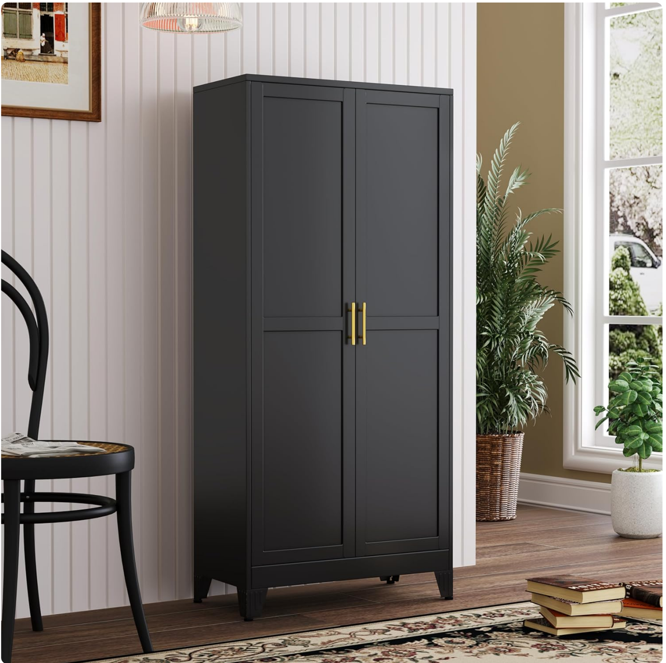
Figure 1: PAOFIN Metal Kitchen Pantry Storage Cabinet (Black, 11.81"D x 23.62"W x 47.25"H)