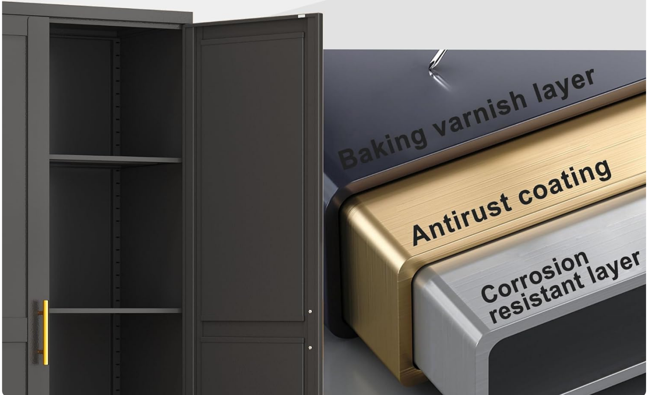
Figure 7: Cabinet Material and Protective Coatings