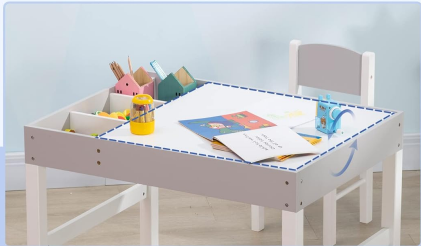
Figure 5.1: The reversible table top for blocks or activities.