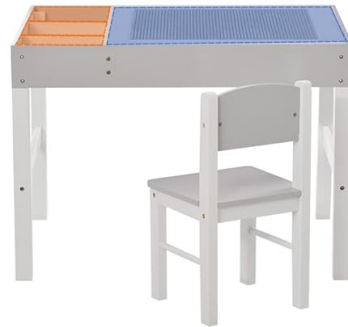
Figure 5.2: Internal storage compartment for books and toys.