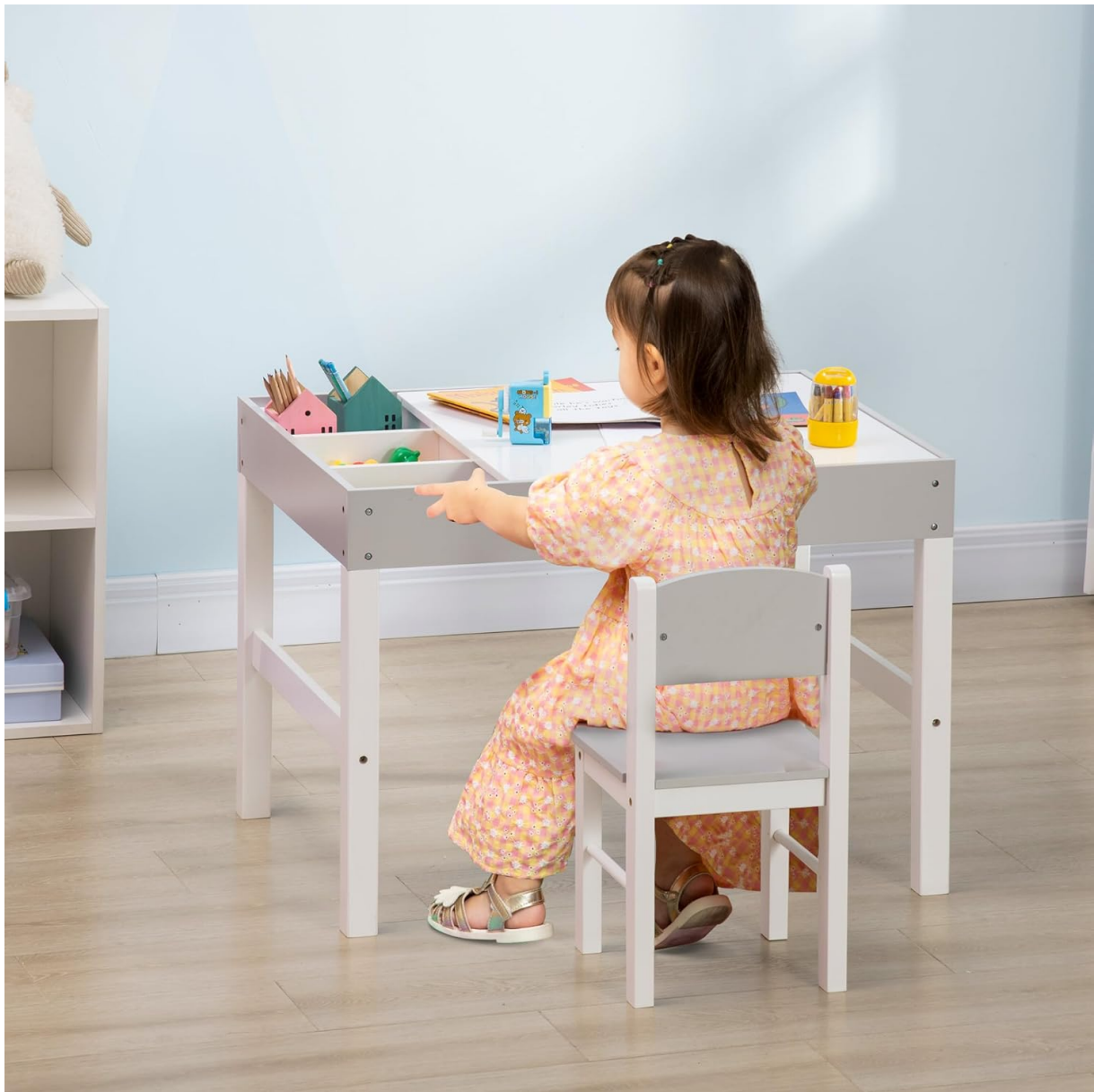
Figure 5.4: Child using the table for creative activities.