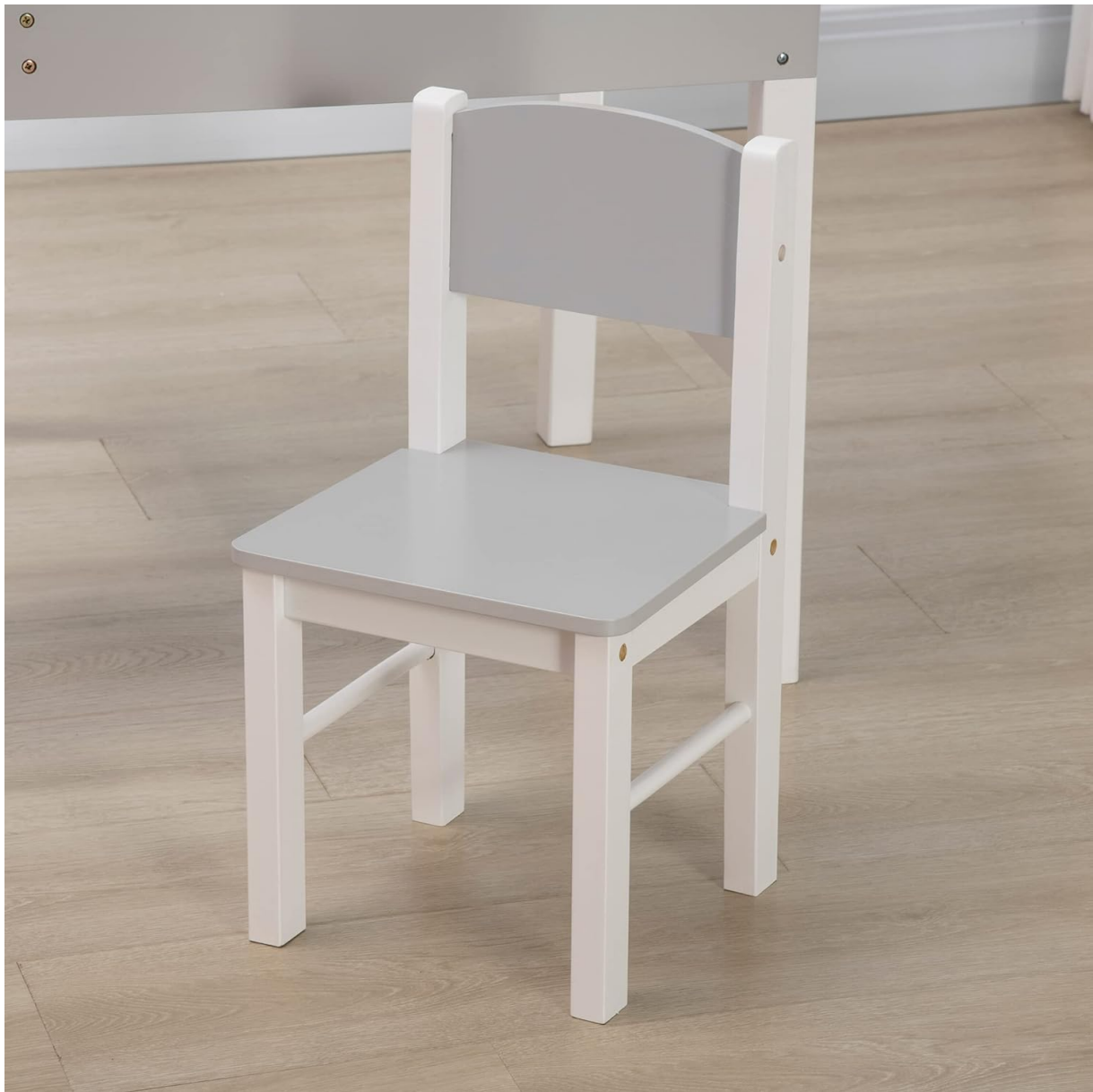
Figure 8.1: The matching chair.