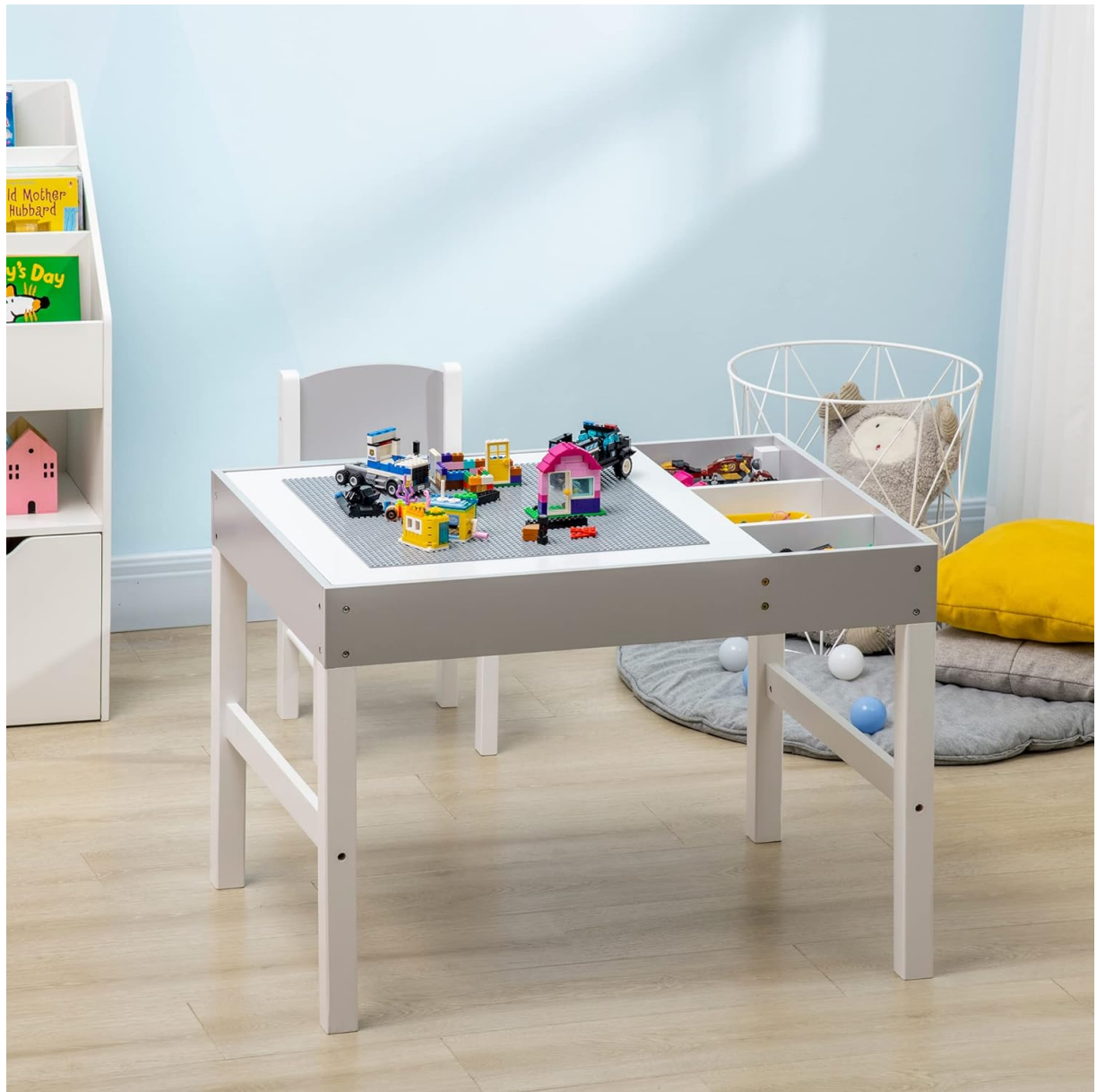
Figure 5.3: Side storage bins for small items.