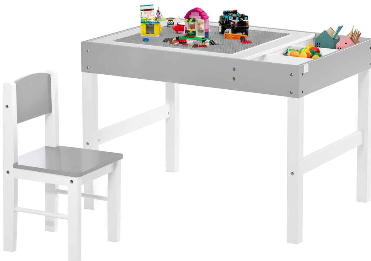
Figure 1.1: The Qaba 2-in-1 Kids Activity Table and Chair Set.

This manual provides essential information for the safe assembly, operation, and maintenance of your Qaba 2-in-1 Kids Activity Table and Chair Set. Please read these instructions thoroughly before assembly and retain them for future reference.