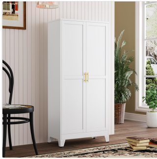
Figure 6.1: Cabinet in a Living Room Setting