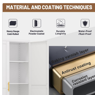
Figure 5.3: Material and Coating Techniques