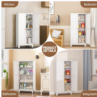
Figure 6.2: Versatile Use Across Different Rooms