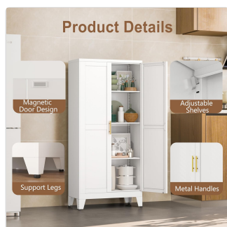
Figure 5.2: Product Details - Magnetic Doors, Support Legs, Adjustable Shelves