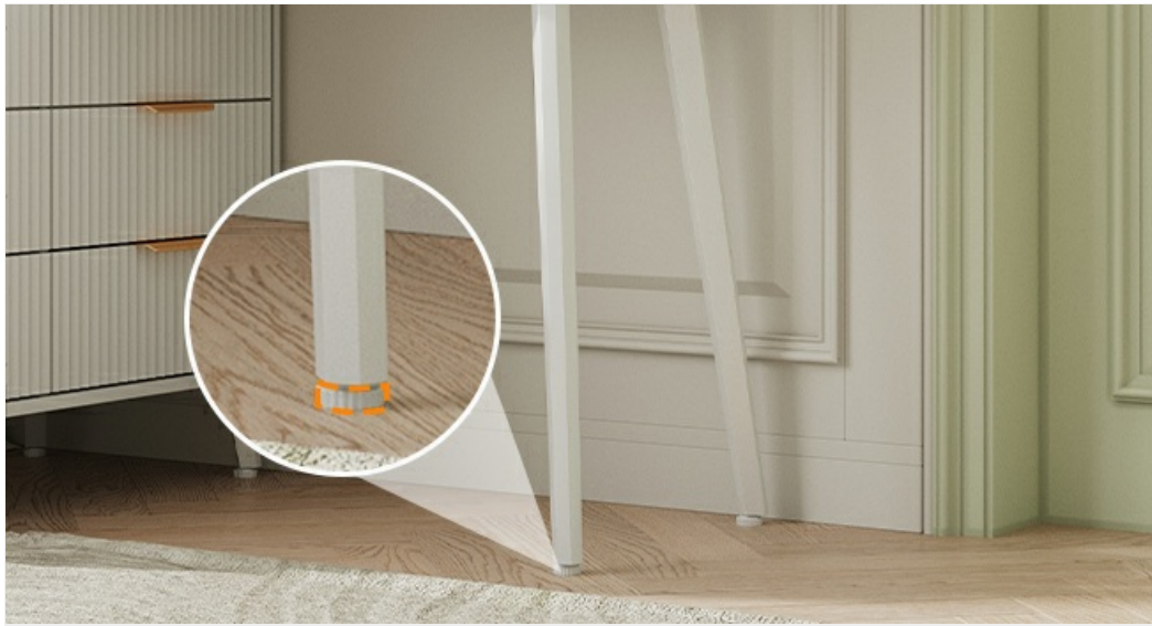
Image: Detail of the adjustable feet on the vanity desk, designed to provide stability on various floor types.

Note: Assembly can be time-consuming. It is recommended to have two people for assembly, and to allocate sufficient time (e.g., 2-6 hours) for completion.