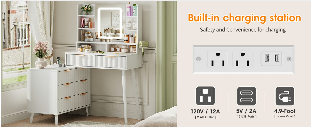
Image: Detailed view of the integrated charging station, highlighting the two AC power outlets and two USB charging ports, with specifications for voltage and amperage.