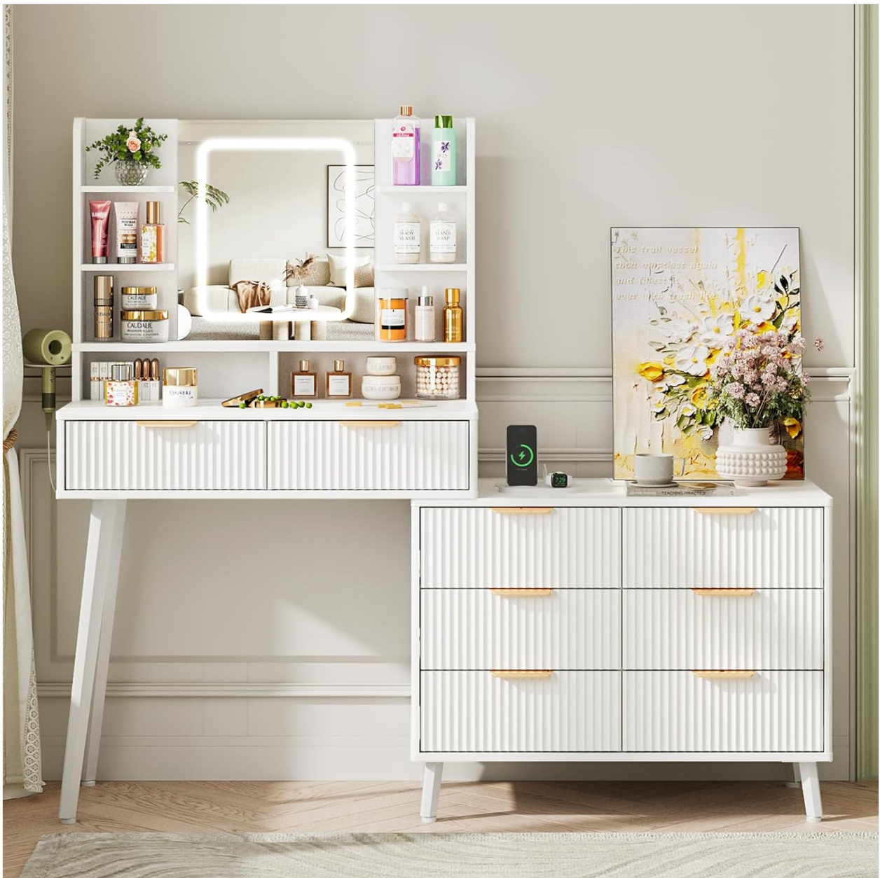
Image: The Maupvit Vanity Desk in a bedroom setting, showcasing its mirror with LED lights, multiple drawers, and open shelves for storage.