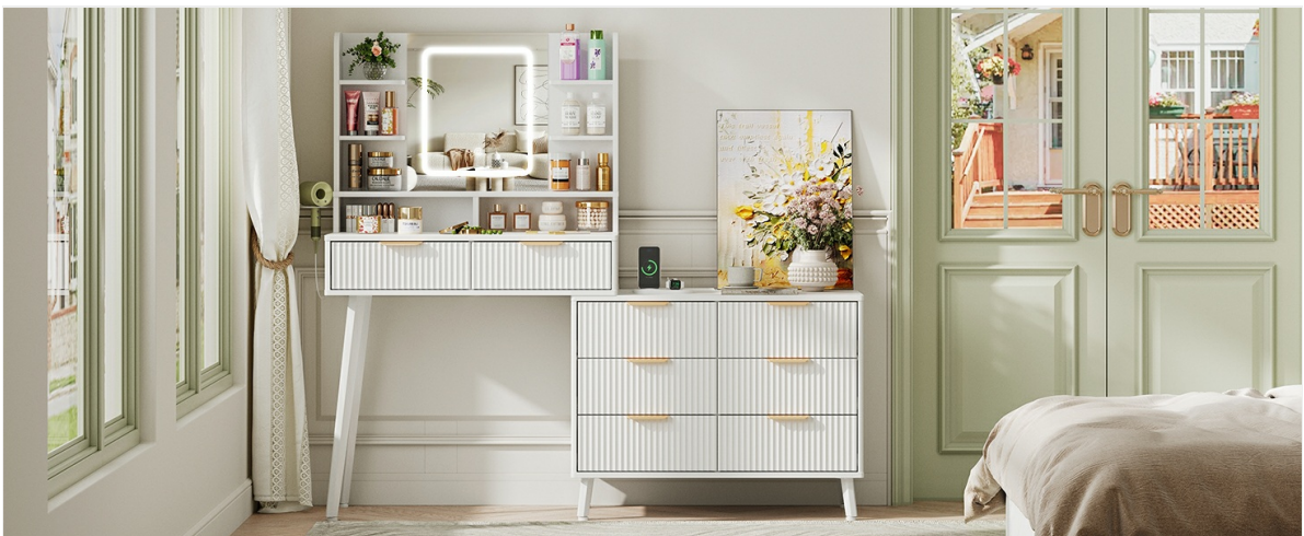
Image: Illustration of the vanity desk's flexible L-shape configuration, showing how the dresser can be positioned on either the left or right side, with an adjustable overall width.