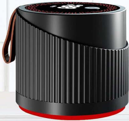
Mason Jar Vacuum Sealer ×1