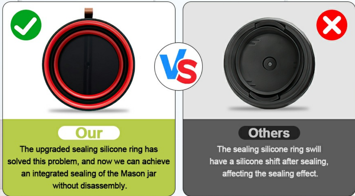
Image: A comparison showing the upgraded integrated sealing silicone ring of this vacuum sealer (left) which prevents shifting, versus other designs (right) where the sealing ring can shift, affecting the sealing effect.