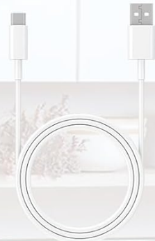
Type-C Cable ×1