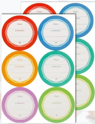
Self-adhesive label × 12