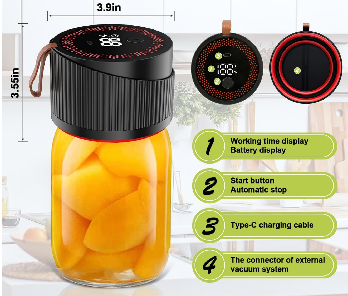
Image: A diagram illustrating the dimensions (3.9in width, 3.55in height) and key features of the electric mason jar vacuum sealer, including the working time/battery display, start button, Type-C charging cable port, and external vacuum system connector.