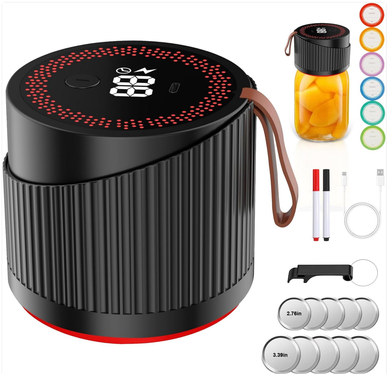
Image: The Riokko Electric Mason Jar Vacuum Sealer Kit, showing the main unit, various jar lids, charging cable, watercolor pens, and a can opener.