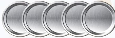
Wide Mason Jar Lid ×5