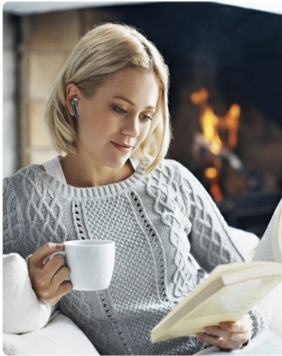
Image 3.2: Examples of wearing the chalh J66 earbuds during various activities.