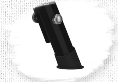
Non-Slip Foot Pads