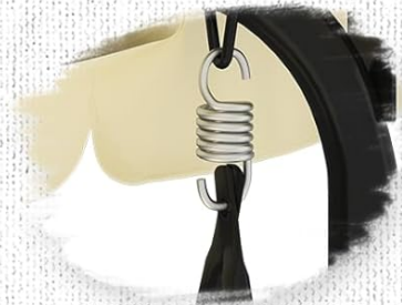
Strong Spring Hooks