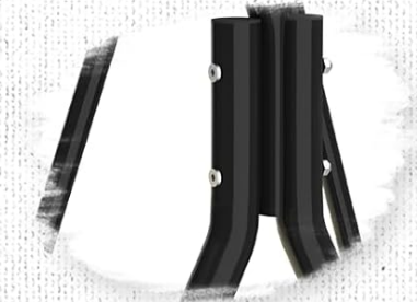
Solid Steel Frame

Image: Illustration demonstrating the adjustable canopy feature, highlighting the knob used to change the sunshade angle for sun protection, fade resistance, and drizzle proofing.