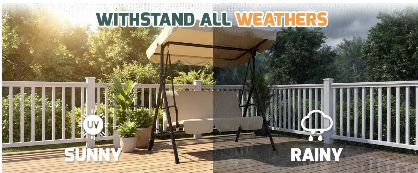
Image: The swing chair designed to withstand various weather conditions, including sunny and rainy environments, ensuring durability.