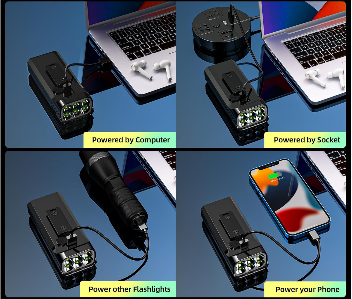
Image: Demonstrates the versatile USB charging capabilities of the Cuytgsg bicycle light, showing it can be charged via computer, wall socket, or even used to power other flashlights or charge a smartphone.