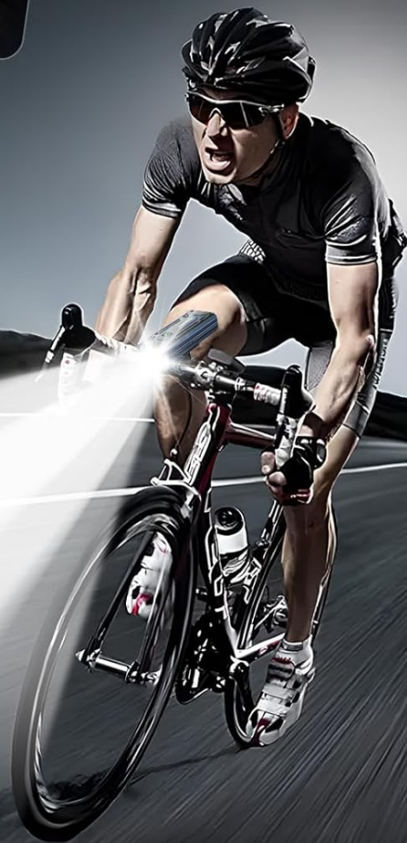
Image: Visual representation of the Cuytgsg bicycle headlight's five lighting modes: High, Mid, Low, Strobe, and SOS, demonstrating their different light patterns and intensities.