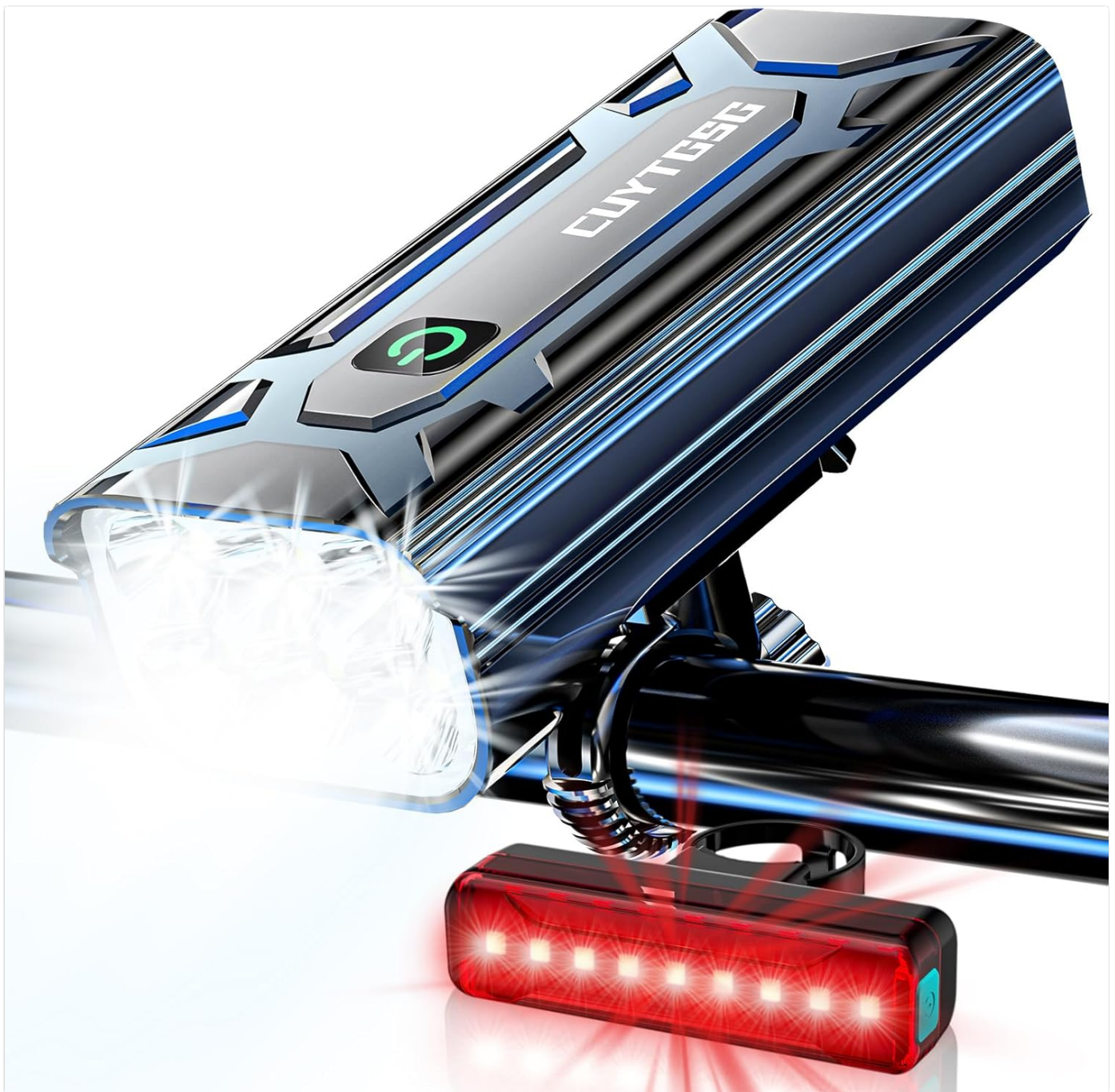
Image: The complete Cuytgsg bicycle light set, showing the main headlight unit and the accompanying red taillight.