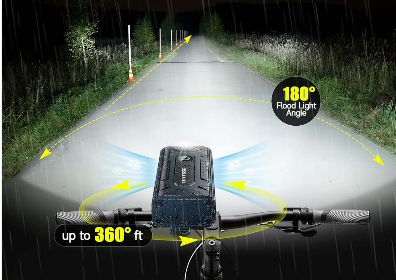
Image: Key features of the Cuytsg bicycle light, including its waterproof, drop-proof, heat dissipation, and anti-corrosion properties, along with its 180-degree wide flood light angle.