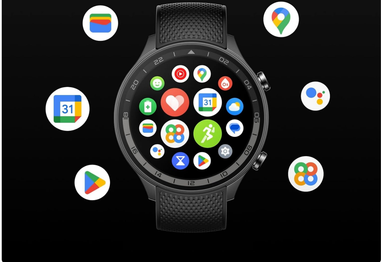
Image 3.1: The OnePlus Watch 2R displaying a watch face on a wrist.

Unlock the full potential of Google Play on your smartwatch. Browse for new apps, sync apps with your smartphone, and upgrade your watch face, all on your wrist. Skip tracks on Spotify, plan your next run on Strava, or track your shuteye with Sleep Tracker. Watch 2R makes your life easier, healthier, and more fun.