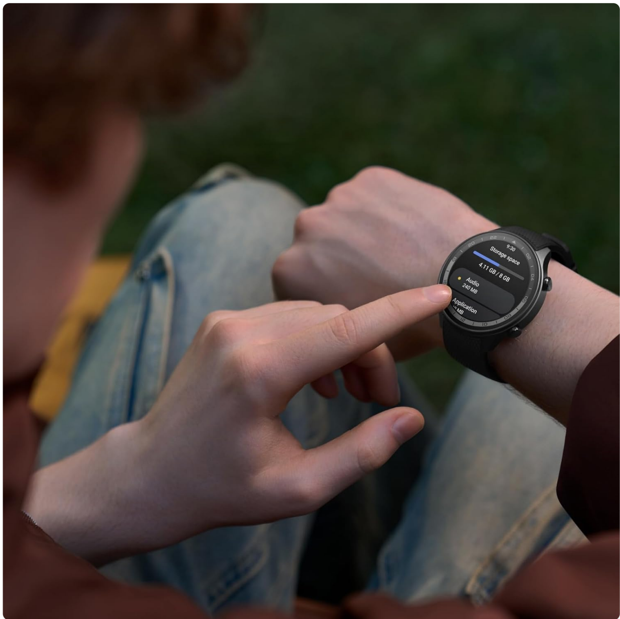
Image 5.1: The OnePlus Watch 2R showing various health metrics on its display.