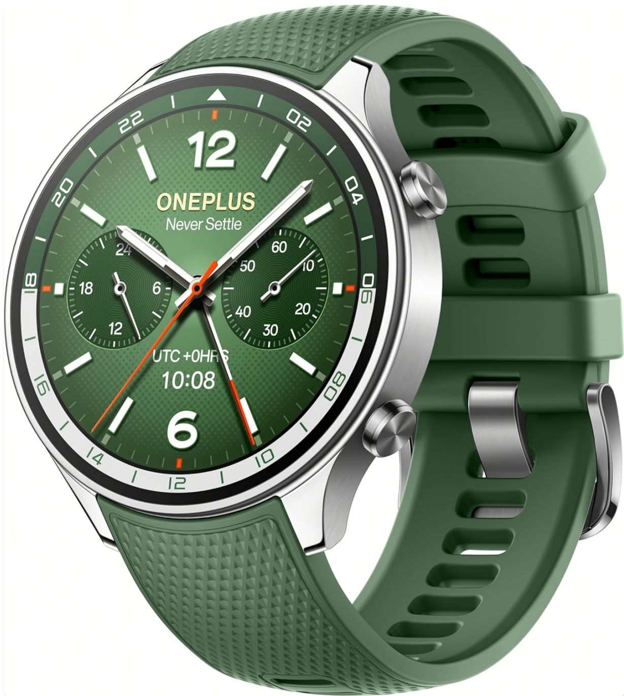
Image 1.1: OnePlus Watch 2R in Forest Green with its silicone strap.

Key features include a 1.43-inch AMOLED display, up to 100 hours of battery life, and comprehensive health tracking capabilities. This guide will walk you through setup, operation, and maintenance.