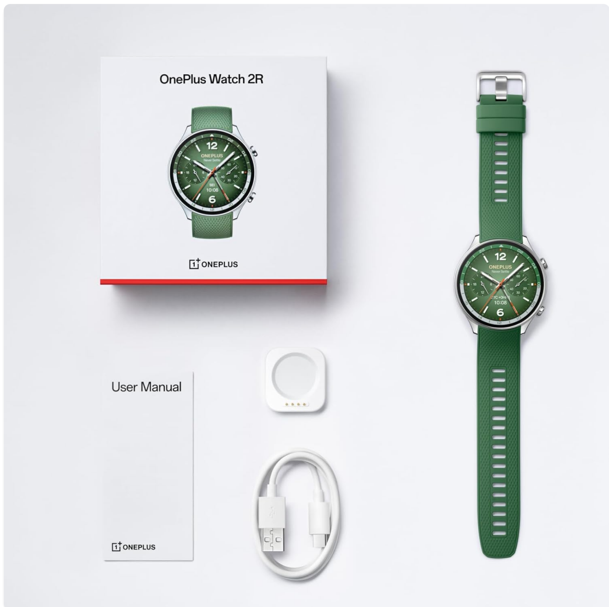
Image 10.1: The complete package contents of the OnePlus Watch 2R.