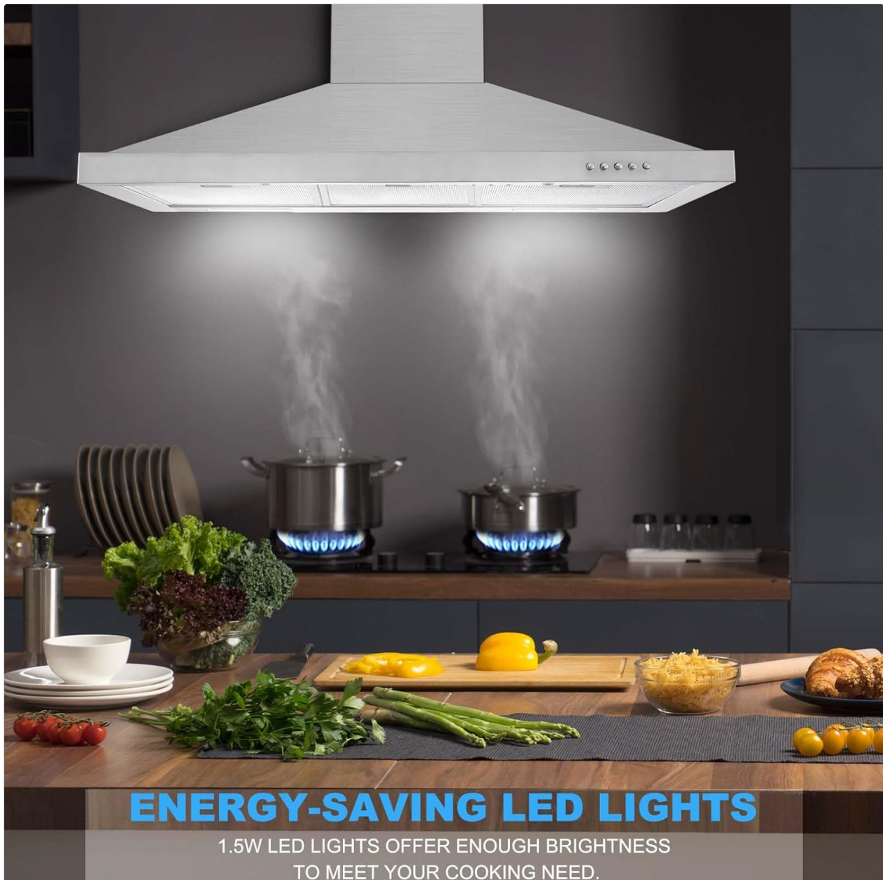
Image: The Tiesay Range Hood installed above a stove, with its LED lights brightly illuminating the cooking area where pots are simmering.