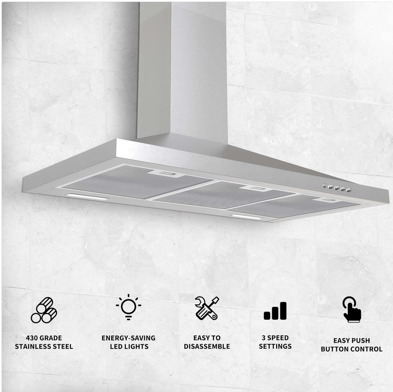
Image: Overview of the range hood's features, highlighting 430-grade stainless steel, energy-saving LED lights, easy disassembly, 3-speed settings, and easy push-button control.