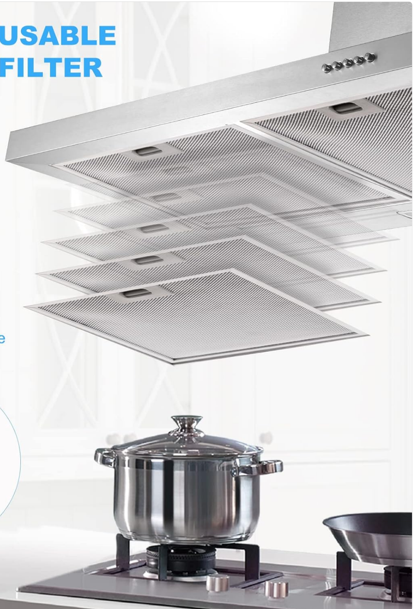
Image: Close-up view of the 5-layer reusable aluminum mesh filter, highlighting its cleanability, durability, strength, stability, and corrosion resistance.