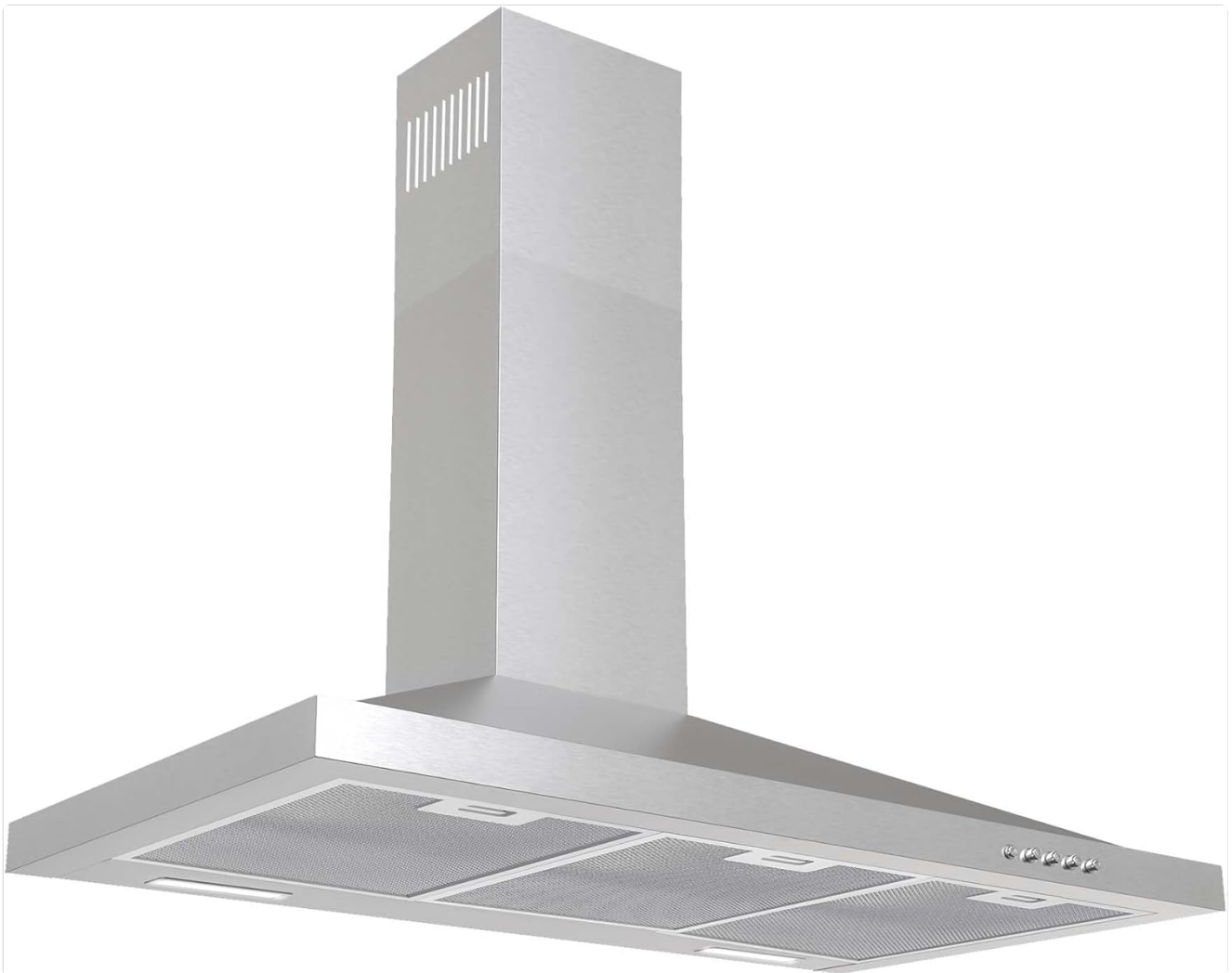
Image: Tieasy 36-inch Wall Mount Range Hood, front-angled view, showcasing its stainless steel finish and mesh filters.