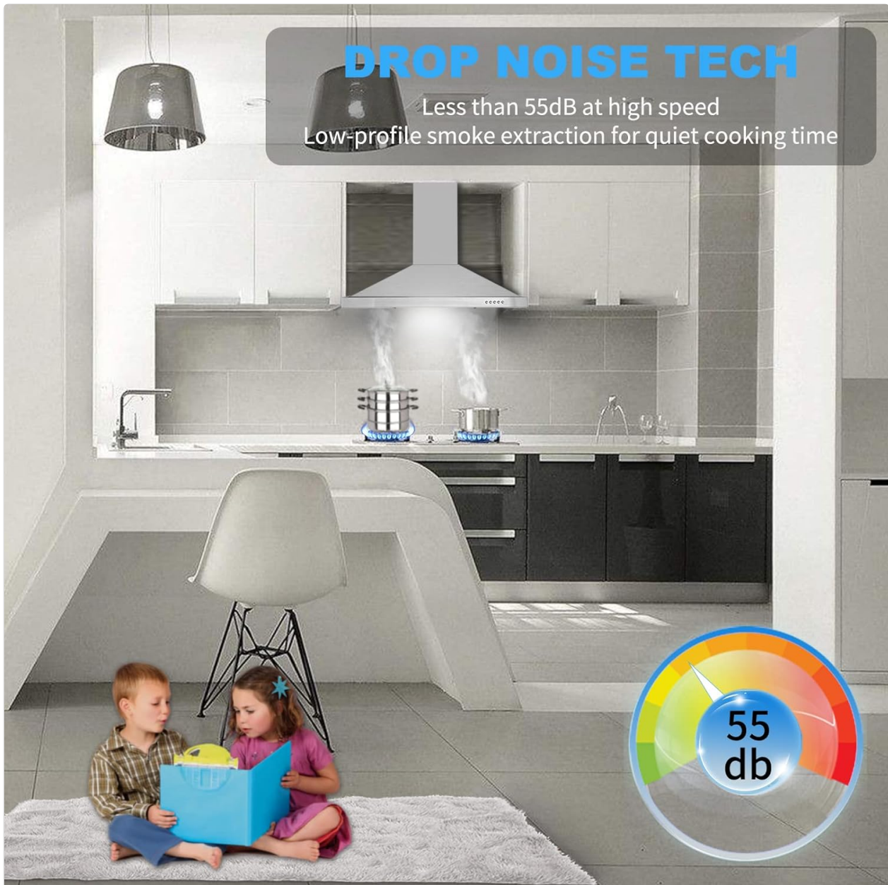
Image: Graphic indicating the low noise level of the range hood, less than 55dB at high speed, for a quiet cooking environment.