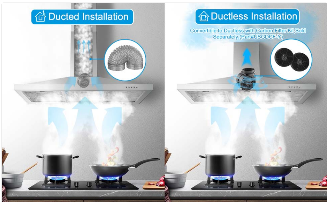
Image: A side-by-side comparison illustrating the setup for ducted installation (venting outside) and ductless installation (recirculating with carbon filters).