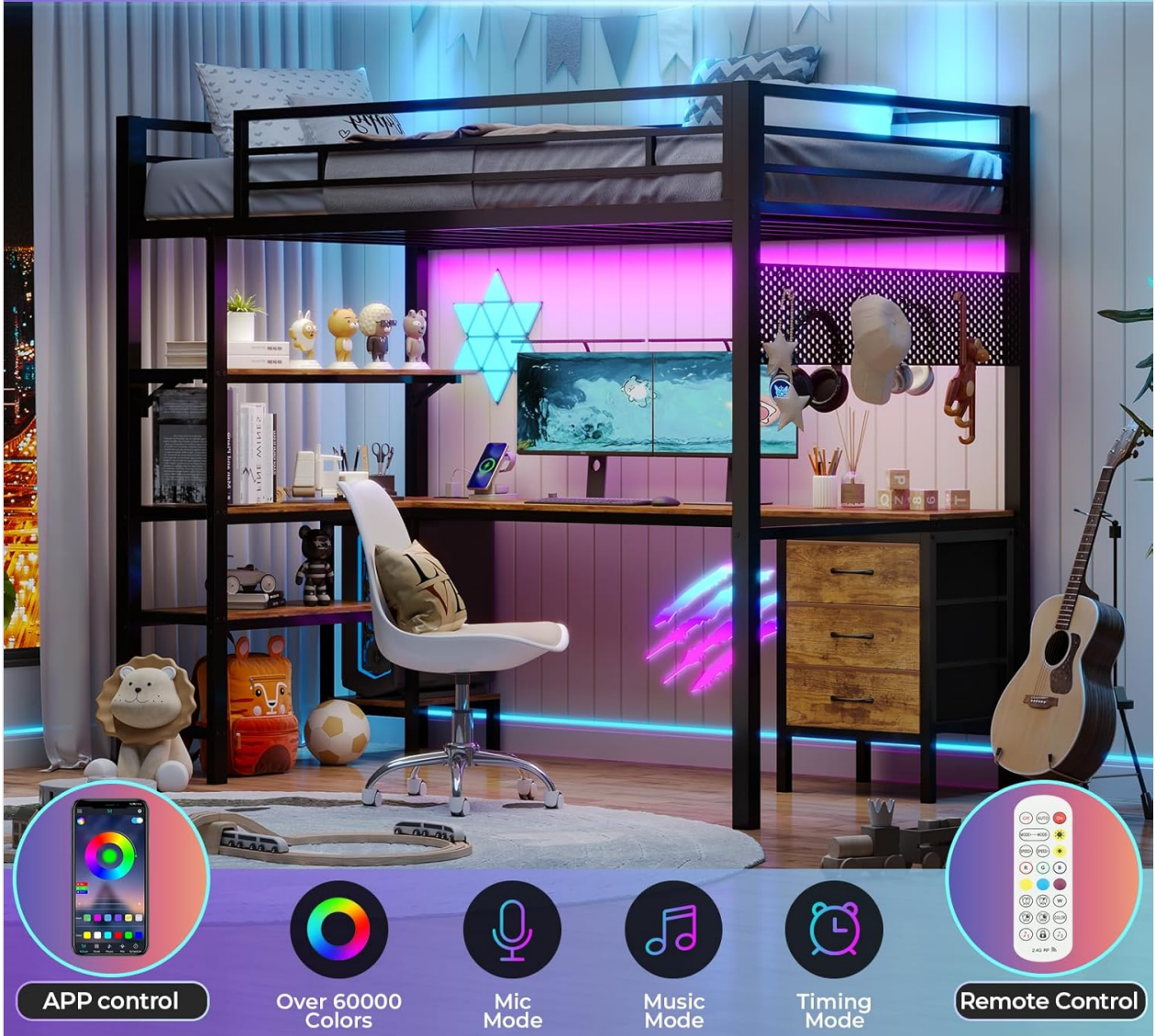
Image: The loft bed illuminated with vibrant RGB LED lights, showcasing a gaming setup on the L-shaped desk below.