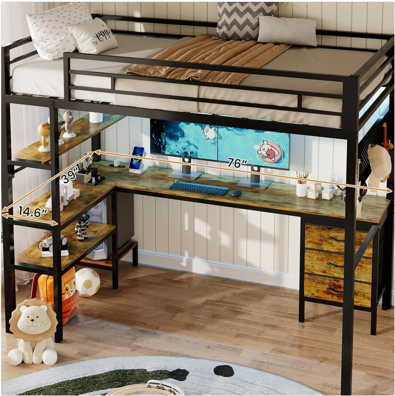
Image: The BTHFST Twin Loft Bed featuring an L-shaped desk with multiple monitors, demonstrating the spacious work area.