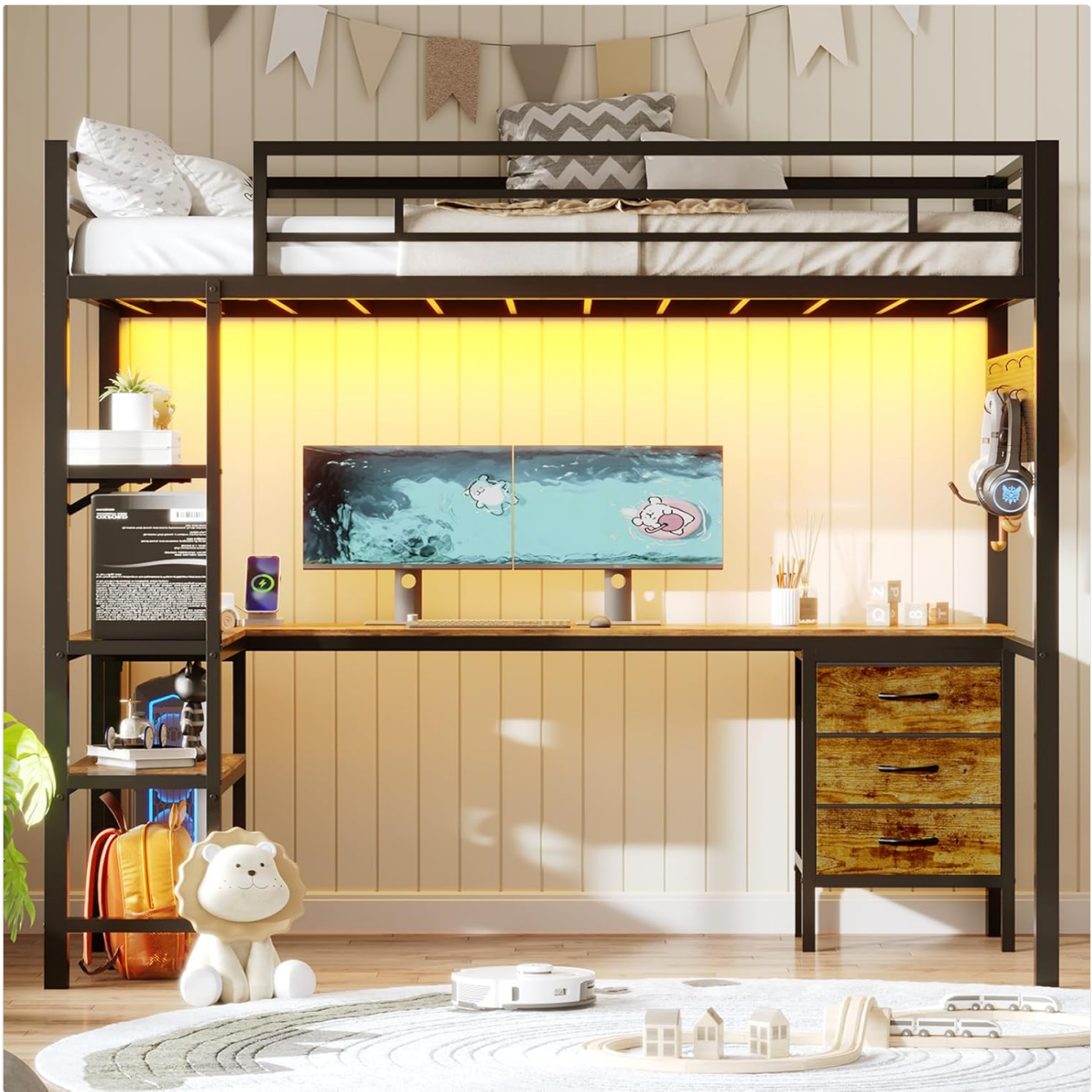
Image: The loft bed with its RGB LED lights set to a warm yellow glow, providing a cozy atmosphere for study or relaxation.